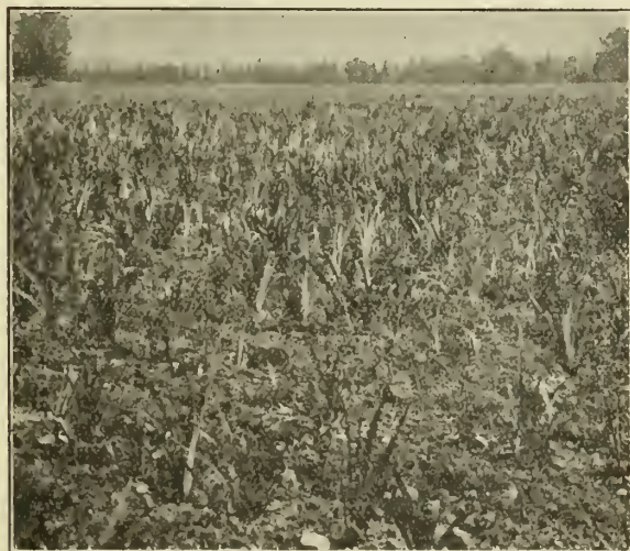
20 Acres of Bearded Irises—20 Acres of Japanese Irises.