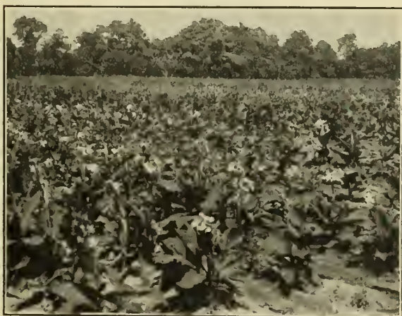
A Field of Childs' Famous Cannas.