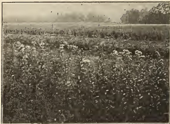
A View Across Our Lily Fields.