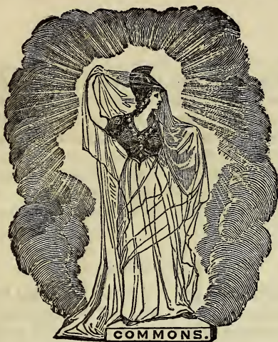
BRITANNIA, based on the Commons, throwing off the trammels of Corruption.