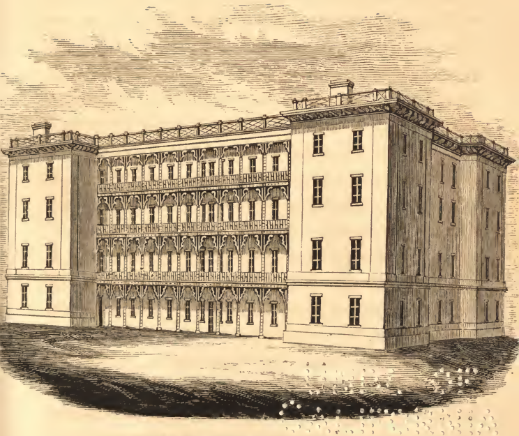
UNITED STATES MARINE HOSPITAL.