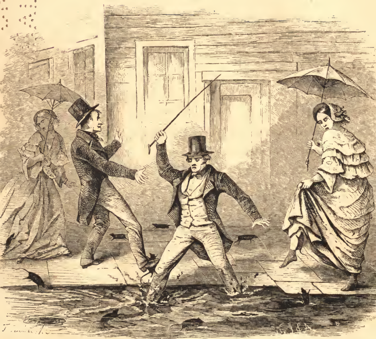
A STREET SCENE ON A RAINY NIGHT.