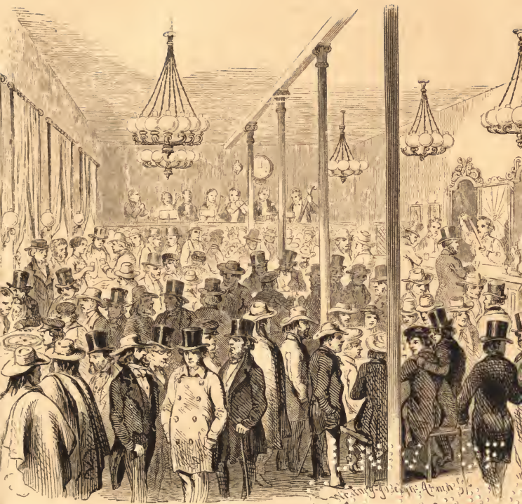
INTERIOR OF THE EL DORADO.