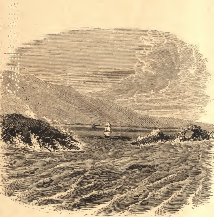
ENTRANCE TO THE GOLDEN GATE.