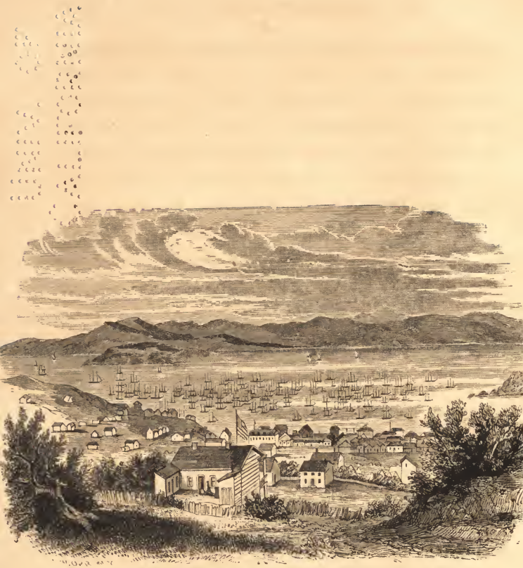
SAN FRANCISCO IN 1849, FROM THE HEAD OF CLAY-STREET.