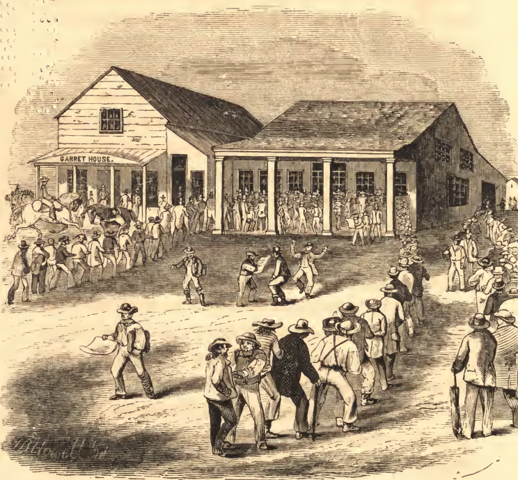
THE POST-OFFICE, CORNER OF PIKE AND CLAY STREETS.