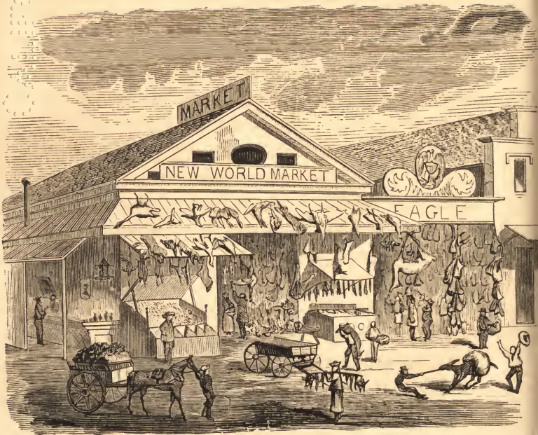
NEW WORLD MARKET, CORNER OF COMMERCIAL AND LEIDSDORFF STREETS