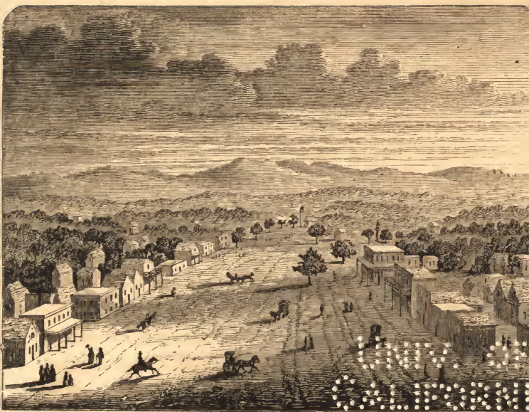
CITY OF OAKLAND.