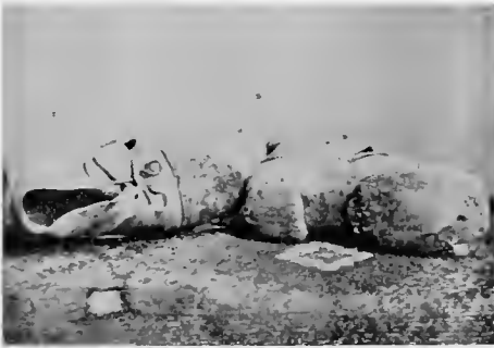
OLD SHOES OF CAPT. H. BAXTER QUIMBY.