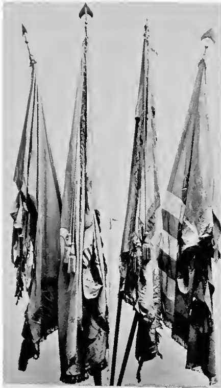
COLORS OF THE NINTH REGIMENT, N. H. V.