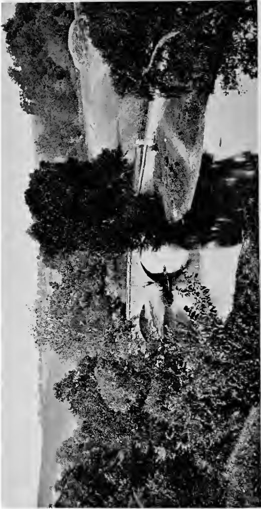
THE STONE BRIDGE, ANTIETAM CREEK, 1890.