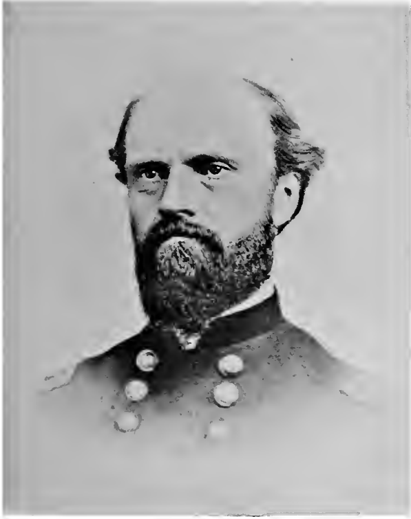
GEN. S. G. GRIFFIN.