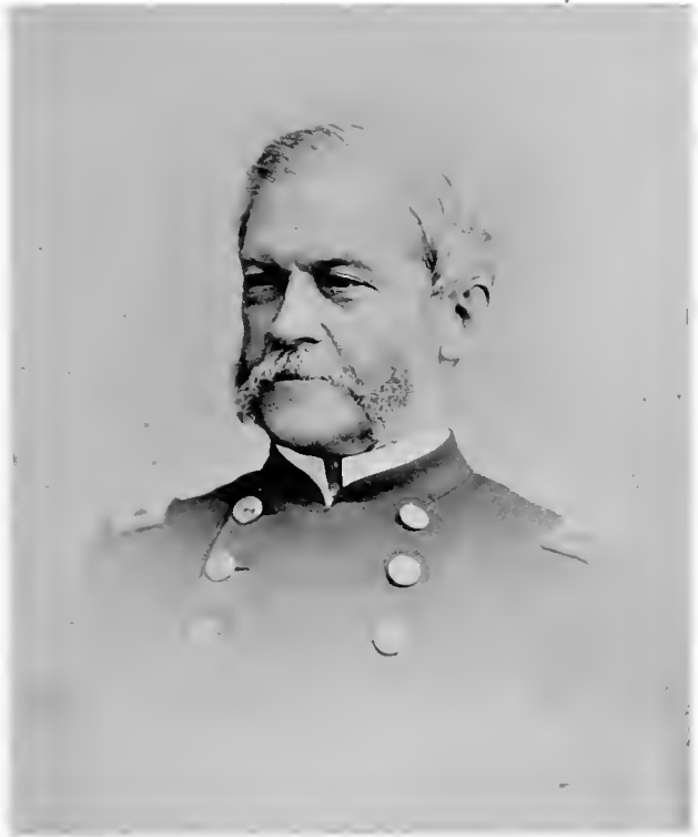
GEN. J. G. PARKE.