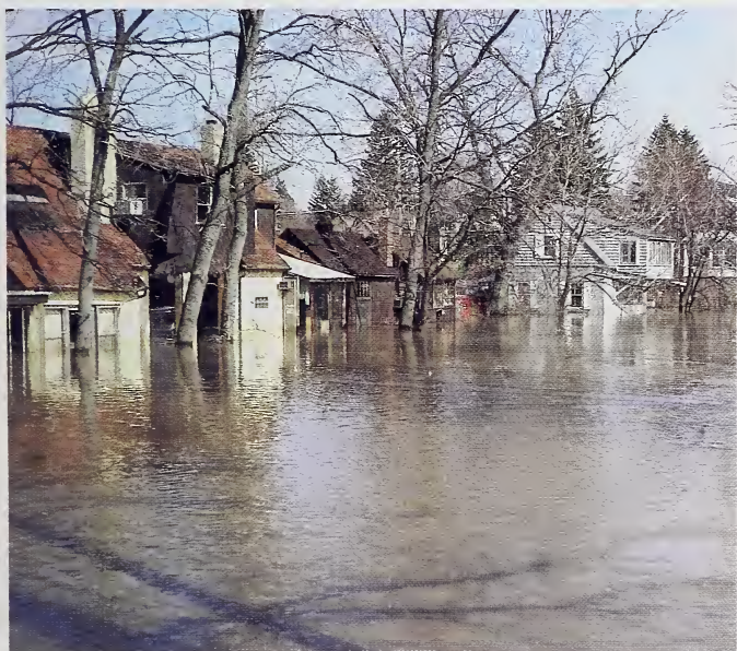
Building on a flood plain is risky.

In addition to soil surveys, the Soil Conservation Service can provide other information about floods and about measures that can reduce flood damage.