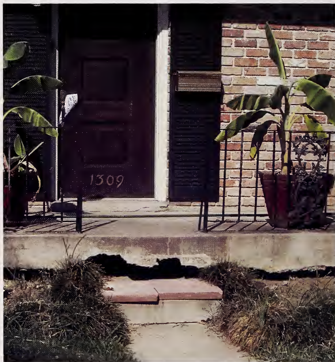
When drained and used as homesites, organic soils can subside, endangering the structure.

The soil survey indicates whether the mapped soil is organic or mineral. It estimates the amounts of sand, silt, and clay in each mineral soil. It indicates whether the soil has a potential for shrinking and swelling or has other properties that may cause instability.