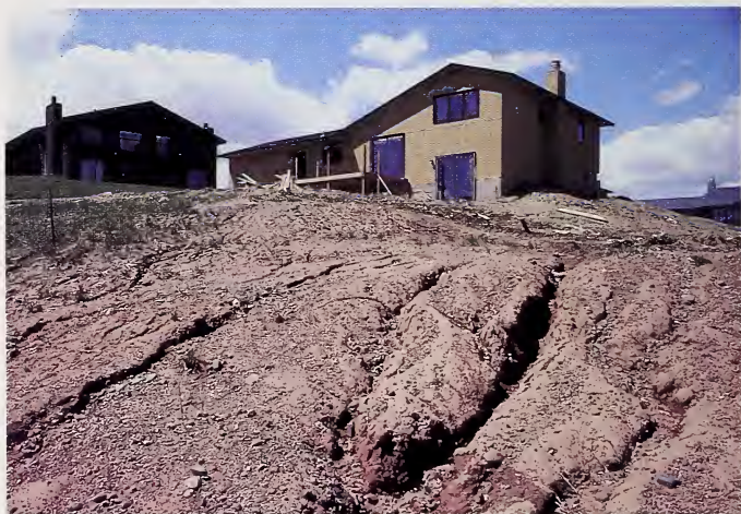
Erosion control is important even before you move in.

Mulch, sediment traps, and a temporary cover of fast-growing grasses help to control erosion on construction sites. SCS personnel can provide information on these and other measures for controlling erosion on homesites.