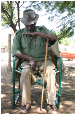
Figure: An Elder Tells a Tale.