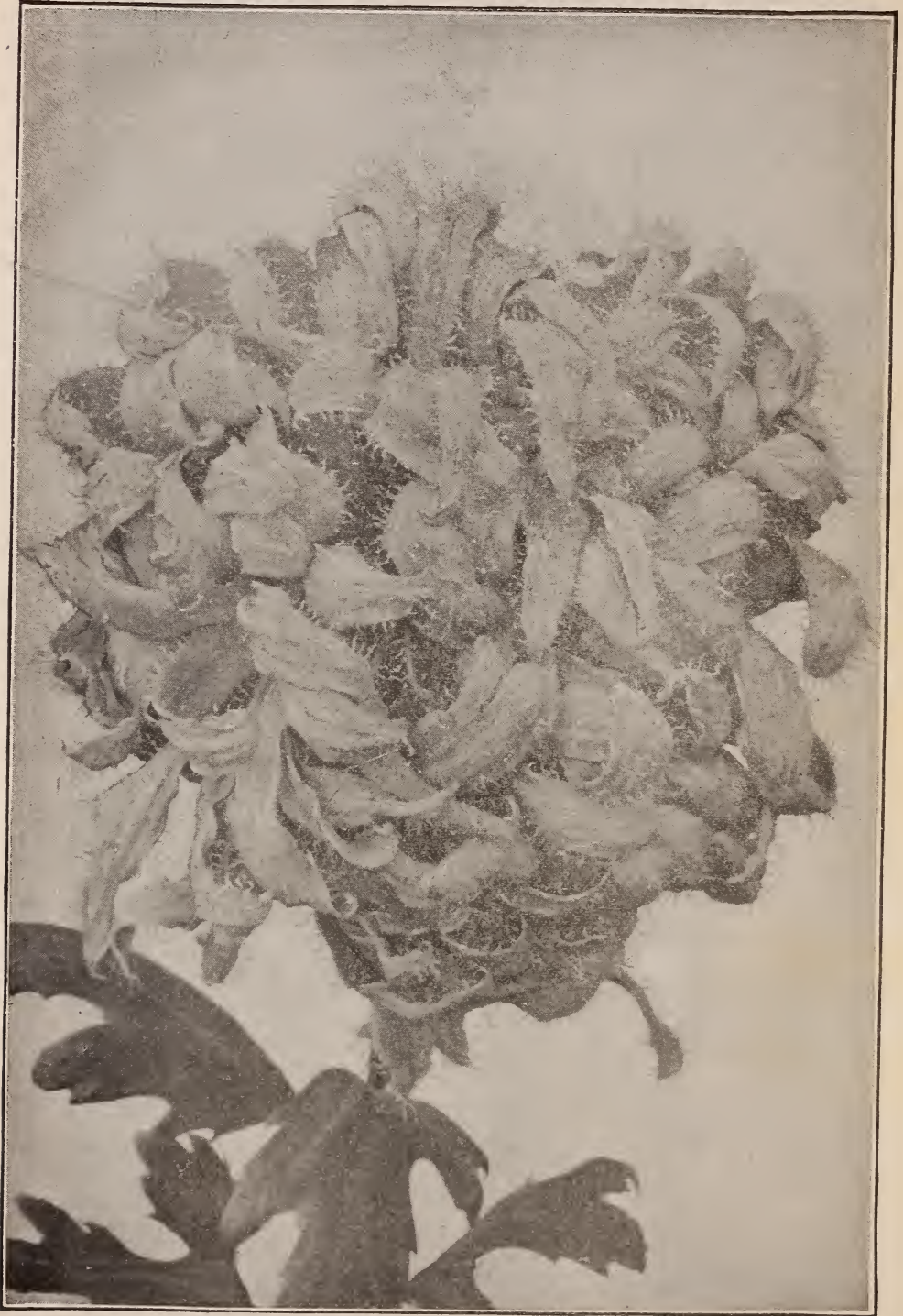
W. A. MANDA—The Golden Hairy Chrysanthemum. The grandest introduction of 1892.