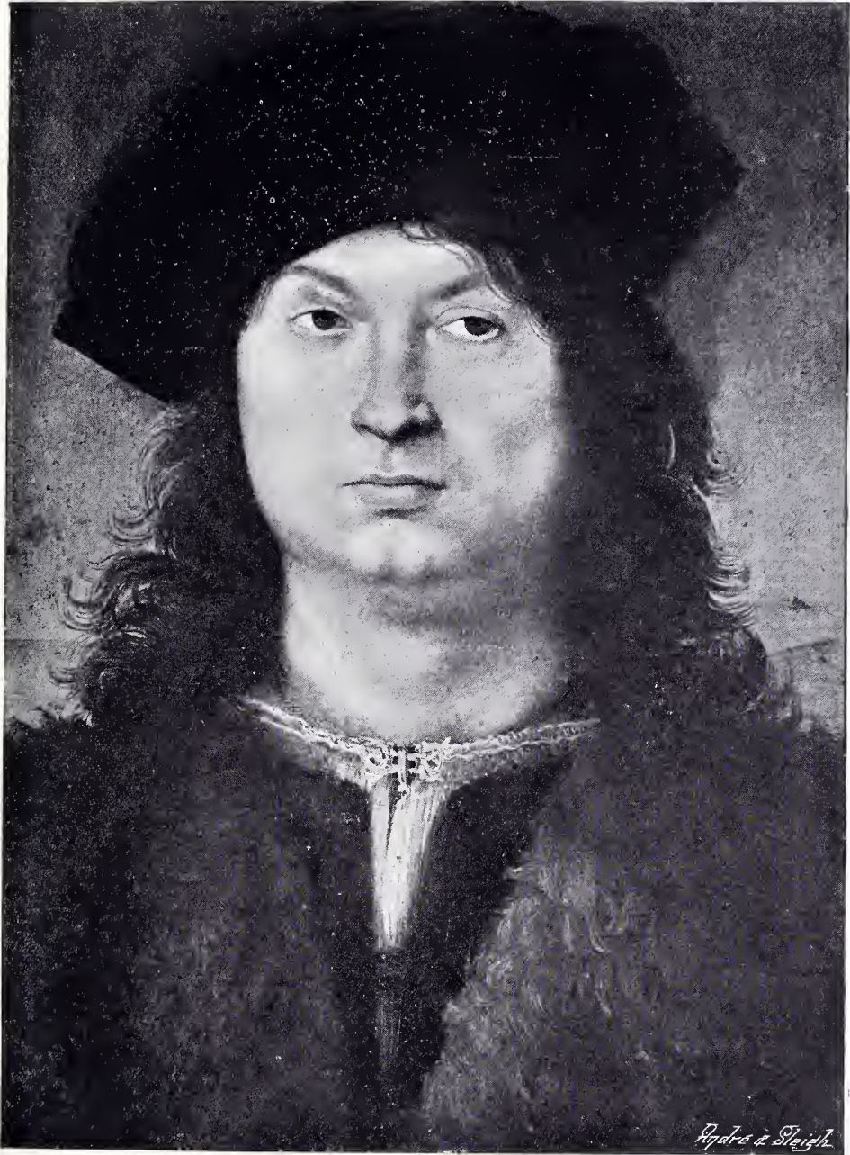
Portrait of Perugino. By Raphael. In the Borgese Gallery, Rome.