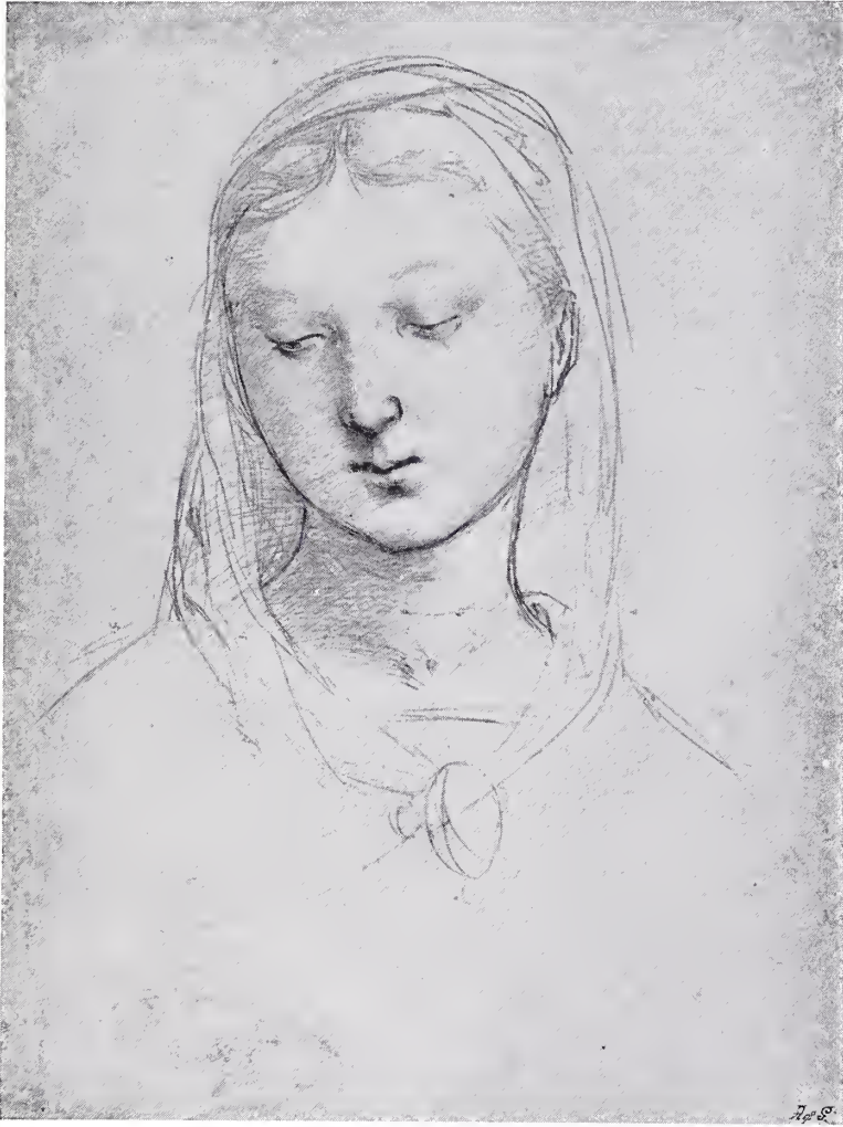
Madonna. From a Drawing by Raphael. In the Malcolm Collection.

reading of the MS., which made it appear that Giovanni Santi was alive when the letter was written. But, as the last editor of Vasari, Professor Milanesi, has pointed out, the word which Bottari gives as so ( il padre