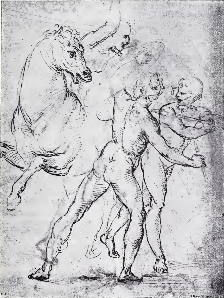
Group in the Venice Sketch-book, from Leonardo's Battle of the Standard. By Raphael.

time, Michelangelo's mastery of the human frame made a profound impression upon his mind, and he applied himself with ardour to learn