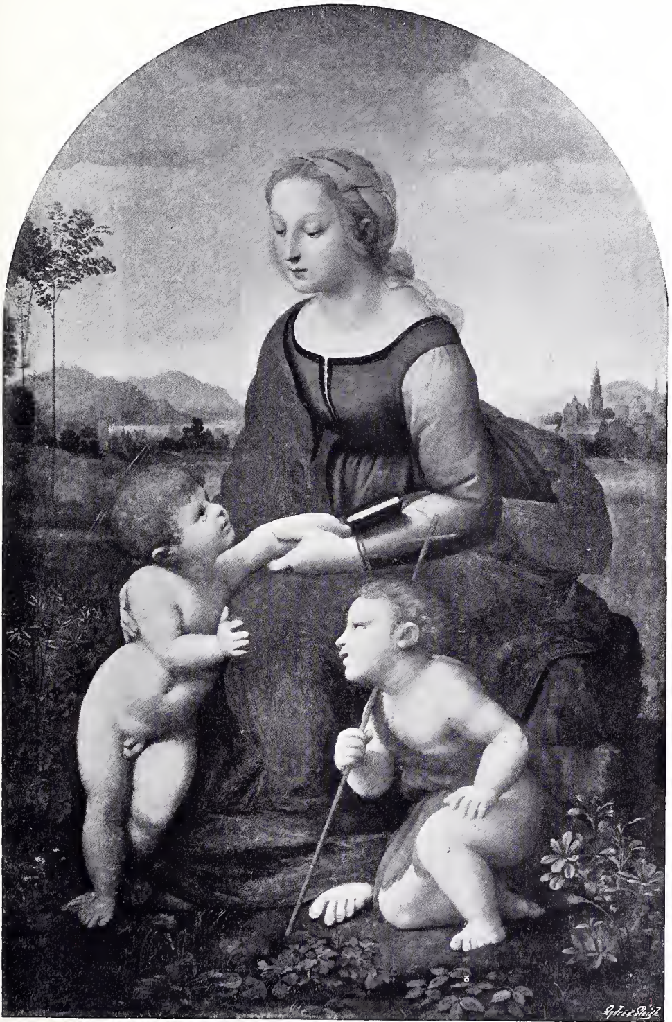
La Belle Jardinière. By Raphael. In the Louvre.