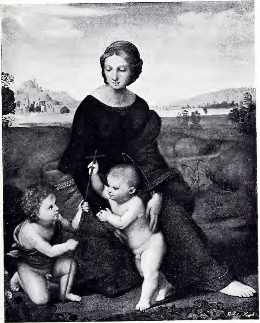
The Madonna del Prato. - By Raphael. Belvedere Gallery, Vienna.