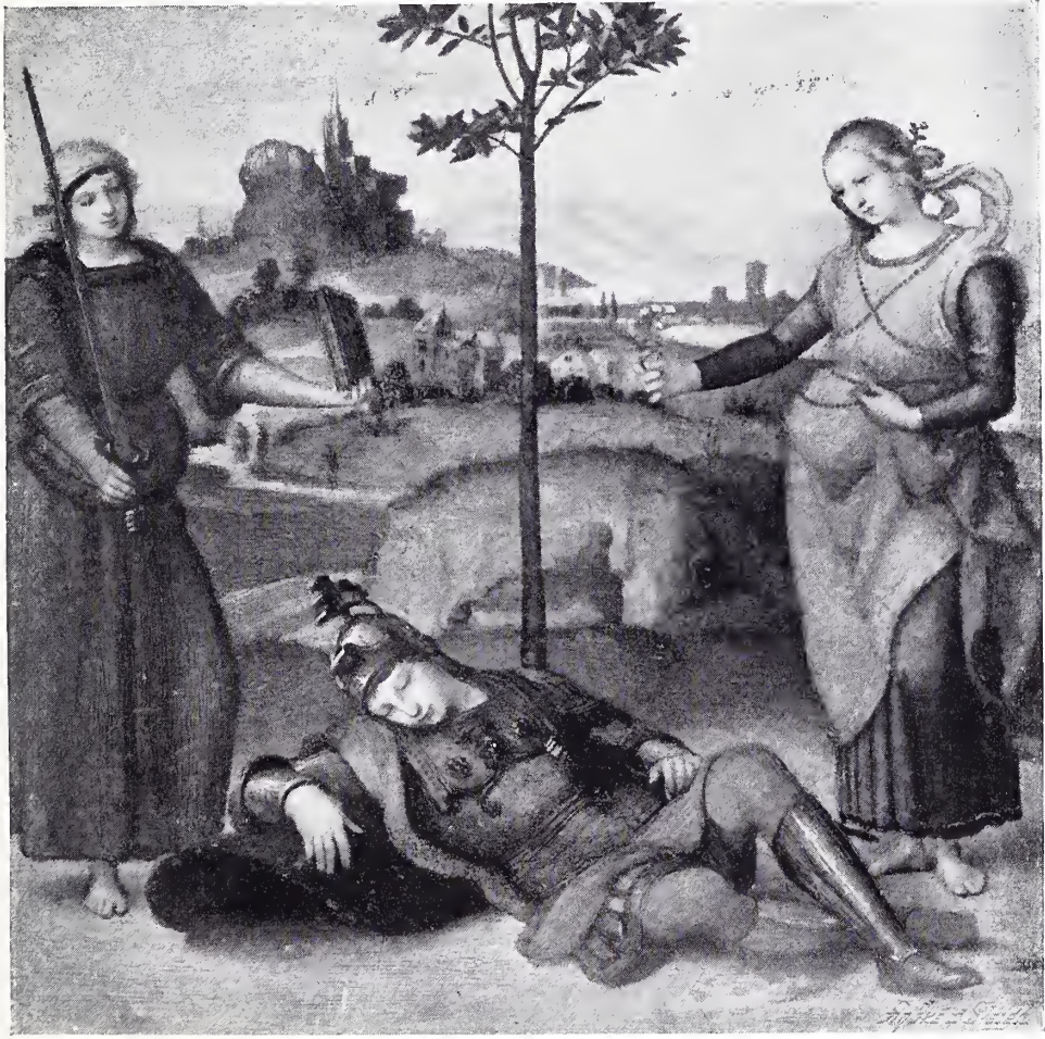
The Vision of a Knight. By Raphael. National Gallery.

the City of Dis in the background, and the poor souls tortured by cruel demons or wandering to and fro under the weight of their leaden capes, "like the hooded monks of Cologne," are evidently borrowed from Dante's Inferno . So exact is the rendering of the torments endured