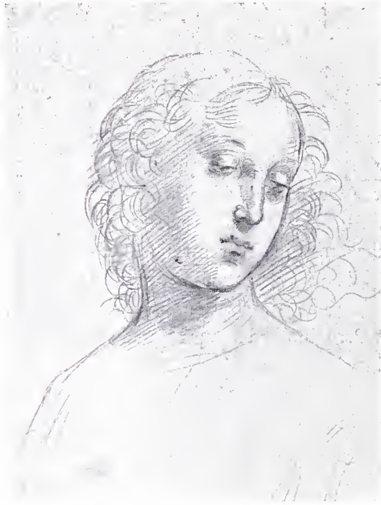
Head of an Angel. Study for the Coronation of the Virgin. By Raphael. British Museum.

Raphael's next important work was the Coronation of the Virgin , now in the Vatican Gallery. This altar-piece was painted in 1502, by order of a widowed lady of the Oddi family, for a chapel which she had endowed in the cathedral-church of Perugia. The design of the upper part, if not