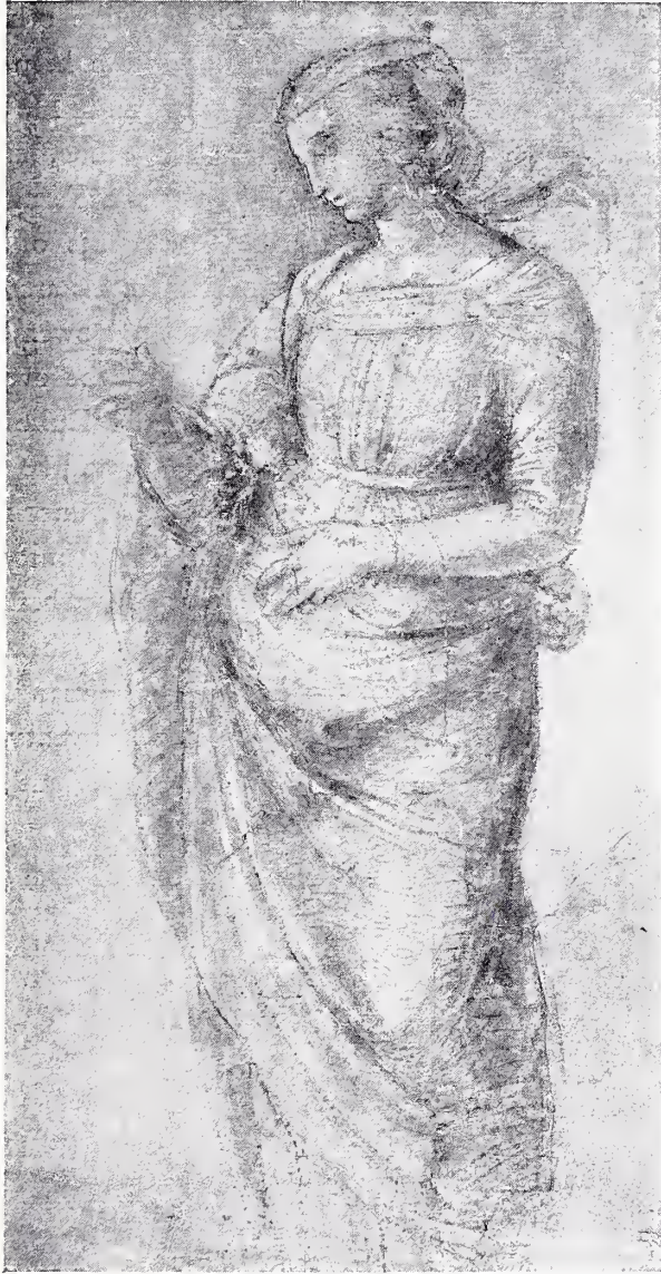
Sta. Apollonia. By Raphael. Habich Collection.

of this period as a rule excel the finished pictures in form and beauty of expression. Nothing, for instance, can be finer than the Santa