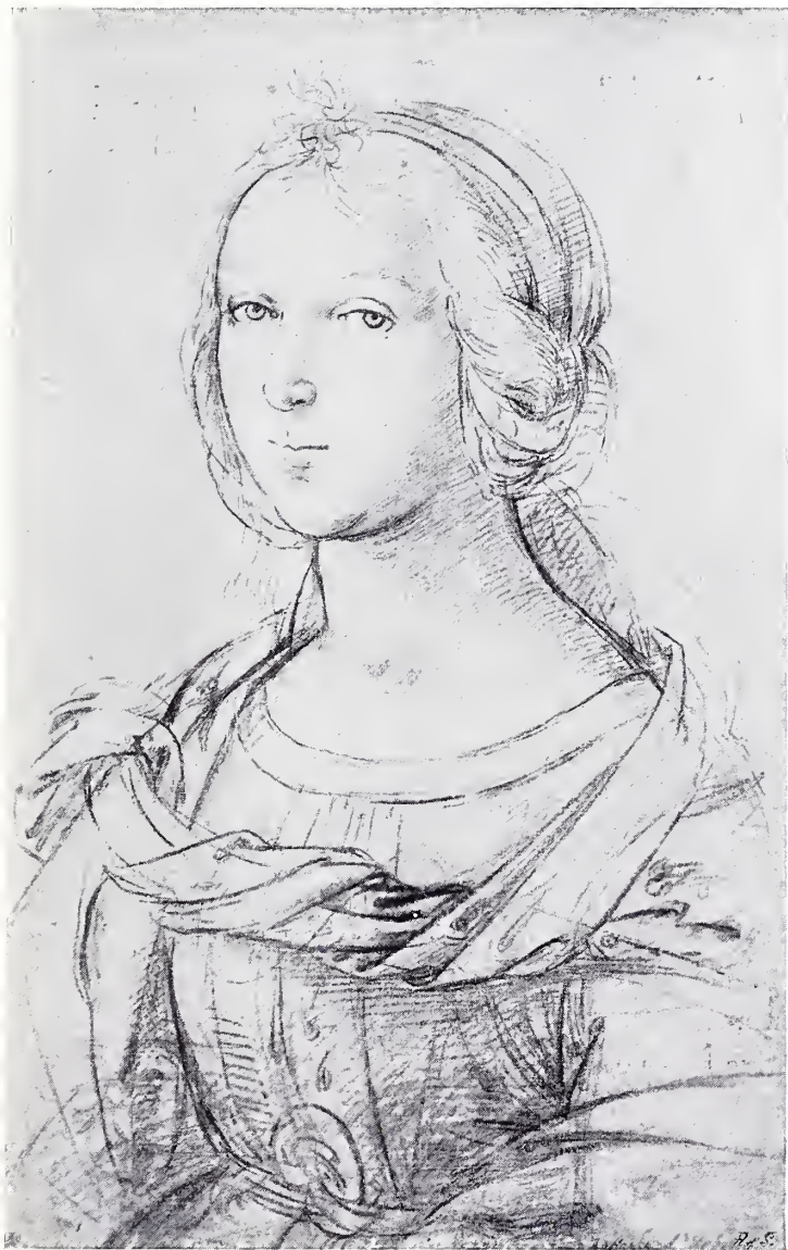
Study of a Woman. By Timoteo Viti. In the Malcolm Collection.

which the two great artists Michelangelo and Lionardo were engaged. Perugino himself was there ; and his scholar, who may have met Lionardo