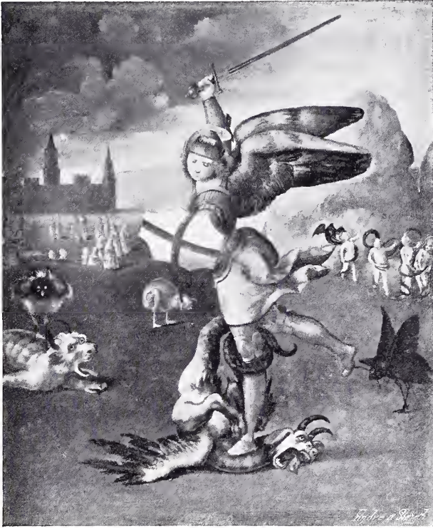
St. Michael. By Raphael. In the Louvre.

There is at Oxford a drawing, in black chalks, of a boy of fifteen or sixteen, with a serious and gentle face, wearing a black cap over his long locks. It is on the same paper and in the same style as another drawing which hangs close by—a head of St. Catherine bearing a palm-branch—now generally recognised to be the work of Timoteo Viti. So there can be little doubt that this lad with the graceful air and the