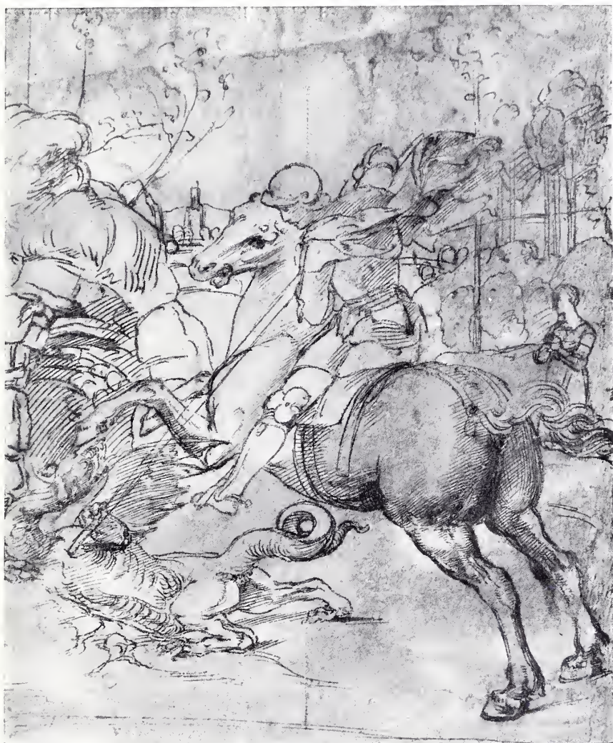
St. George and the Dragon. From a drawing by Raphael in the Uffizi Gallery, Florence.

stirrups, drives his spear through the dragon's coils. In the background, overgrown with bushes, is the cavern where the monster dwelt, and on the other side we see the rescued princess on her knees thanking Heaven for