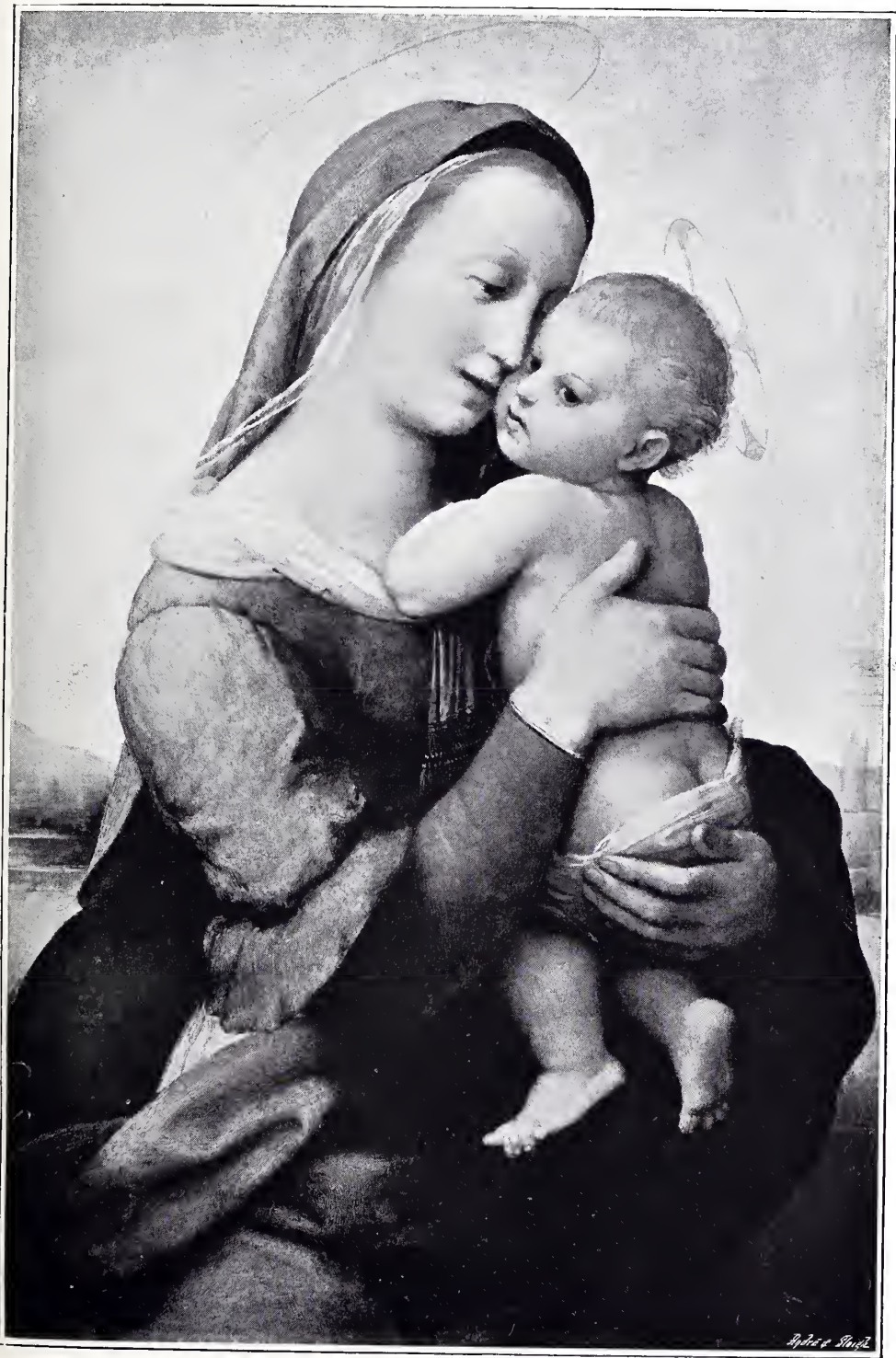
The Casa Tempi Madonna. By Raphael. Old Pinacothek, Munich. From a photograph by Hanfstängl and Co., by permission.