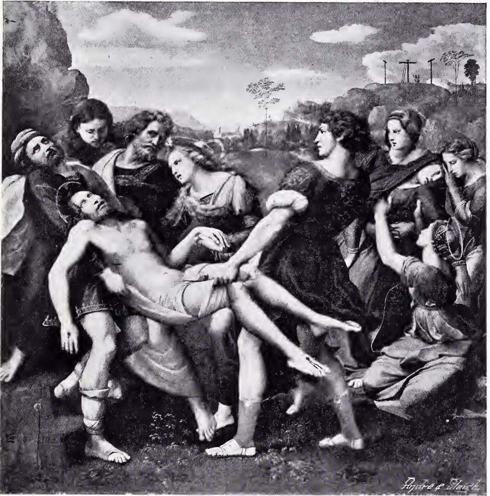
The Entombment. By Raphael. Borghese Gallery, Rome.

distinguished by originality of subject and excellence of execution. The three Christian Graces, Faith, Hope, and Charity, are here painted in chiaroscuro on round panels, each of them accompanied by two winged