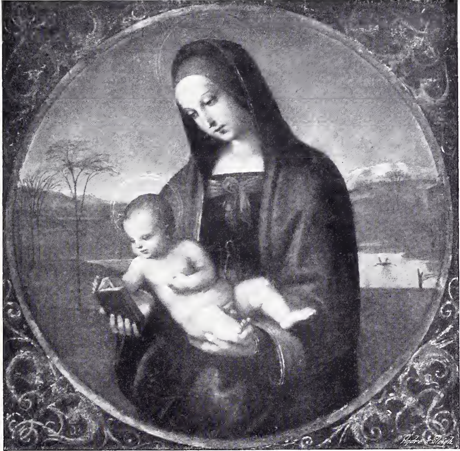
The Conestabile Madonna. By Raphael. Hermitage Museum, St. Petersburg.

usual landscape of green slopes and slender trees, but a lake with a boat sailing upon its waters and distant hills capped with the first winter's snow. This little work, charmingly composed and painted with gem-like finish and brightness, passed from the heirs of the Alfani to the Conestabile-