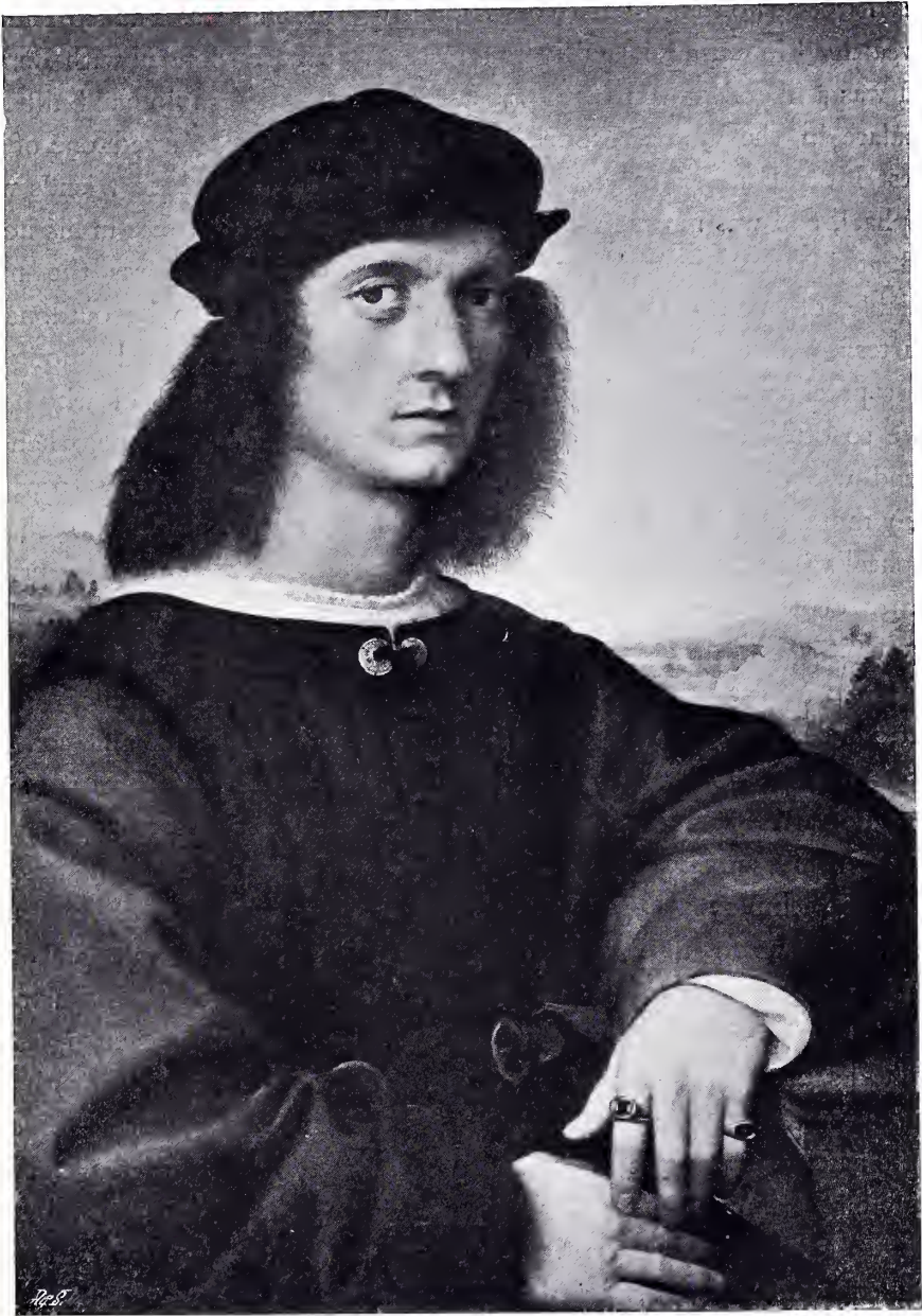
Angelo Doni. By Raphael. Pitti Gallery, Florence.