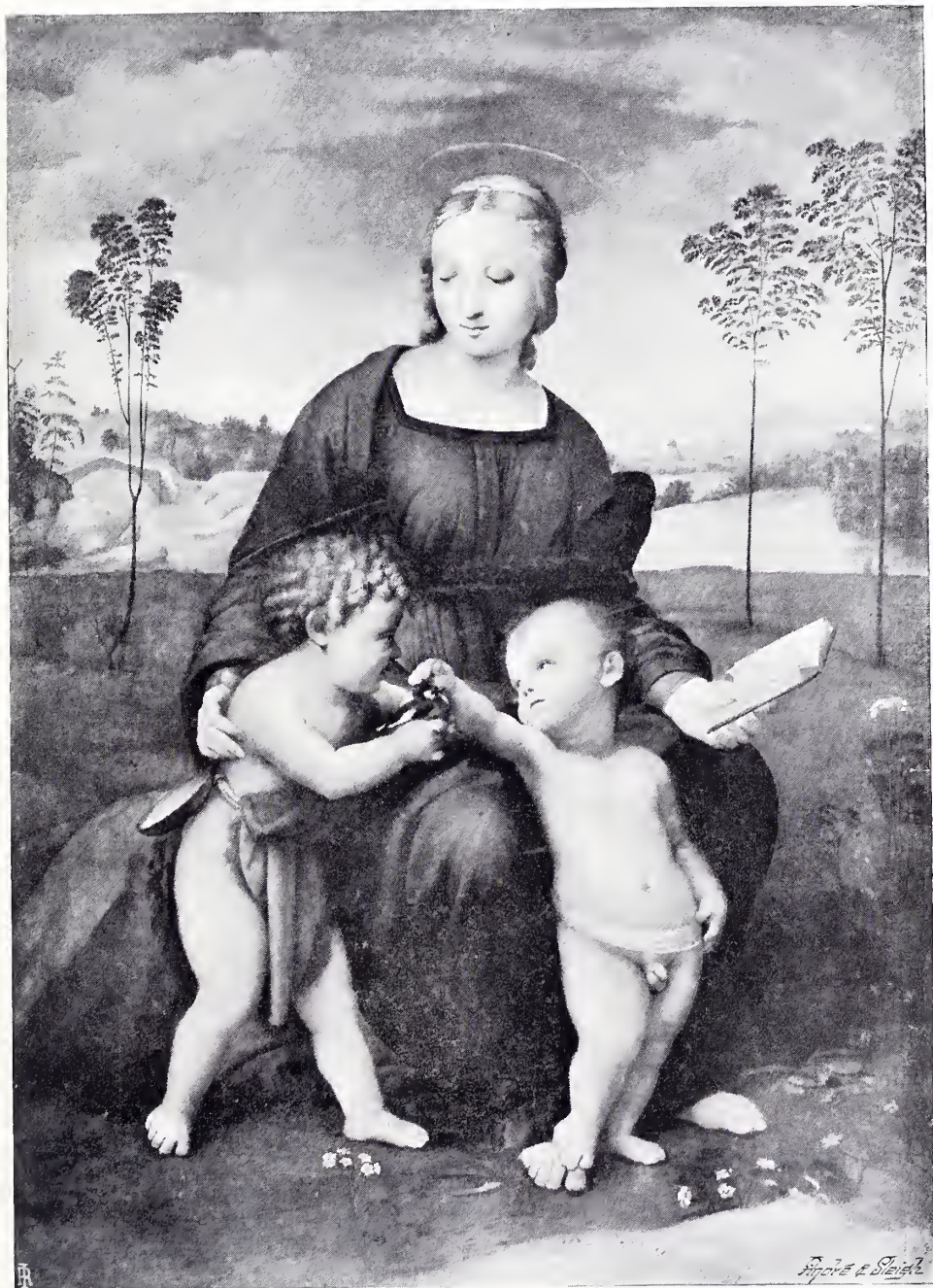
The Madonna del Cardellino. By Raphael. Pitti Gallery, Florence.