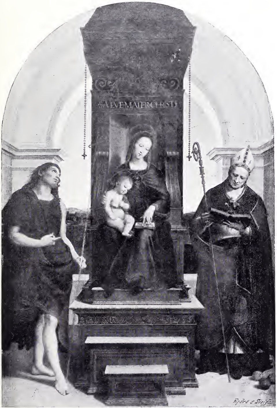
The Ansidei Madonna. By Raphael. From the Picture in the National Gallery.