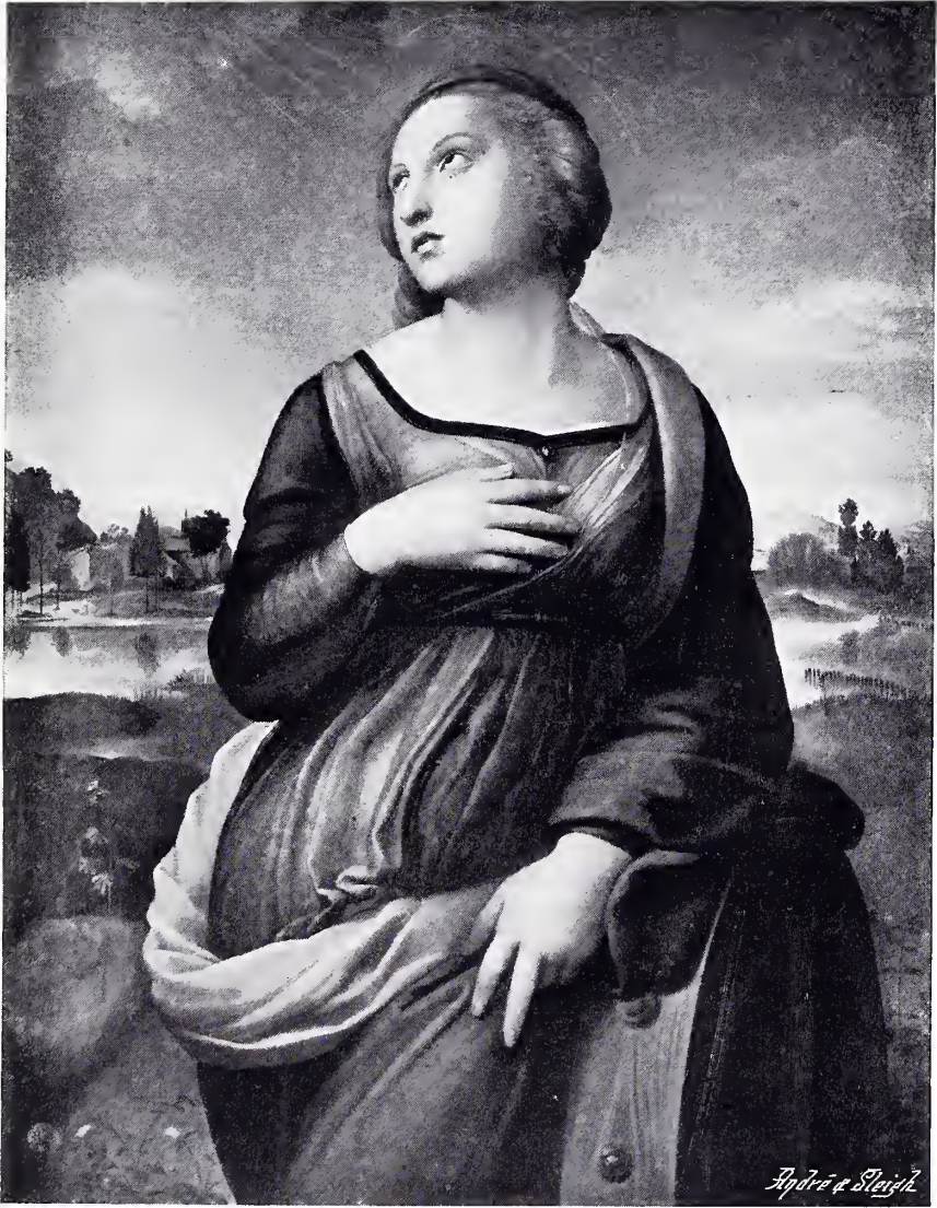
St. Catherine. By Raphael. From the picture in the National Gallery.

trees are all indicated. On the back of the sheet we read the following lines in Raphael's handwriting :—