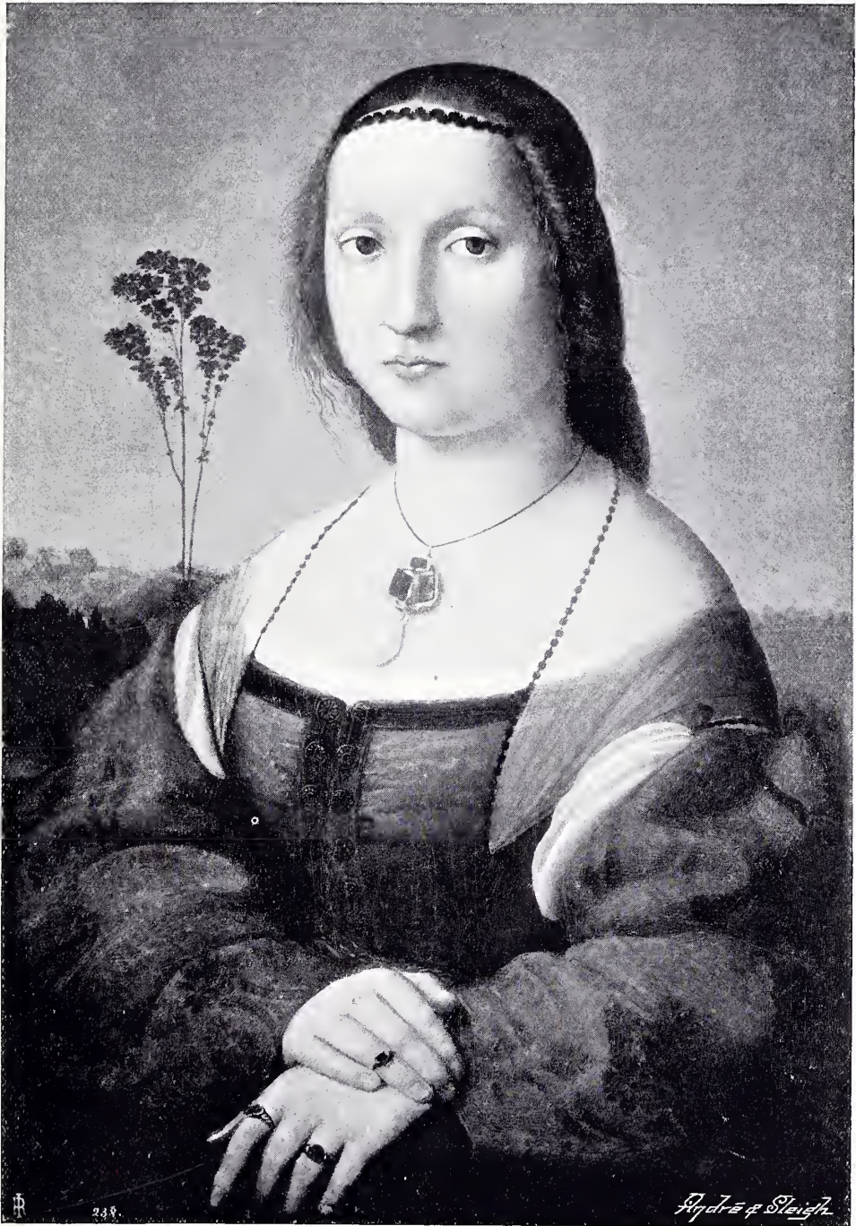
Maddalena Doni. By Raphael. Pitti Gallery, Florence.