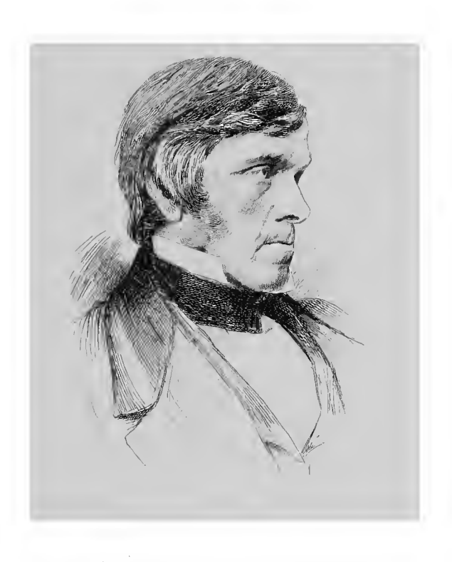
I'm a photogram from a discuerroty in taken in 1845 now, in ; cossion of Sir Assancier Carlyle: