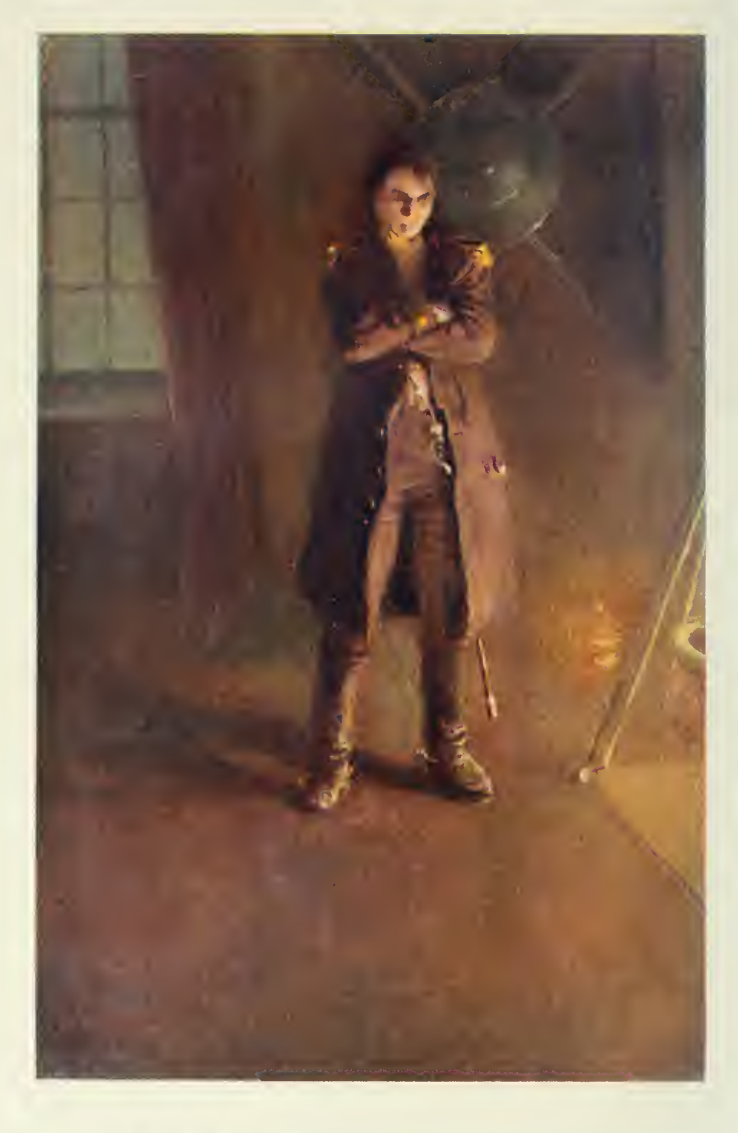
MA LIW VOICE HE MURMUREC "MACBETH, YOU WILL BE FING" Muhlhach = The Empress Josephine, " Lot bleven, p. 262