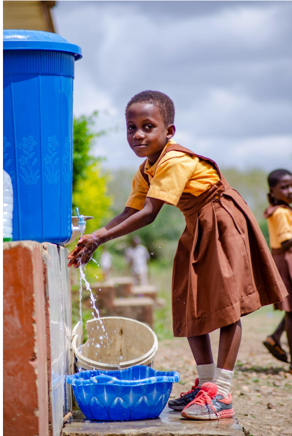
3rd Prize goes to Pupil (Ghana). Download link

“Seeing the little girl washing her hands in this COVID-19 era without anybody telling her to do so just made me understand how determined the girl is to live in this COVID -19 pandemic. And to not keep that action for myself alone, I took a picture of it to show to the rest of the world, so that we will all appreciate the life we are living, so we don’t die out of our recklessness. We should be willing to live a healthy life; a longer Life.”