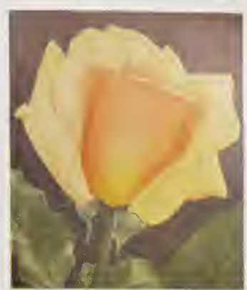
Duchess of Wellington