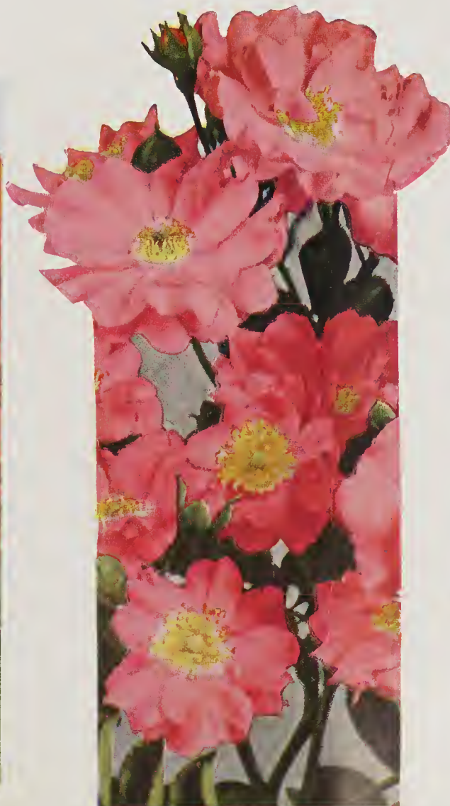
Chaplin's Pink Climber