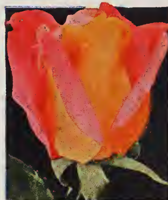
President Herbert Hoover