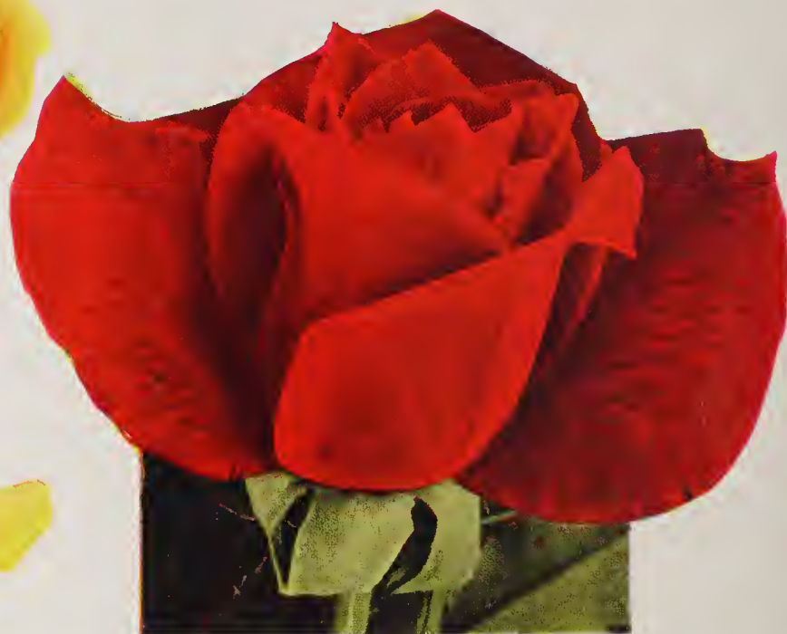
© MARY HART A Real Creation in Blood-Red $1.00 each