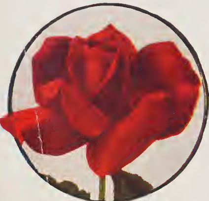
Etoile de Hollande