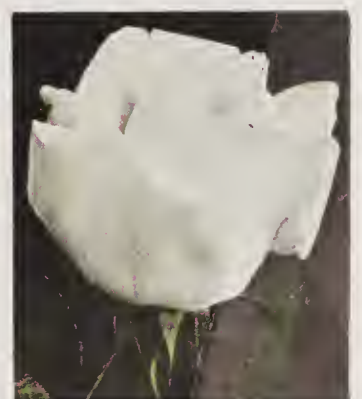
Frau Karl Druschki