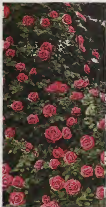
Climbing American Beauty