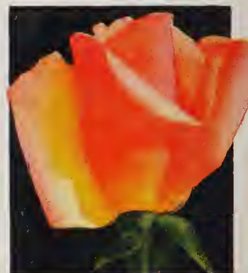
COUNTESS VANDAL The Finest Modern Rose $1.00 each