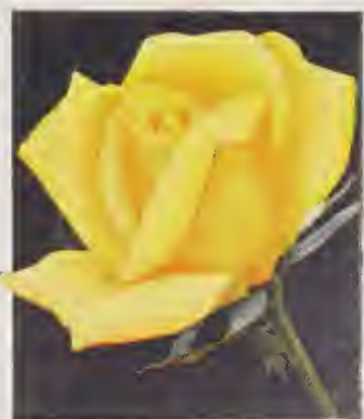
Souvenir de Claudius Pernet