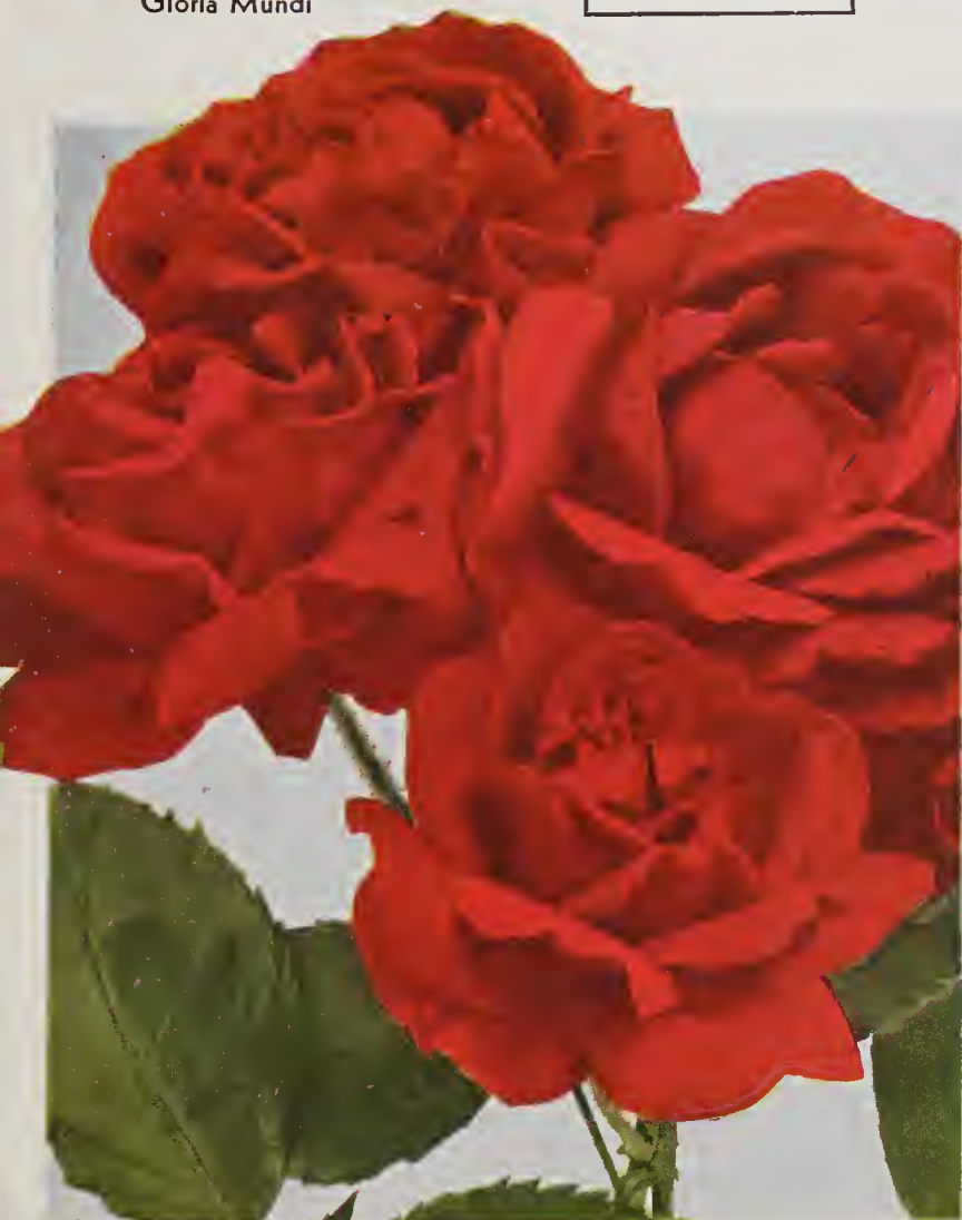
PAUL'S SCARLET CLIMBER The Best Climbing Rose of Modern Times

OF THE OLDER CLIMBERS THIS IS THE MOST POPULAR