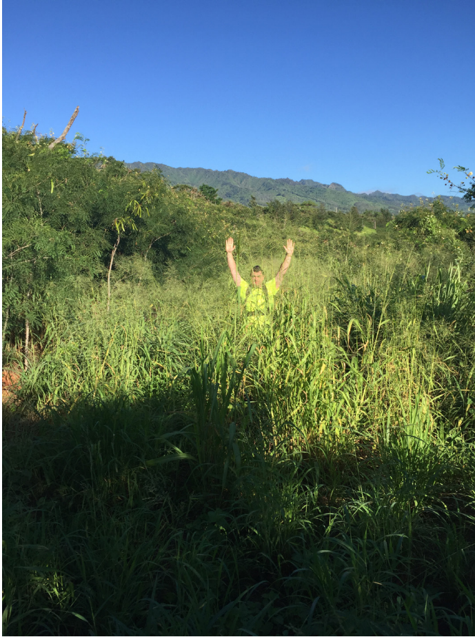
The first step in sustainably managing vegetation at Honouliuli is getting a better idea of the scope of species present in the gulch.

in order to lay a foundation for a future Vegetation Management Plan, there is also a pressing need to identify heritage vegetation as a cultural landscape component (see Cultural Landscape Inventory Project), to ensure that any future clearing efforts are not disrupting historically-significant natural characteristics of the monument.