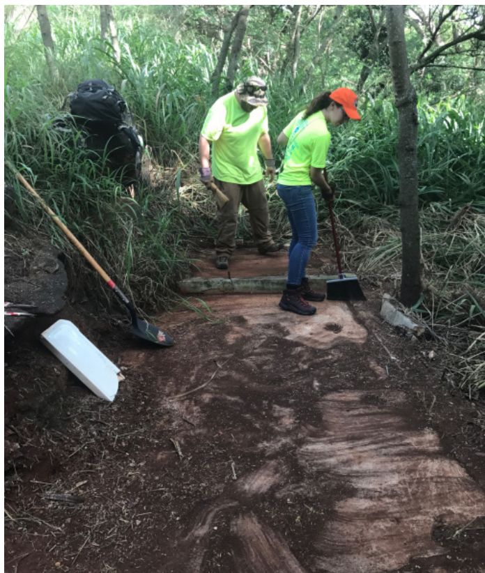
Students clear off a latrine foundation in Compound IV during the field school.