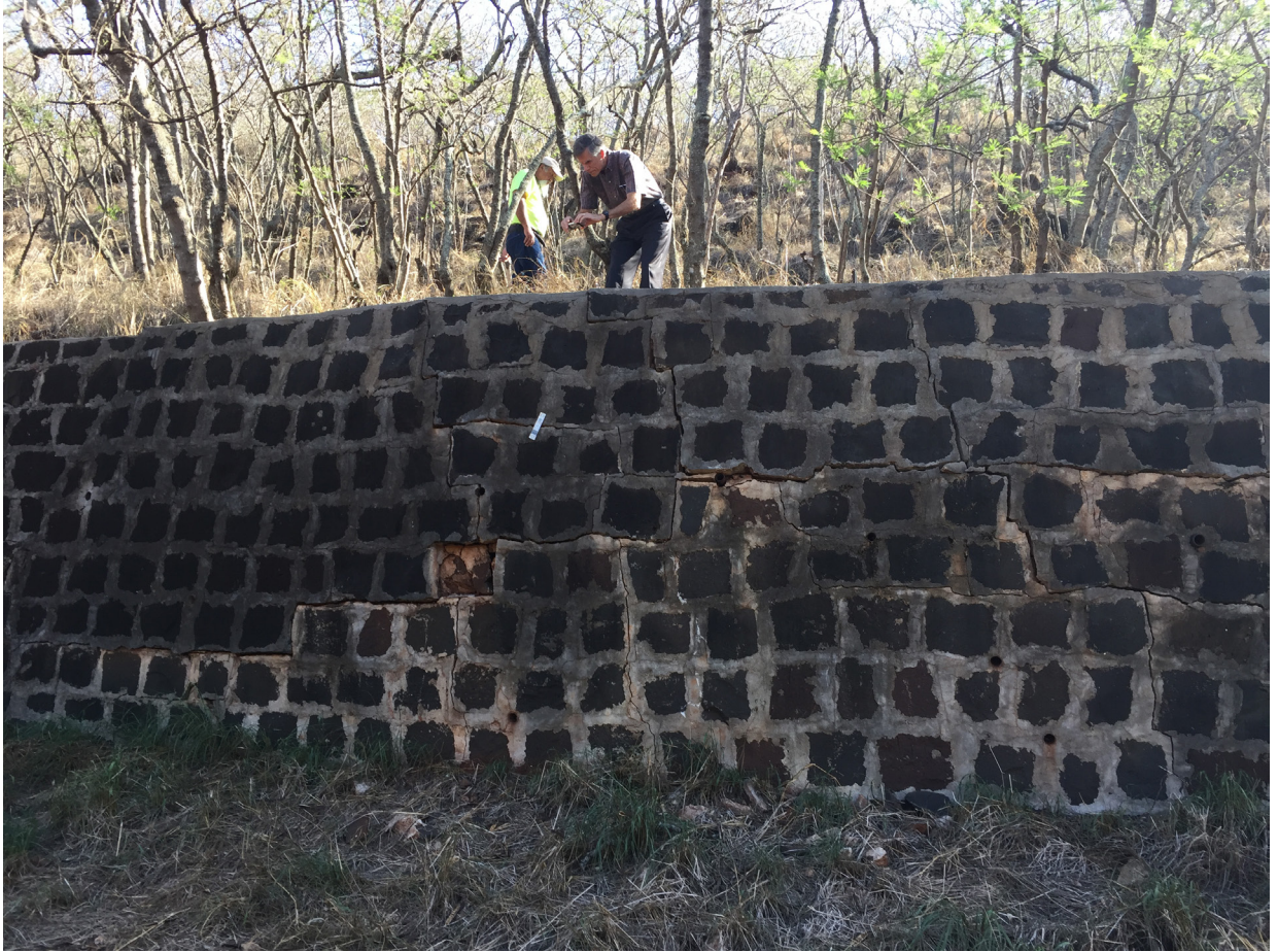
Surveys of the Honouliuli retaining wall took place in mid-September. This work will set the stage for rehabilitation of the failing section of the wall.