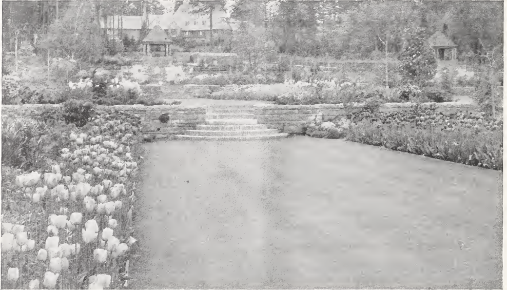
A well kept lawn and correct grouping and arrangement of shrubs, trees, beds and borders lend an individual charm that reflects the personality of the owner. Our Landscape Department can help you to get best results.

Never use stable manure for dressing a lawn, it brings weeds and trouble. A good dressing of Hyde's Lawn Fertilizer is much more efficient and economical, sustaining the growth and color.