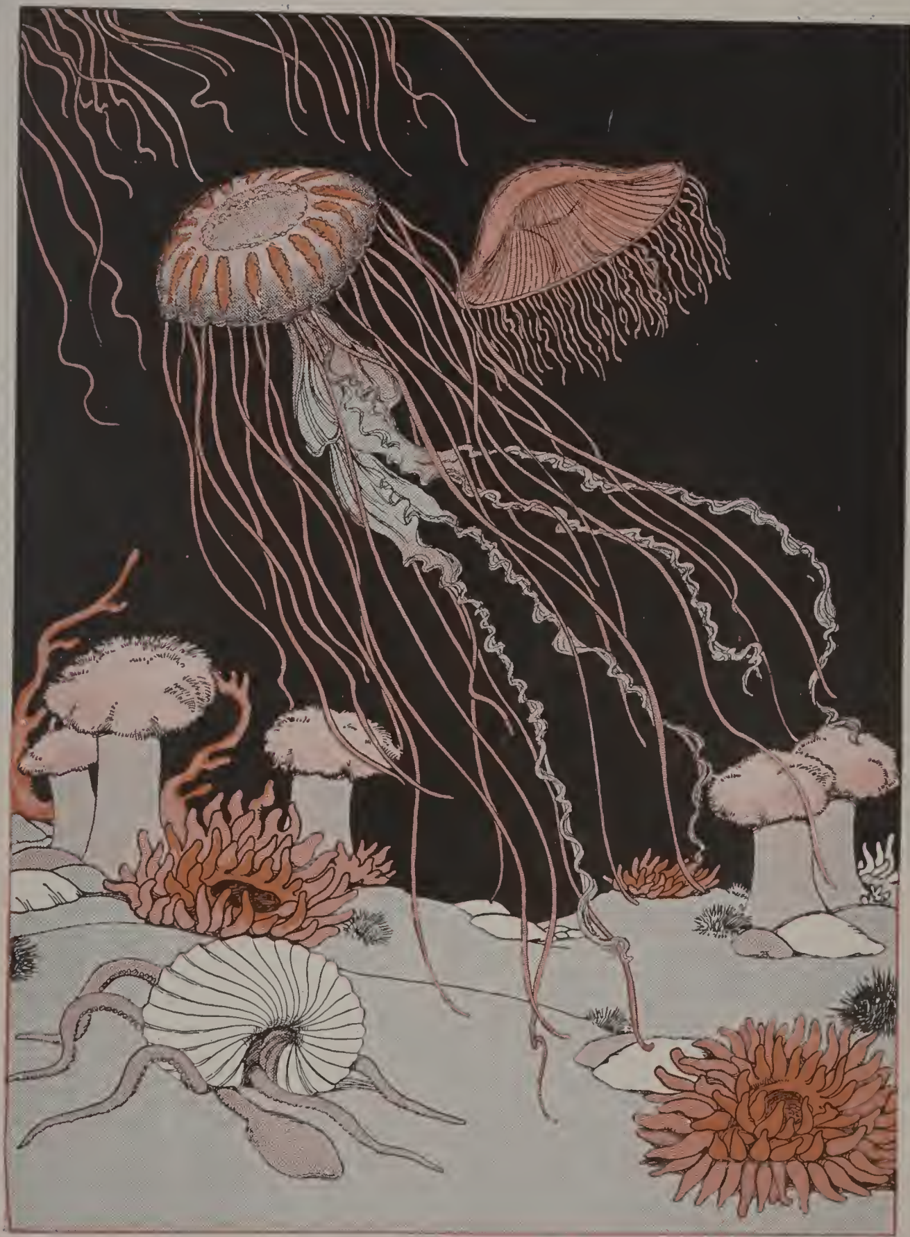
Sammy Was Daily Growing More and More Weary of This Peaceful Lagoon.