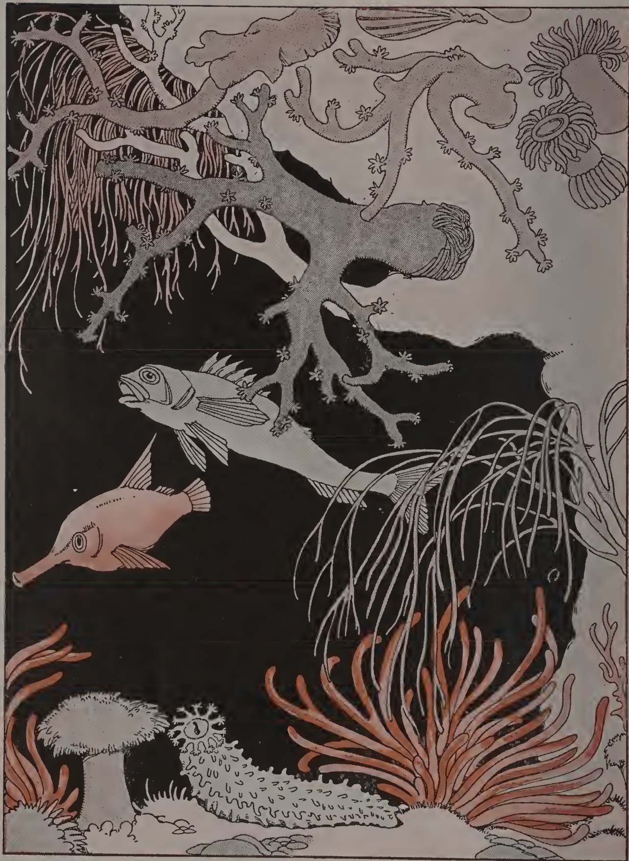
In Fact the Lagoon Was Like a Large Aquarium of Curious and Beautiful Fish.