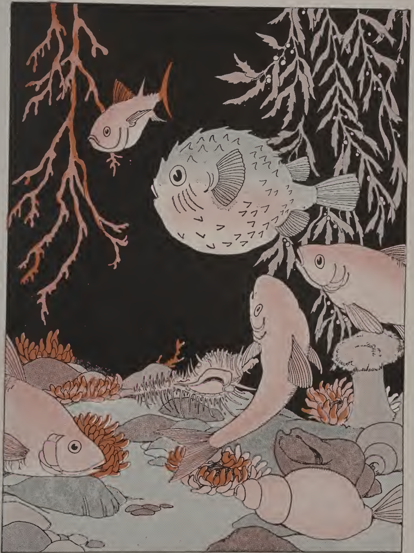
Floating Lazily Along Was a Round, Prickly Globe-Fish.