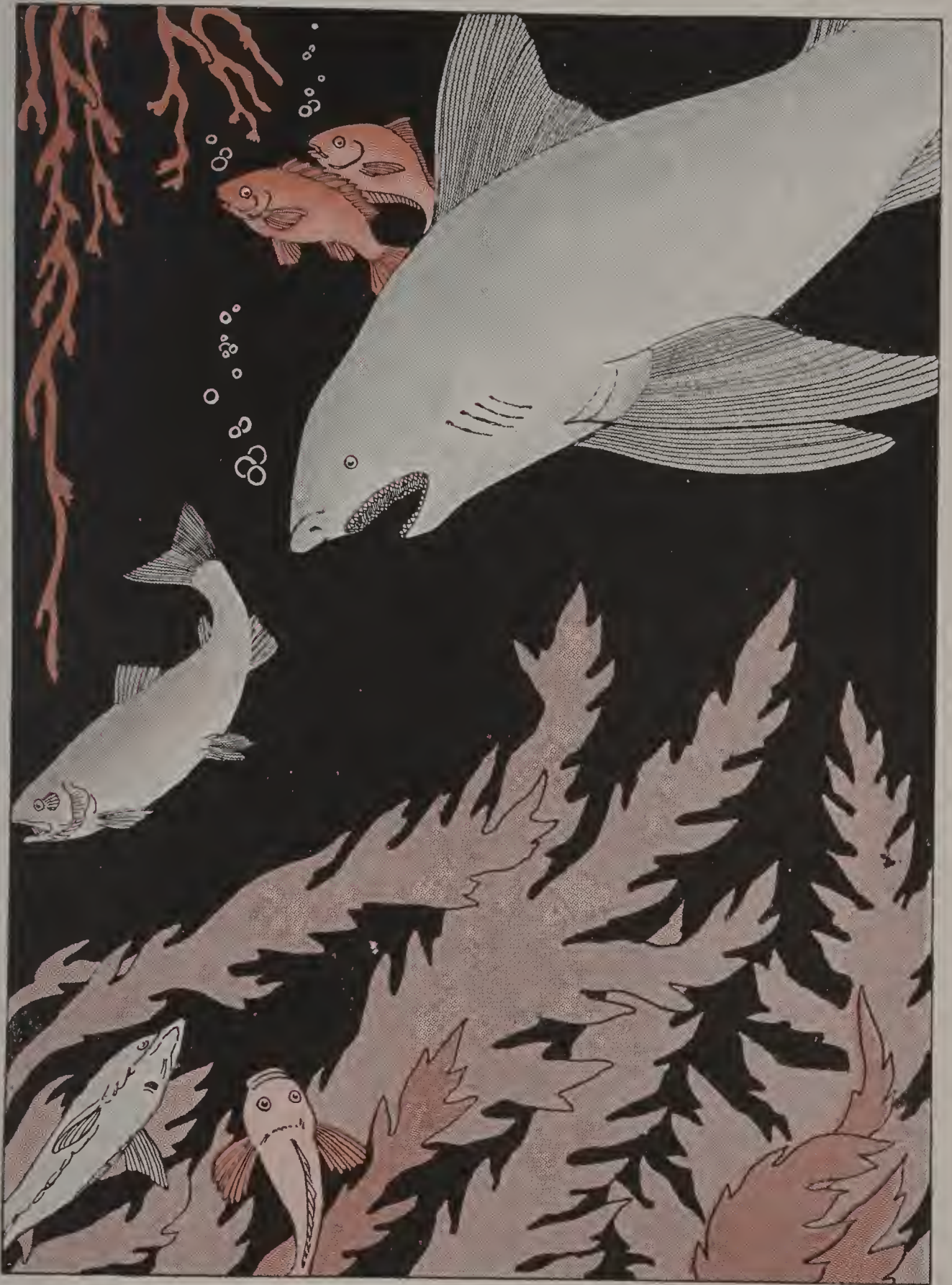
The Monster Slowly Gained on Him.