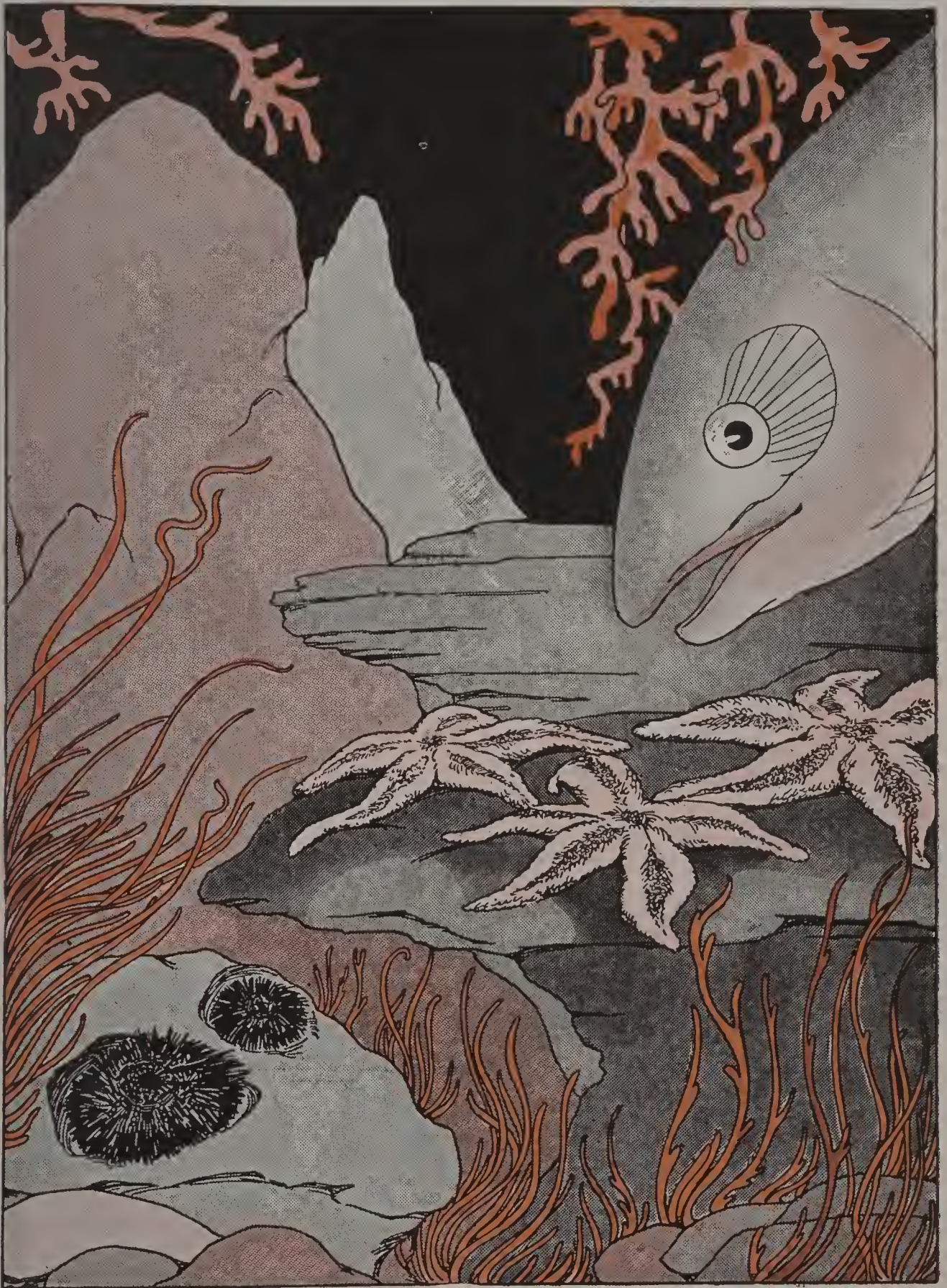
Sammy Was Soon on Very Good Terms With a Couple of Jolly Sea-Urchins.