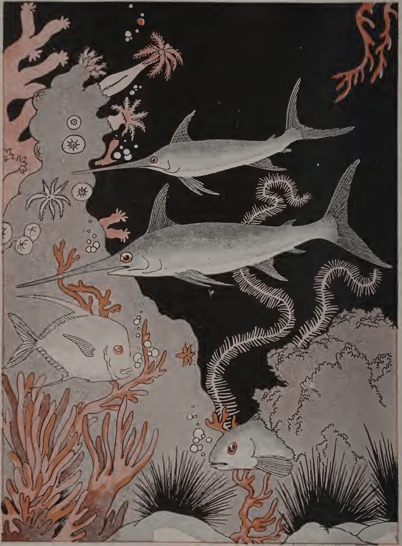
"Sword-Fish!" Said the More Experienced Pilot.