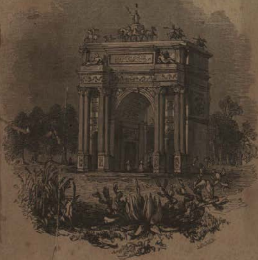
THE TRIUMPHAL ARCH OF MILAN.