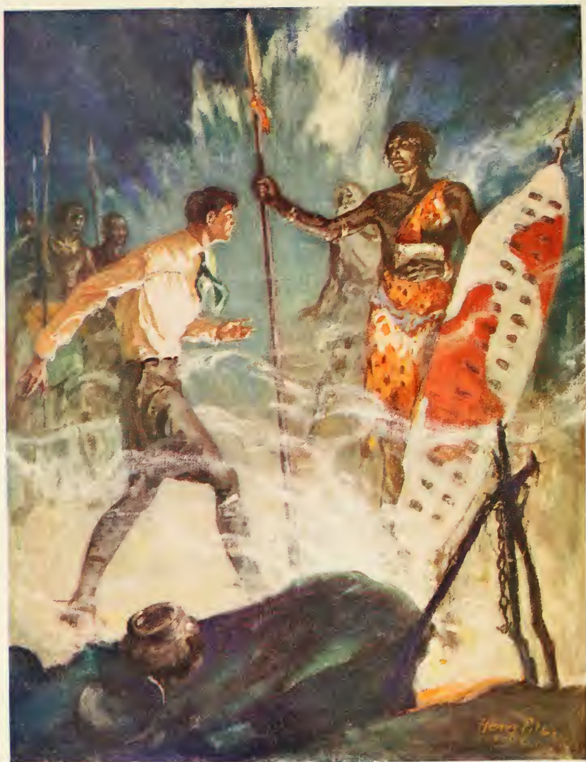
I STAGGERED CRAZILY TO MY FEET AND SHAMBLLED FORWARD.