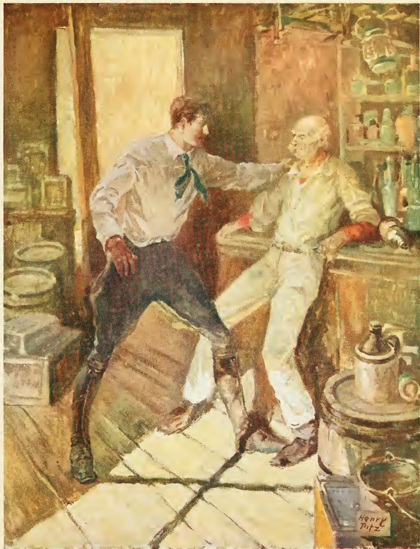
I STALKED OVER TO HIM AND TOOK HIM BY THE SHOULDER. "YOU OLD REPROBATE!" I ROARED.