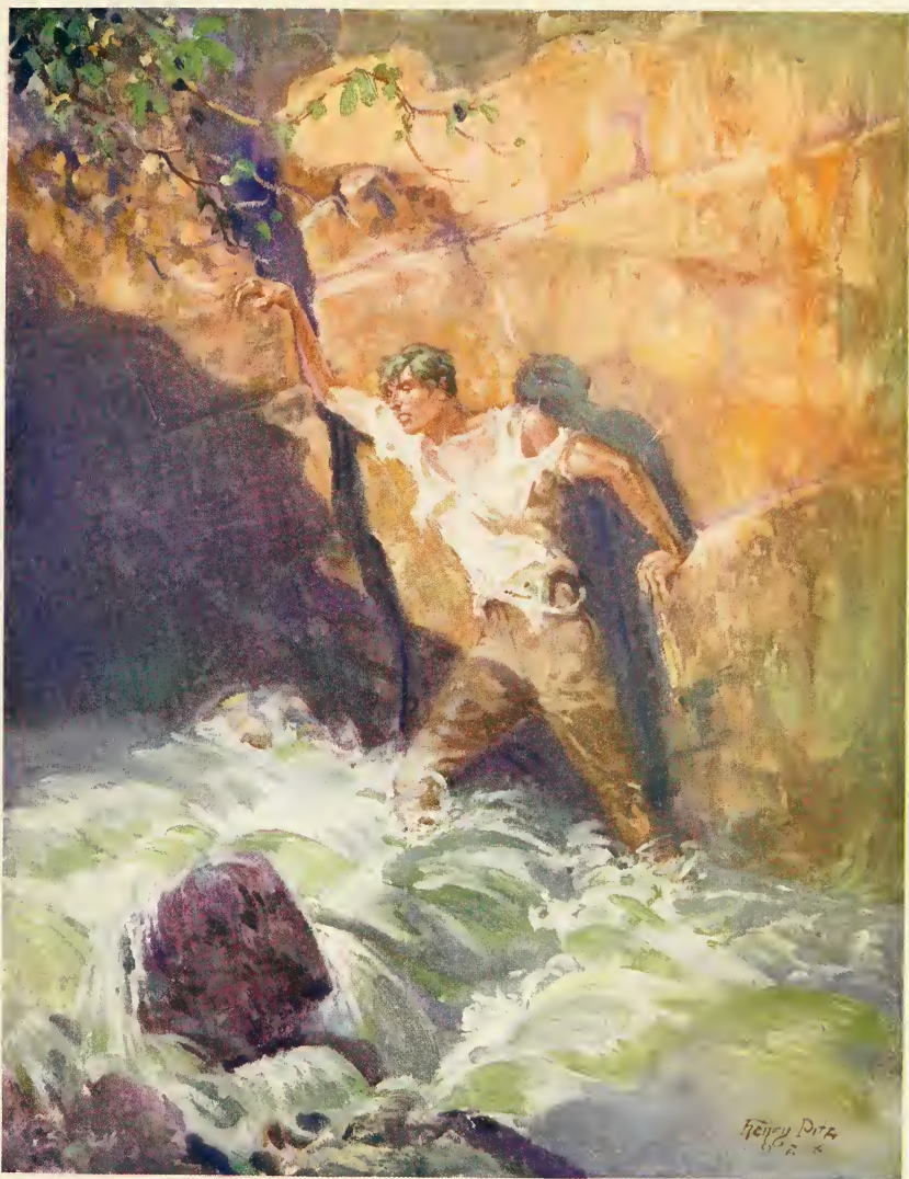
THERE I STOOD, STRADDLING LIKE A COLOSSUS OVER A WASTE OF WHITE WATERS, WITH THE CAVE FLOOR FAR BELOW ME.