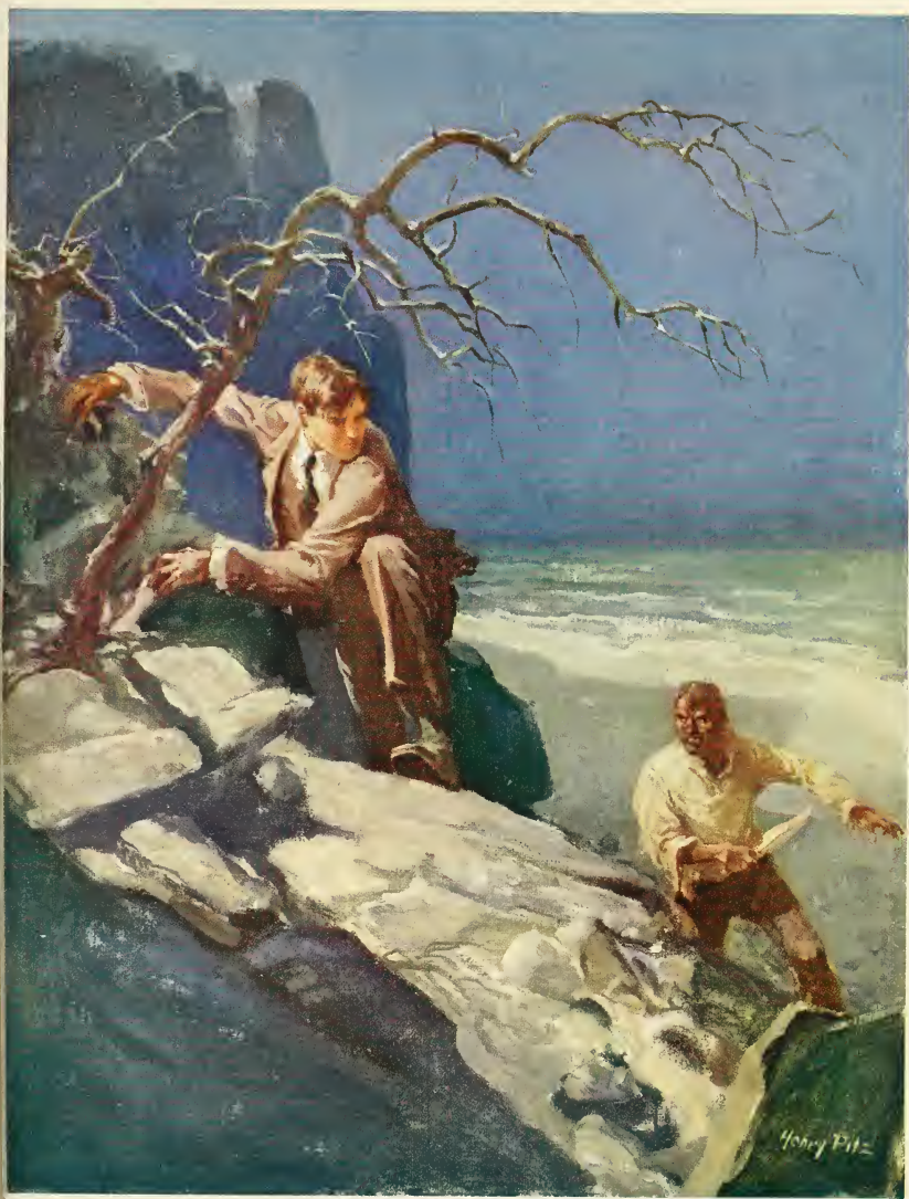
HE HAD A GLIMPSE OF A HUGE FIGURE, KNIFE IN HAND.