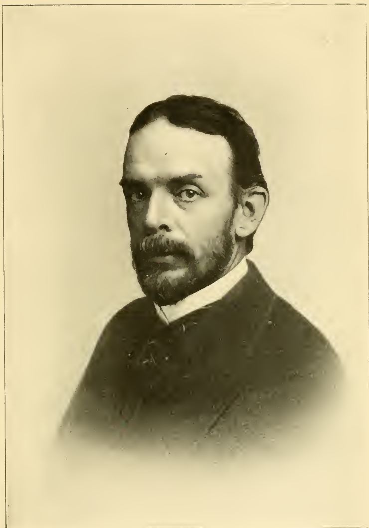
GEORGE BROWN GOODE.