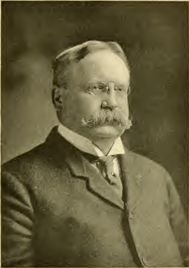
WALTER WYMAN. Second Governor of the Society, 1894-5.