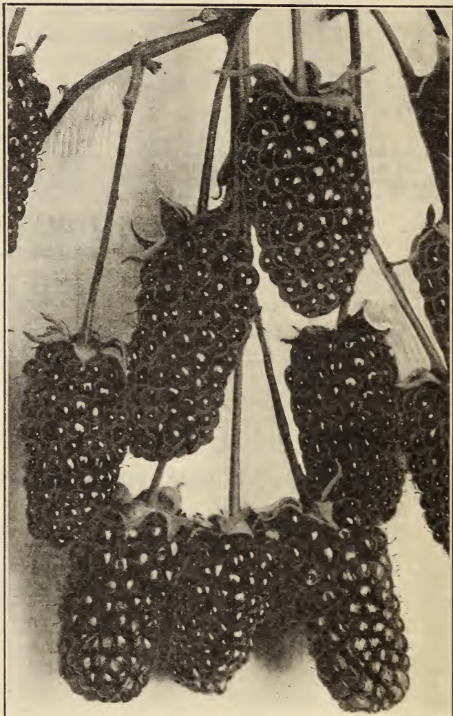
Photograph showing actual average size. Selected specimens can be shown three inches in length.

Cory's Thornless Blackberry is unlike any other berry grown. The canes start to grow early in the spring, growing thick and stout until about five or six feet long, when they take the trailing habit, at which time they should be trellised. It is a prolific grower, the canes often reaching 20 to 30 feet in a season. Individual plants under favorable conditions will produce from 150 to 200 feet of cane in a season. They can be pruned to suit your fancy. When exposed to the sun the canes are a deep red color. The foliage is large, thick and of a dark green. It is not an evergreen, but some of the leaves often stay on all winter.