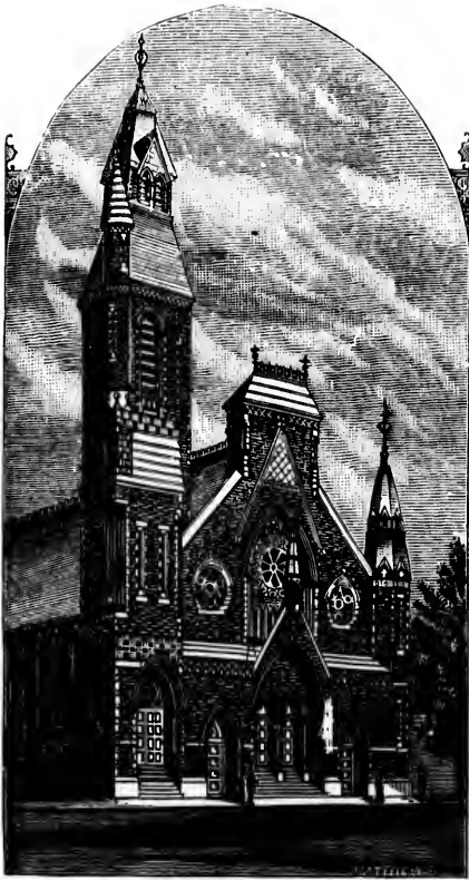
THE ST. GABRIEL CHURCH, ST. CATHERINE STREET.