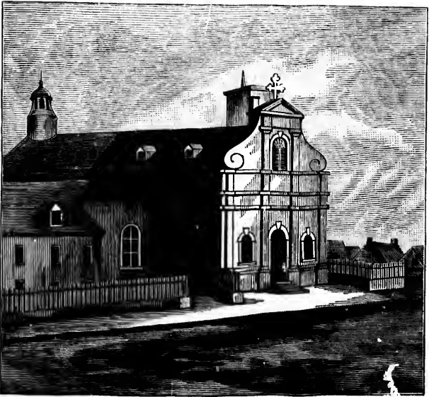
THE RECOLLET CHURCH.