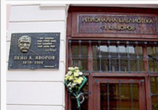
Входът на централната сграда на РБ „Пейо Яворов“ – Бургас