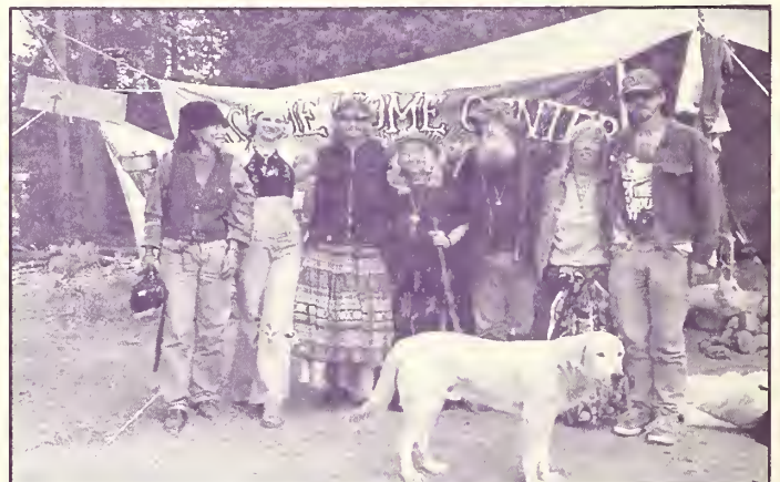
Family members at welcome center

To learn more about the Rainbow Family, visit the Beaverhead-Deerlodge website, www.fs.fed.us/r1/b-d and select the Rainbow icon, or visit their unofficial website, www.welcomehome.org/ .