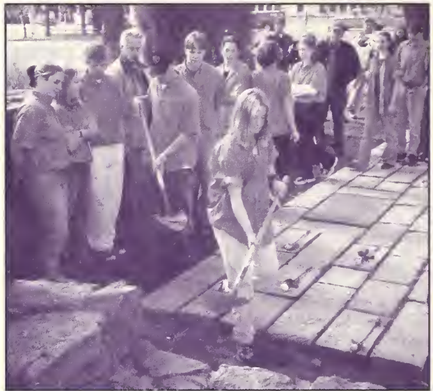
Helena High School students participate in ceremony at National Wildland Firefighter Memorial on the grounds of the Aerial Fire Depot.

The quilt took over 500 hours of labor to construct, along with 50,000 yards of thread, and hundreds of yards of materials from Idaho, California, Montana, Arizona, Washington, and New York.