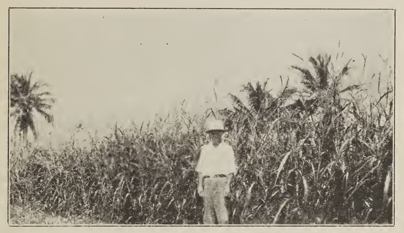
FIG. 2.-Napier grass at Barrigada farm 51 days after second cutting

Adaptability test.—With the assistance of the station the island government made plantings of a number of varieties of grasses at the Barrigada farm, 10 miles from the station, in order mainly to furnish green forage for the government stock and also to collect some data regarding the adaptability of these grasses to the soil of that locality. The distance of the farm from the station and the lack of sufficient time and facilities prevented the collecting of as much data as were desired regarding these plantings. The soil of the area is a thin clay loam underlain by coral limestone and is very similar to that of the greater part of the north-central part of the island.