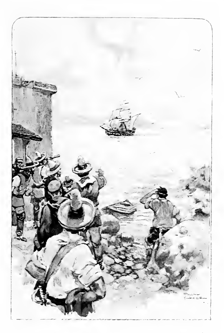
What he had taken for a pile of fallen rocks was a fort and a group of excited men at its gates. Page 9.