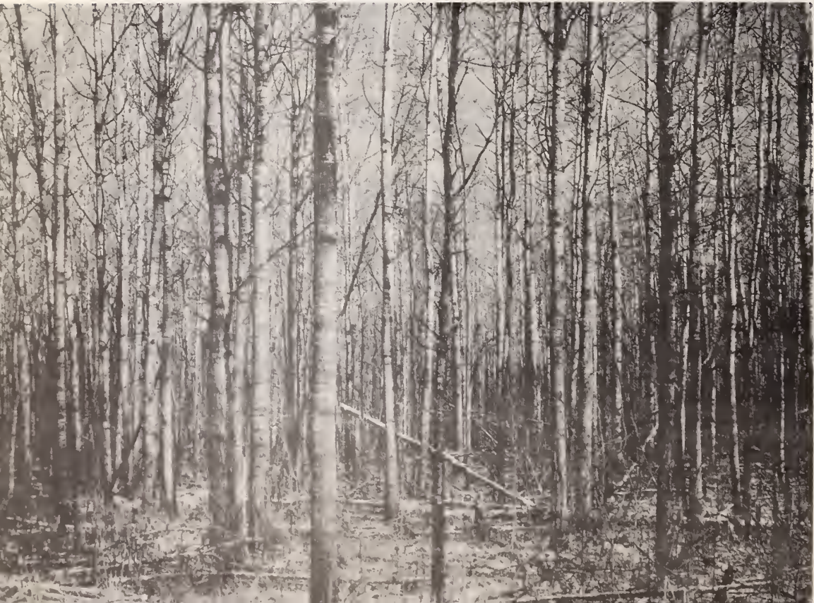
Figure 3.--Well-stocked aspen stand in northern Minnesota.

Two cytospora cankers ( Valsa sordida and V. nivea ) occur throughout the range of quaking aspen. They are generally of a secondary nature and attack trees, both young and old, already weakened by other causes ( 14, 68 ).