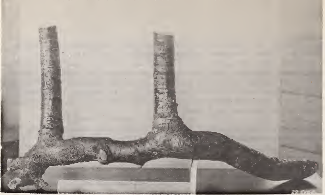
Figure 2.--Two aspen suckers that have developed from a 23-year-old parent root.

Suckers are initially sustained by the root system of the parent tree, but they form their own root systems with amazing speed. A marked thickening of the parent root usually takes place at the point of sucker origin, but only on the side away from the parent tree, indicating that translocation of food material produced in the sucker is toward the growing tip of the root (20).