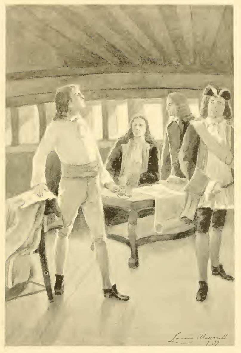
"'LEAVE TO GO AND SEE MY WIFE, WHOM I CALL THE BELLE AURORE."