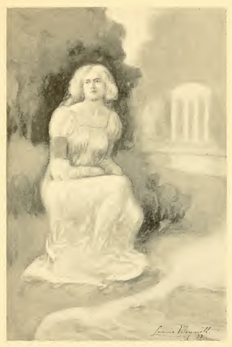
"HAIR, SUCH A WONDER OF FLIX AND FLOSS."