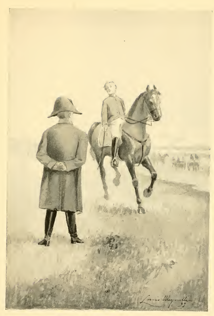
"A RIDER, BOUND ON BOUND FULL-GALLOPING; NOR BRIDLE DREW UNTIL HE REACHED THE MOUND."