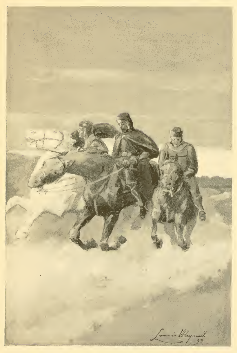
"I GALLOPED, DIRCK GALLOPED, WE GALLOPED ALL THREE."