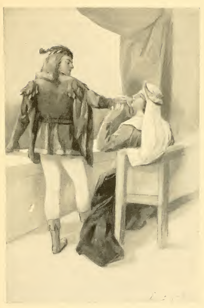
"AND FULL IN THE FACE OF ITS OWNER FLUNG THE GLOVE."