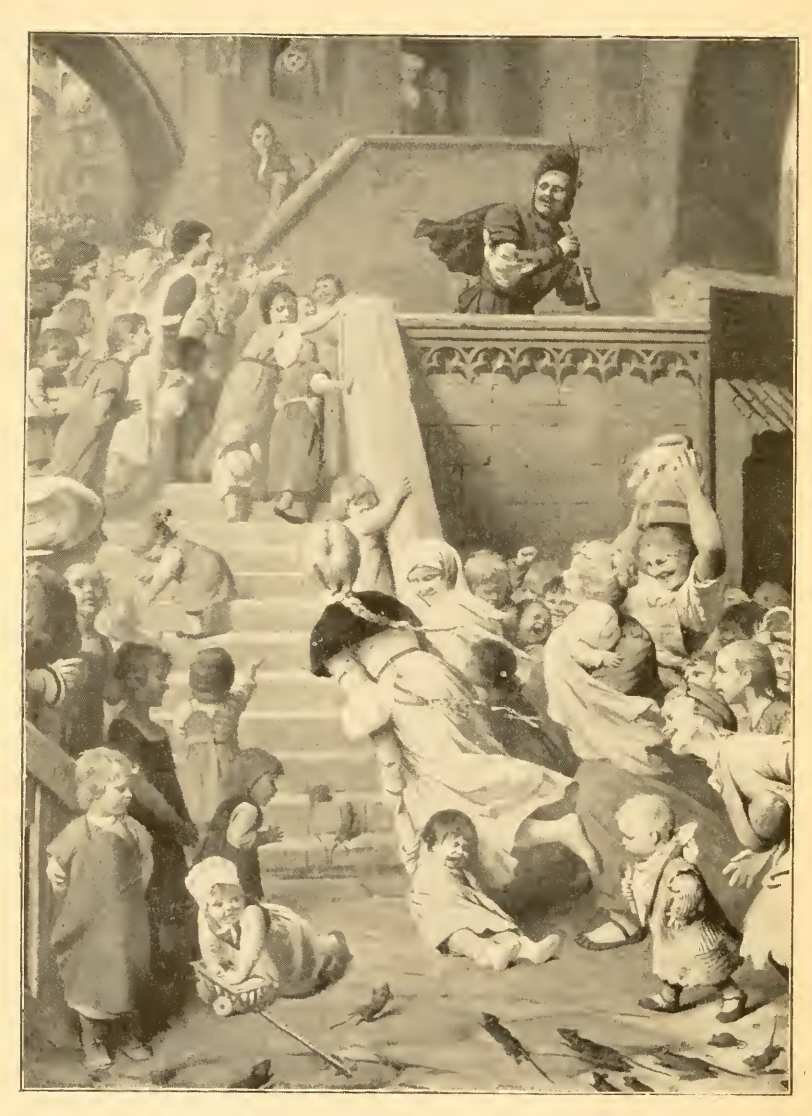
THE PIED PIPER OF HAMELIN.