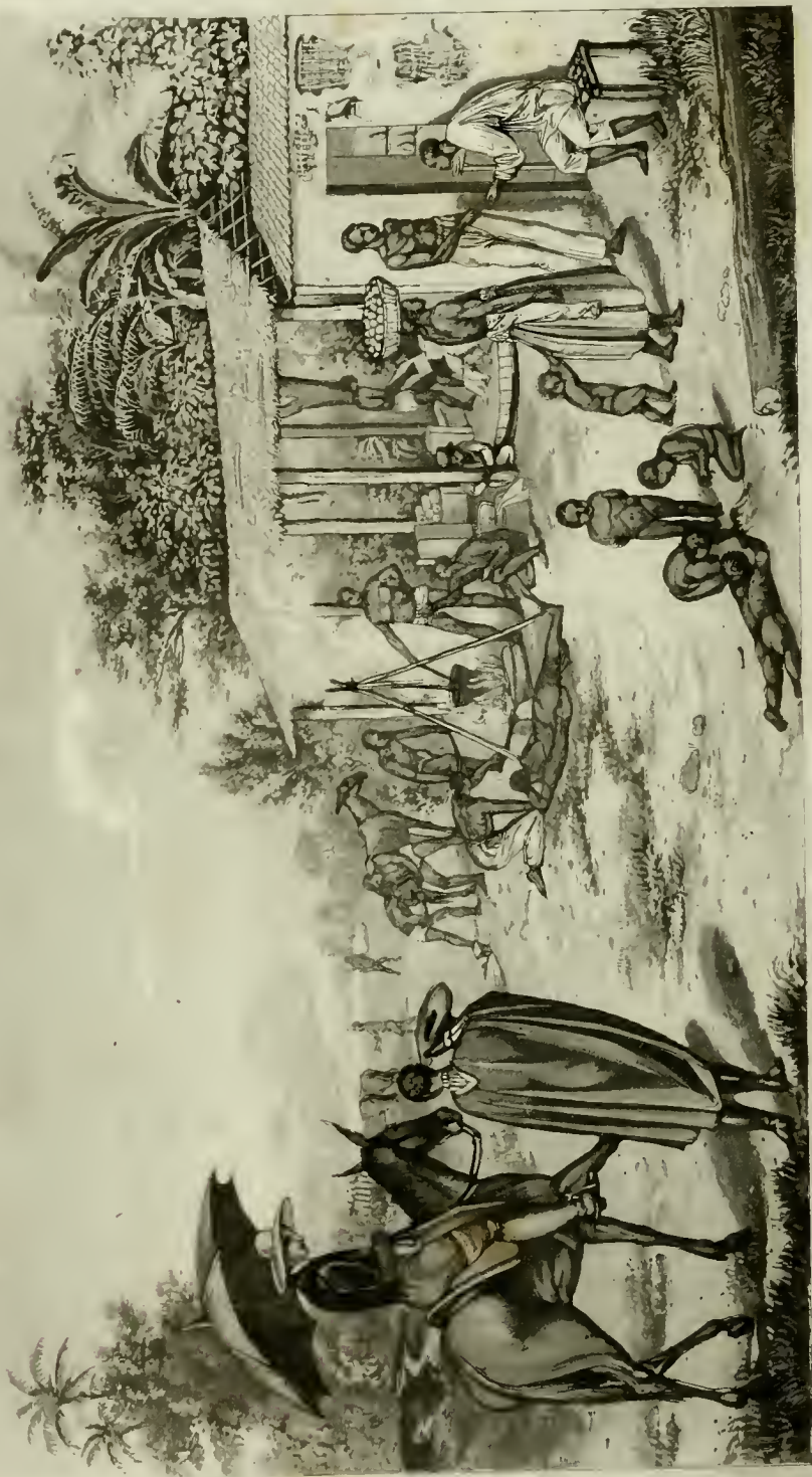
RANCHO NEAR THE SERRA DO CARACA.