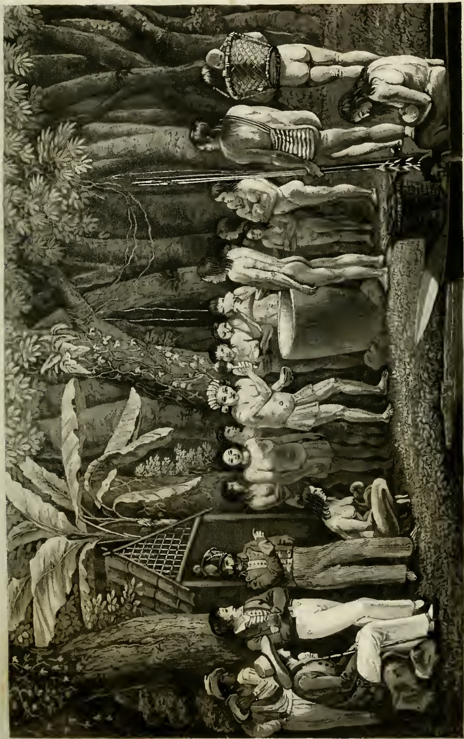
FESTIVAL OF THE COROADOS.

London, Published by Longman & Co. 29, March 1824.