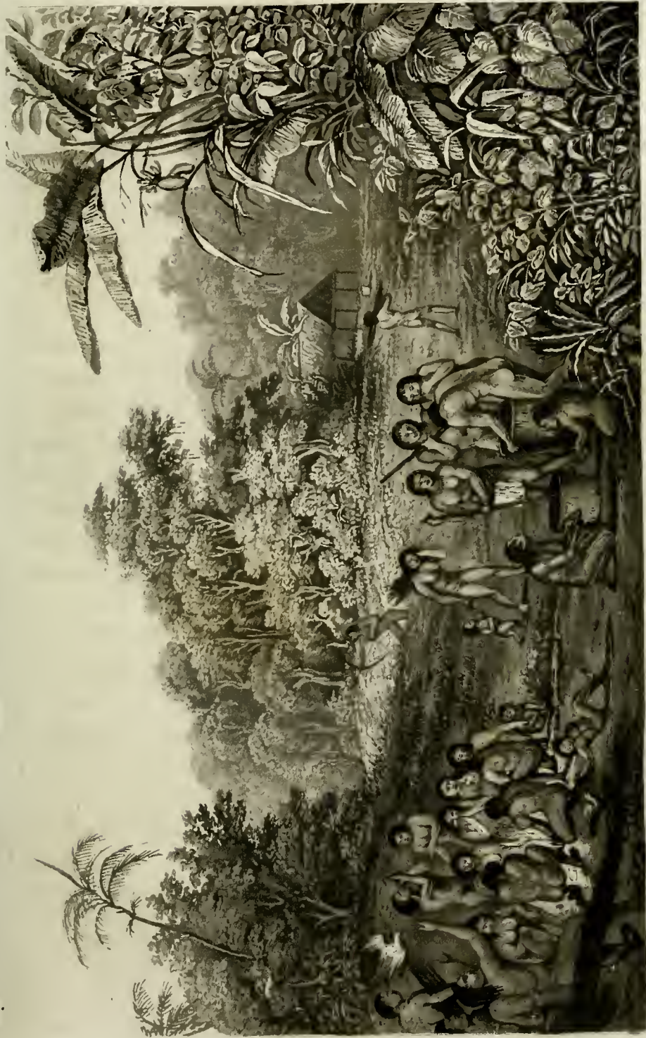
VILLAGE OF THE CORDILLERAS.

London, Published by Longman & Co. 29, March 4, 1824.