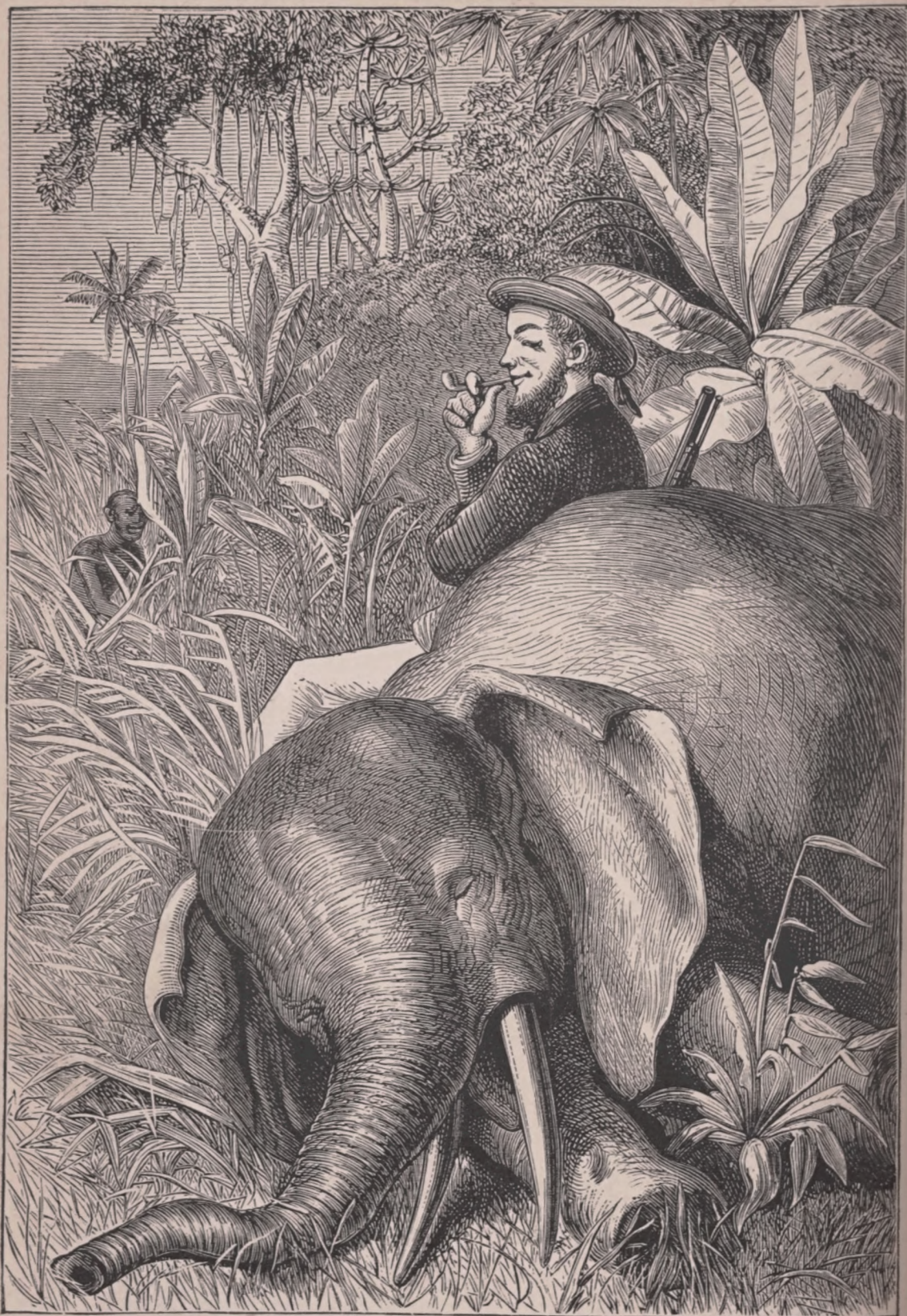
DISCO MOUNTS GUARD OVER AN ELEPHANT.—PAGE 221. 224