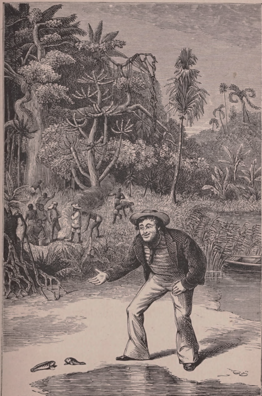
A BLENNY-FIGHT.—PAGE 96.