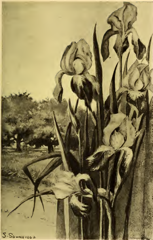
"Some purplish blue flowers growing near the bank"