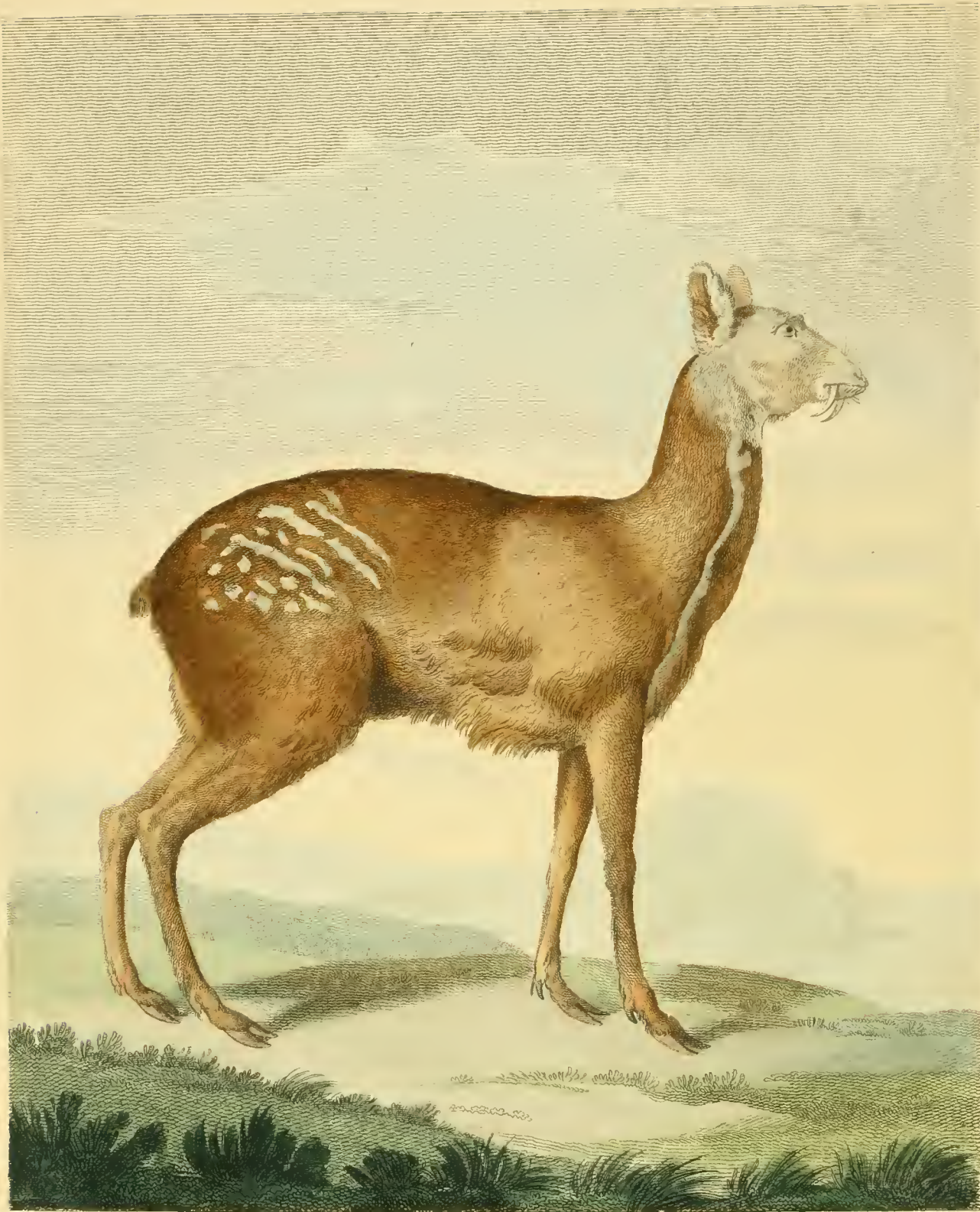
MOSCHUS MOSCHIFERUS. THE COMMON MUSK.

Illustrated from a drawing by J. B. S. P. de Cuvier.