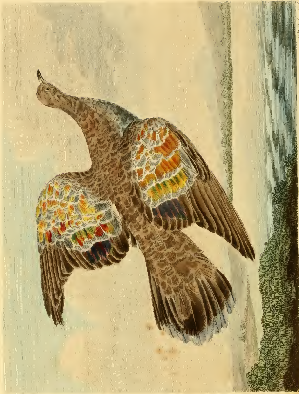
COLUMBA CHALCOPTERA. THE BRONZE-WINGED PIGEON.