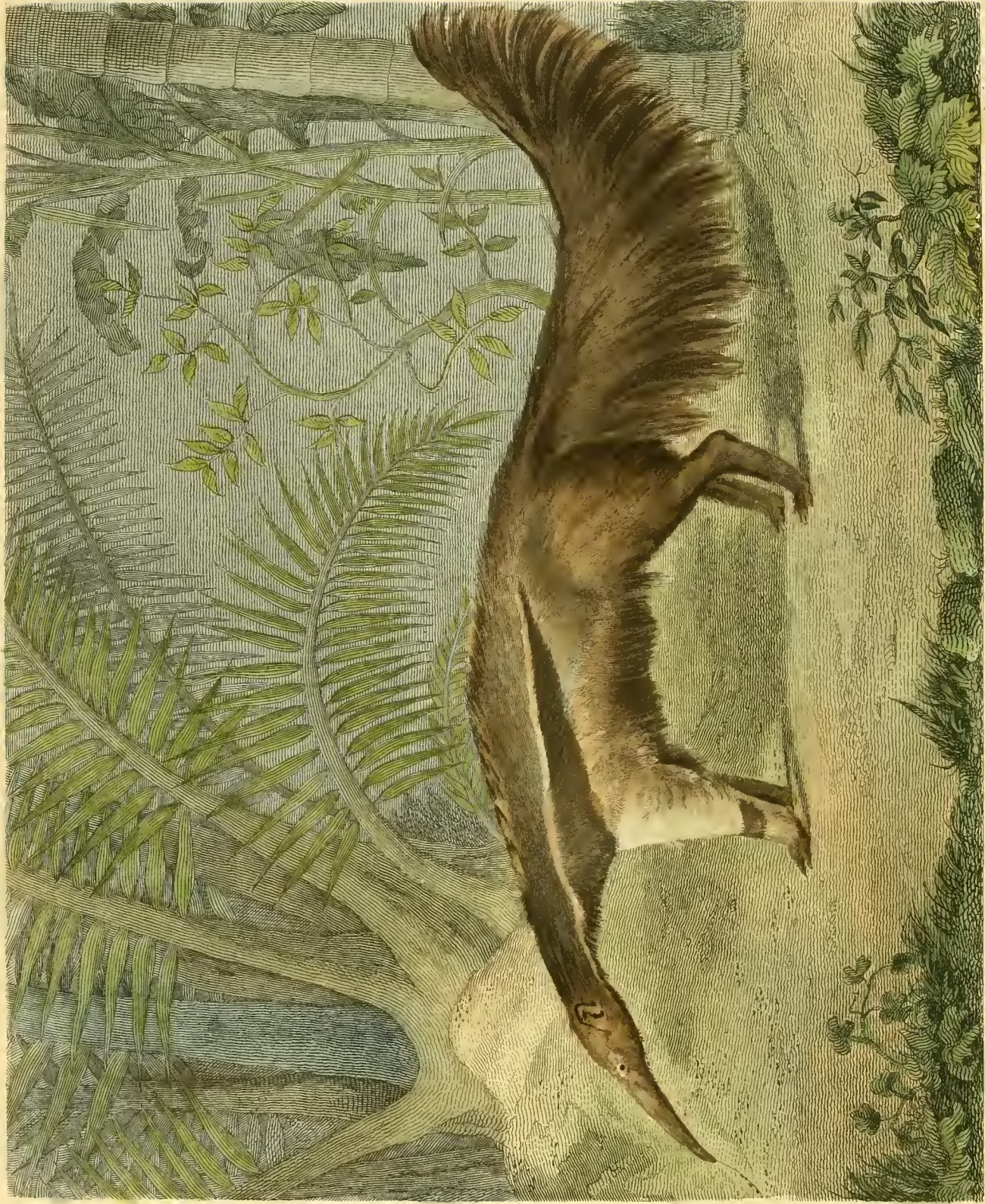
THE GREAT ANT-EATER.