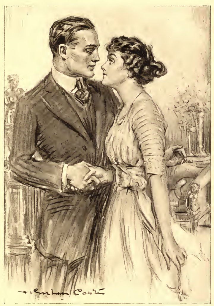
"Stop!" he cried eagerly. "Would you give up everything—everything mind you,— if I were to ask you to do so?"