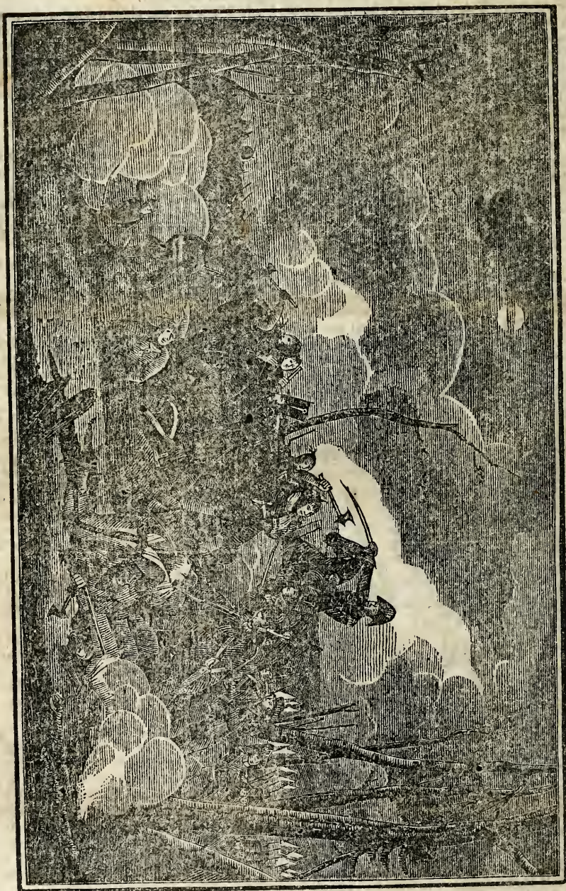
BATTLE OF TIPPECANOE. (See page 6.)