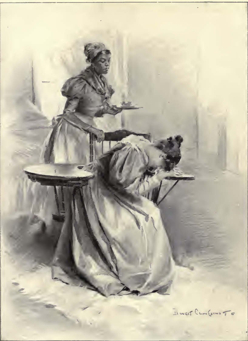
"Miss Charlotte she 'mos' 'stracted."