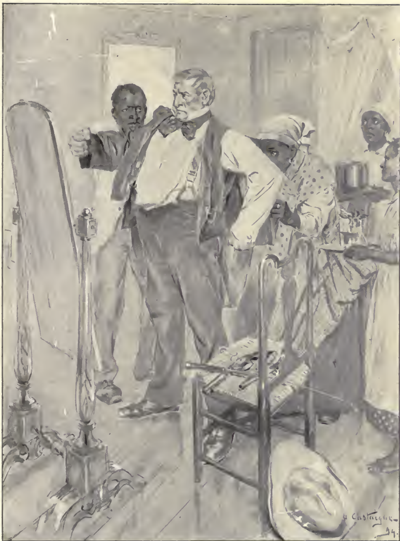
"He made Tom, Charity, and a half-dozen younger house-servants dress him."