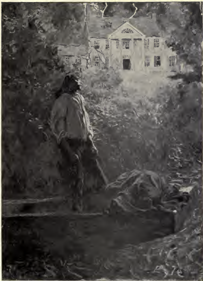
A man in it, standing upright, and something lying in a lump at the bow.