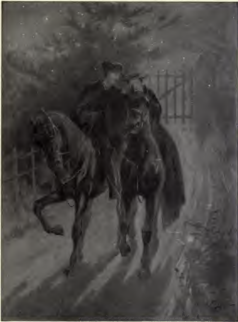
'The young man found it necessary to lean over and throw a steadying arm around her.'