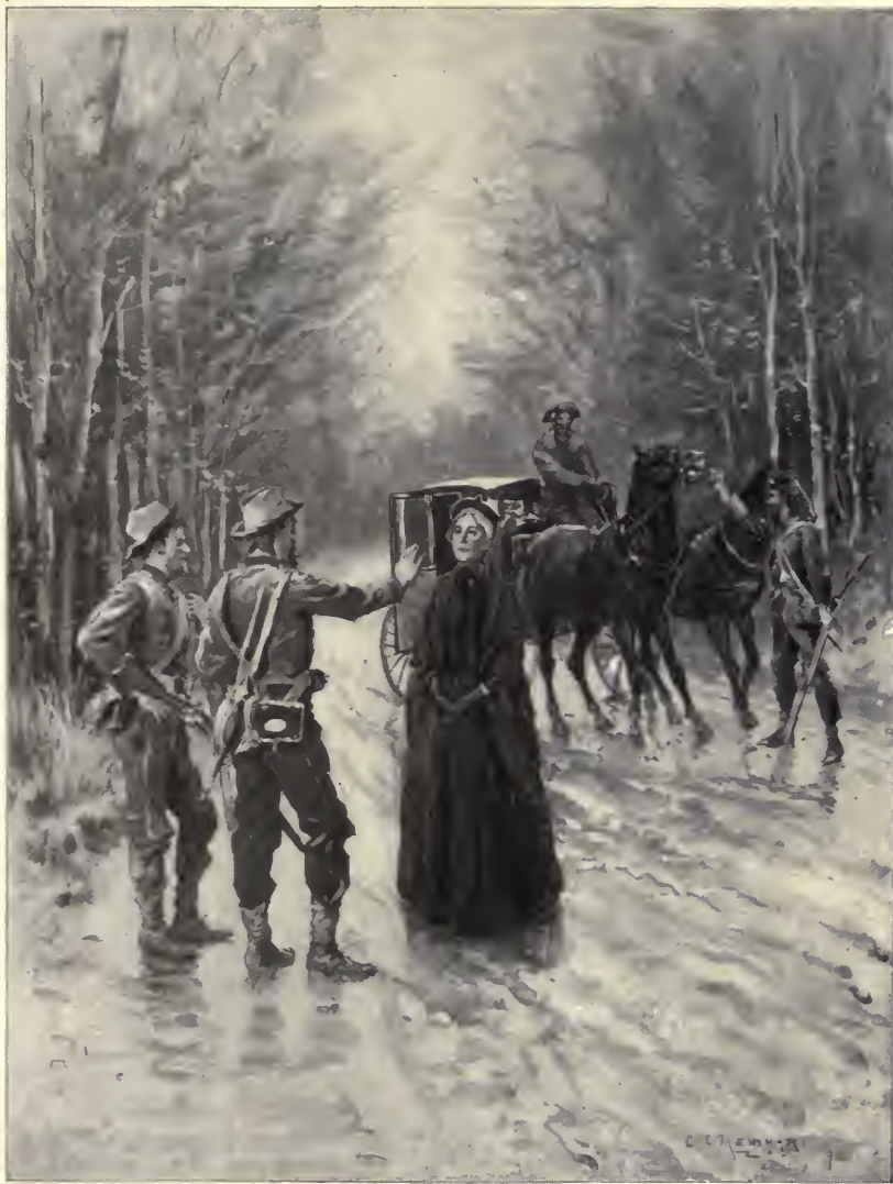
"She talk mighty sorf' but mighty 'terminated like."