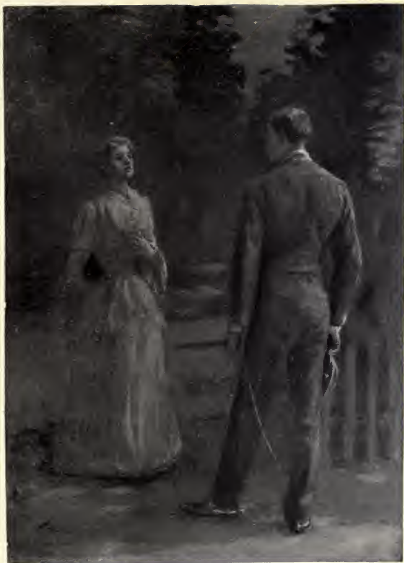
De moon come' out, an' I cotch sight on her stan'in dyah in her white dress."