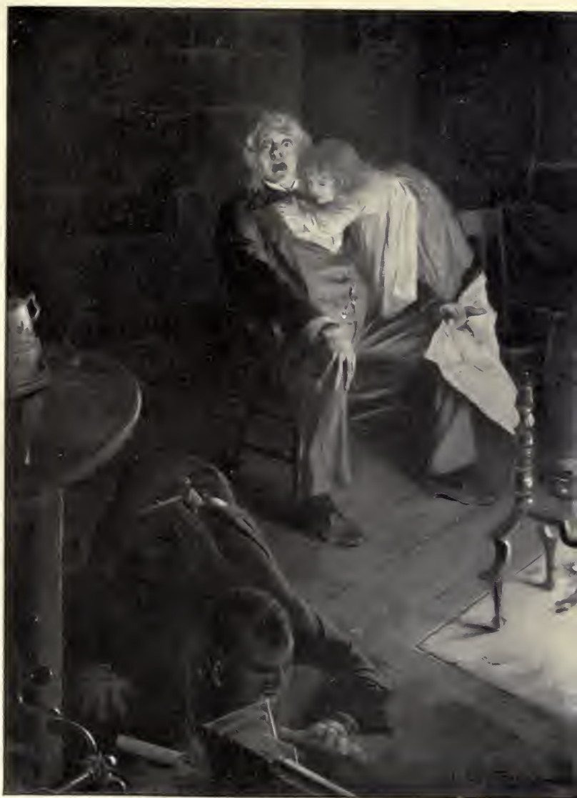
"Drinkwater Torm fell sprawling on the floor."