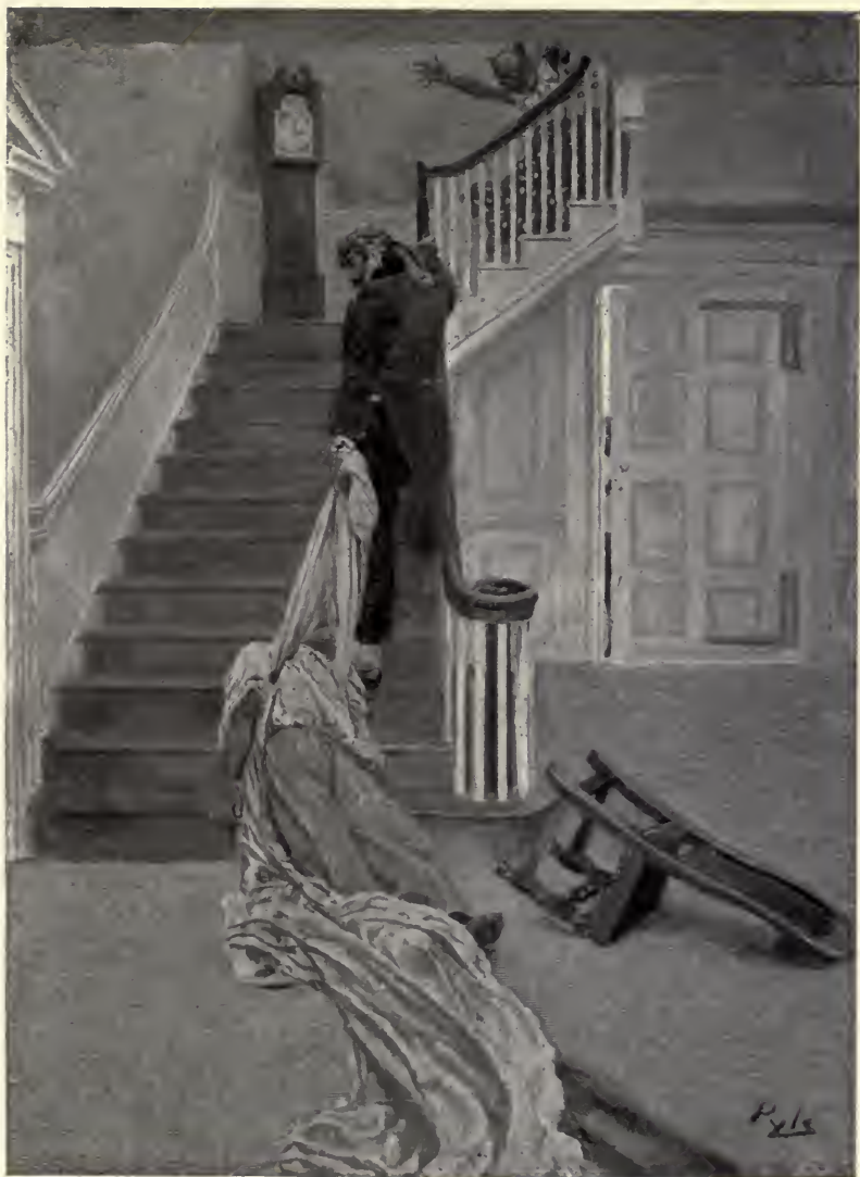
The gigantic monster dragged the hacked and headless corpse of his victim up the staircase.