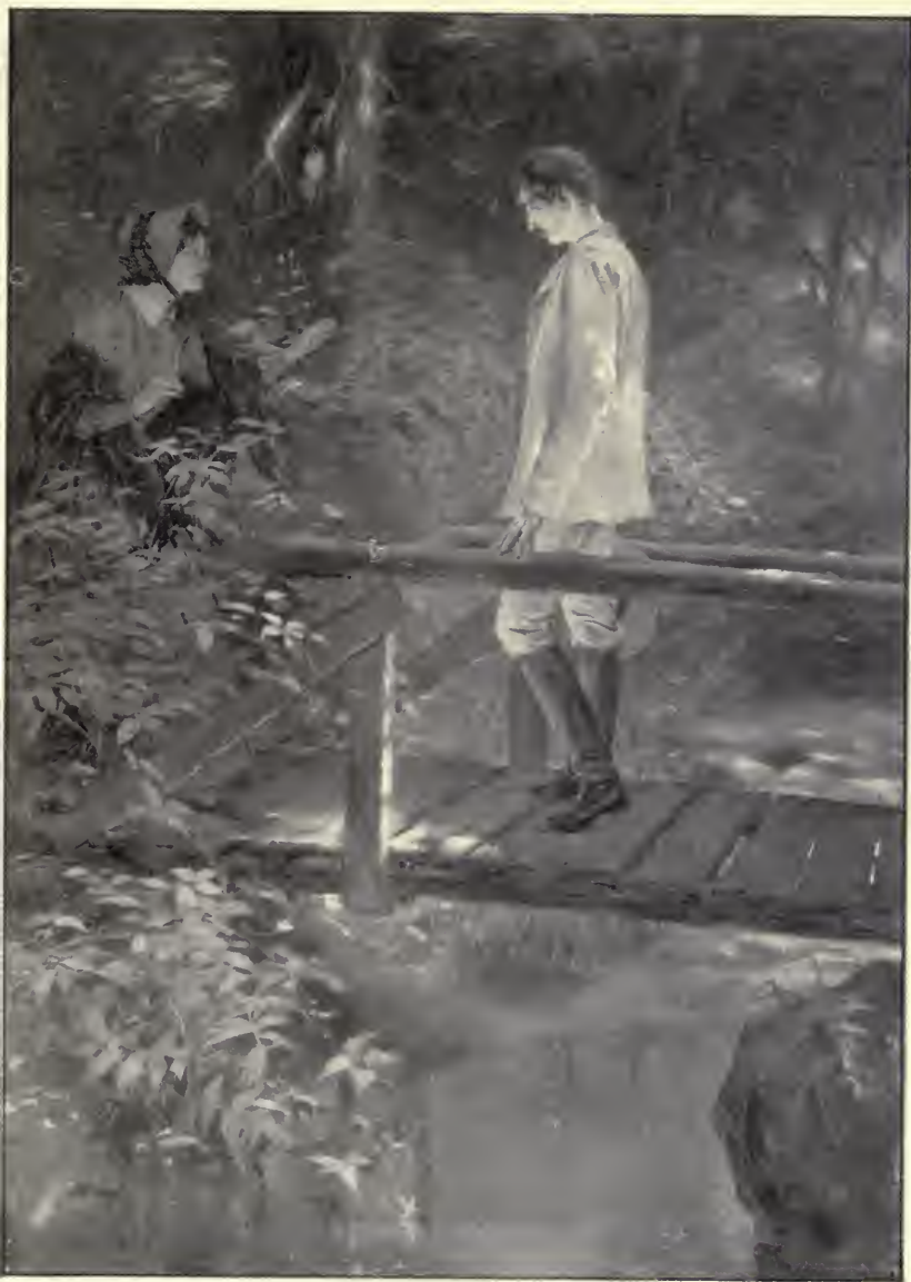
"There he was standing on the bridge just before her."