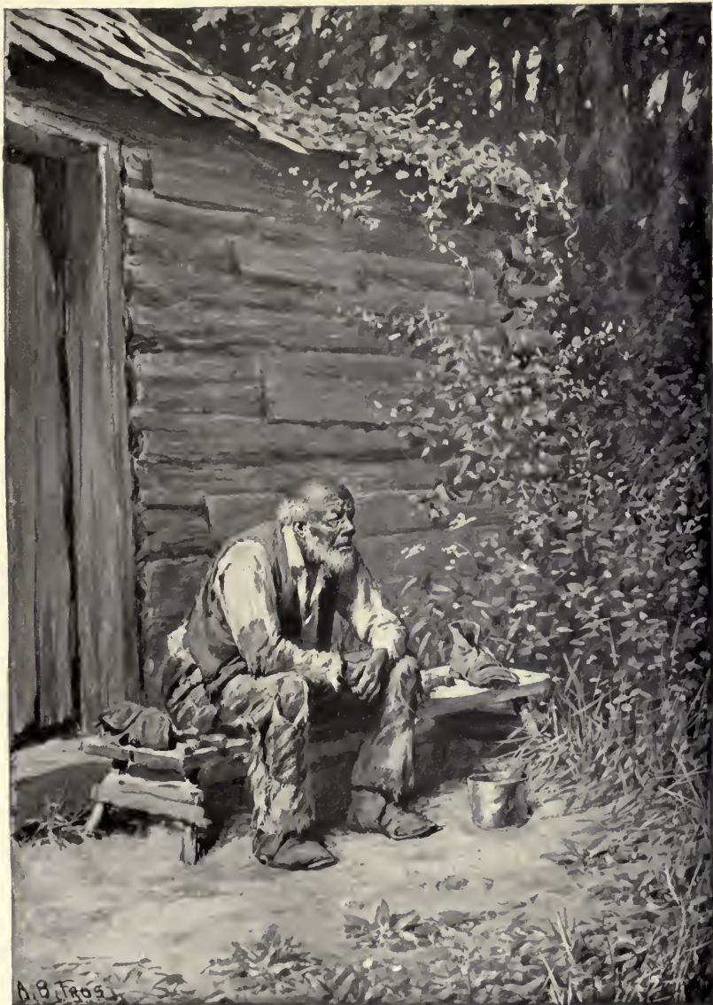
In mild weather he occupied a bench outside