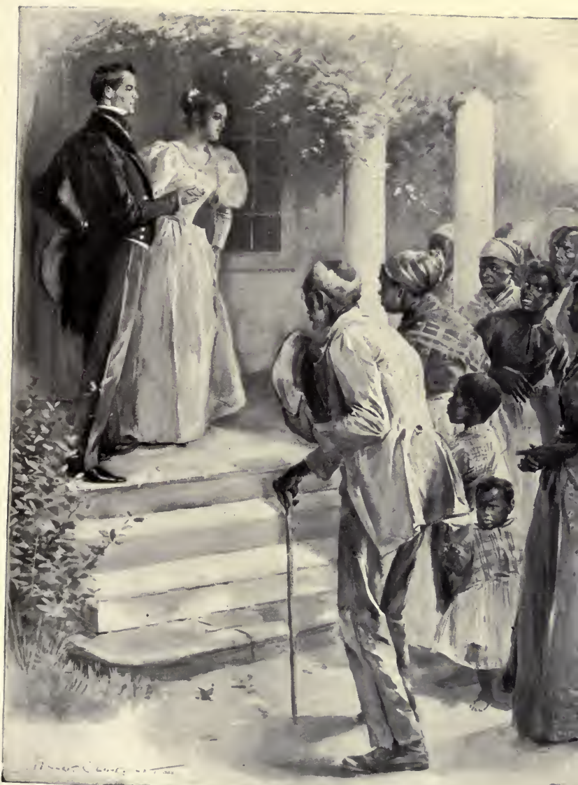
"Marse George lead her out on de porch."