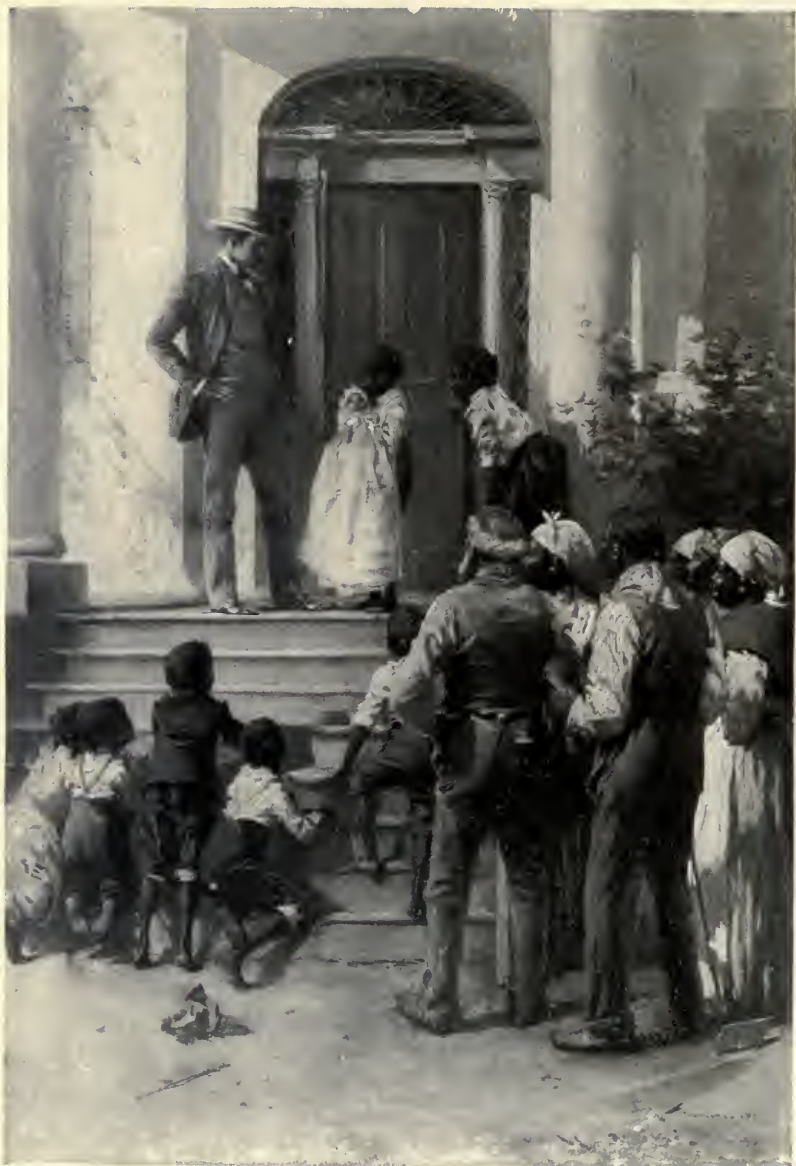
“Now, Sam, from dis time you belong to yo’ young Marsa Channin’.”