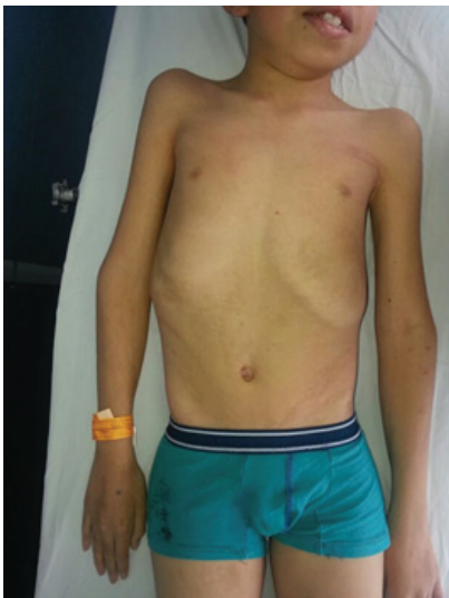
Figure 1. Frontal view of patient in which linear blotches (in the thorax and abdomen) and alterations of the extremities can be observed (digitalization of the thumbs and shortening of the fifth finger of the right hand).

The following report describes the case of a patient with mosaic trisomy 8, with a varied clinical presentation associated with cutaneous mosaicism. A diagnosis of mosaic trisomy 8 was made based on the karyotype of fibroblasts, that of peripheral blood being normal.