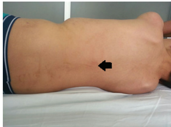
Figure 2. Dorsal view of patient showing brown linear blotches that followed Blaschko's lines.

The legal guardian of the patient signed the informed consent form allowing photographs to be taken and/or audiovisual recordings of medical genetics to be made, thus authorizing the images to be used in medical publications, including articles,