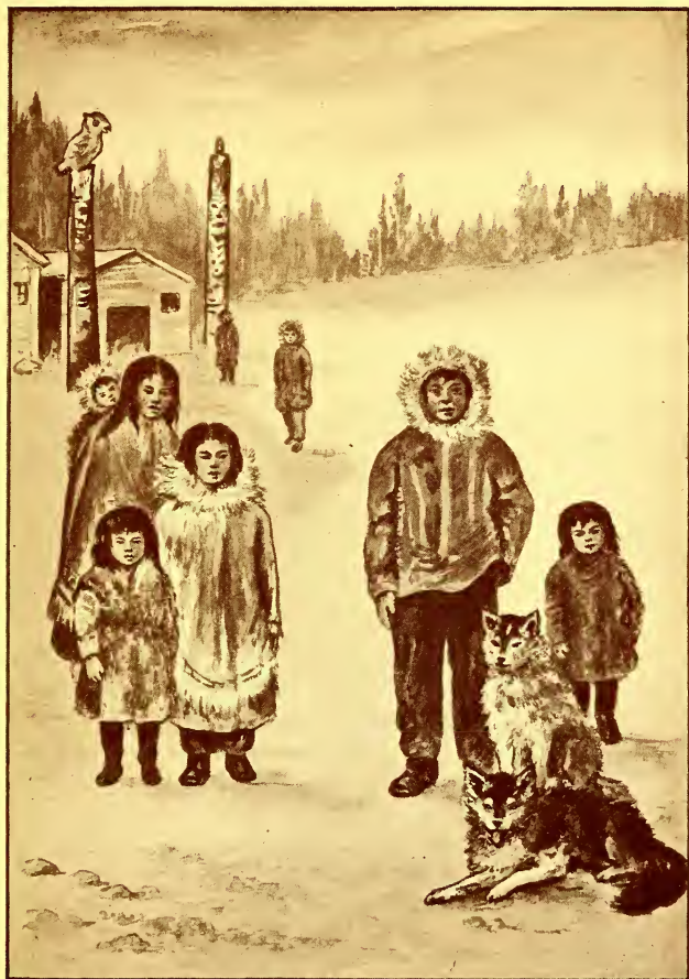
"A GROUP OF PEOPLE AWAITING THE CANOES."