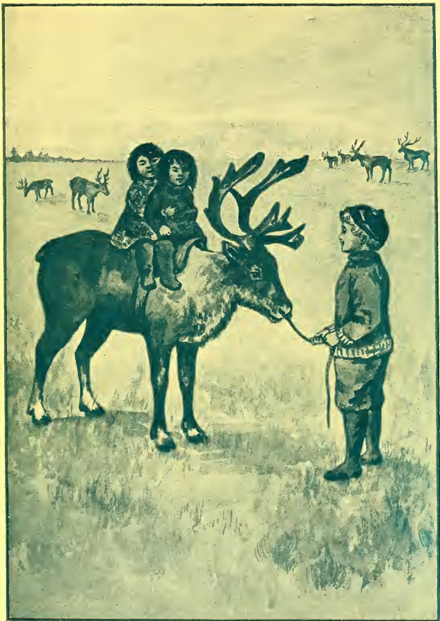
"TWO FUNNY LITTLE LAPP BABIES HE TOOK TO RIDE ON A LARGE REINDEER."