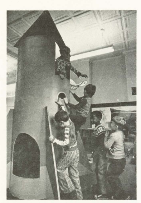
Part of the new environment created by the design students is a climb-in rocket (above), and three dimensional sculptured wood chairs (below)