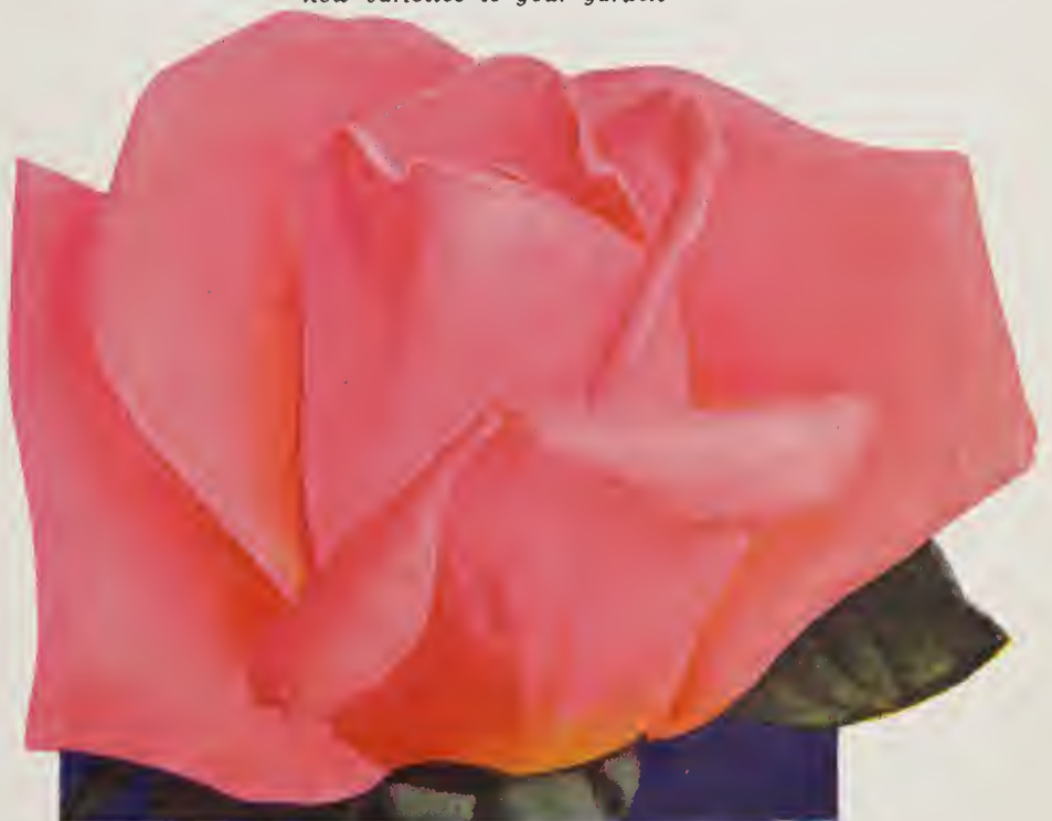
ELIZABETH OF YORK

Our Offer of Patented Roses (see front cover) will bring the new varieties to your garden