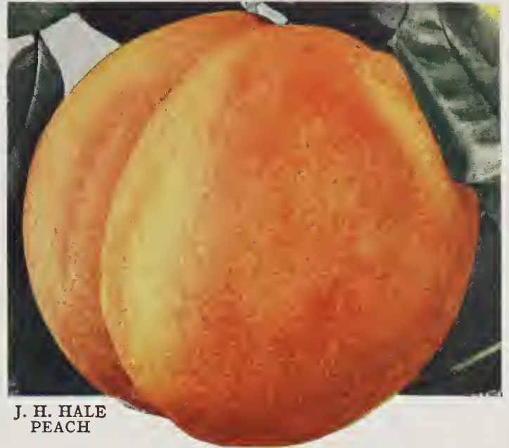
J. H. HALE PEACH

Why not get your neighbors to order Fruits, Shrubs or Roses with you? You will get the benefit of lower prices.