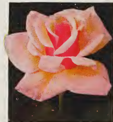
EDITH NELLIE PERKINS

All Roses here listed are 45 cts. each, $4.50 per doz., $15 for 50 plants, postpaid, except where noted