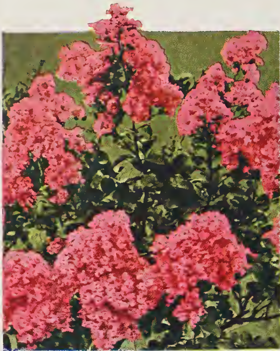
CRAPE MYRTLE. See page 17

PAMPAS GRASS ( Cortaderia argentea ). Grows about 6 feet high. Long, narrow blades that droop gracefully. Large, silver plumes. Small clump, 50 cts. each; medium clump, $1, postpaid.