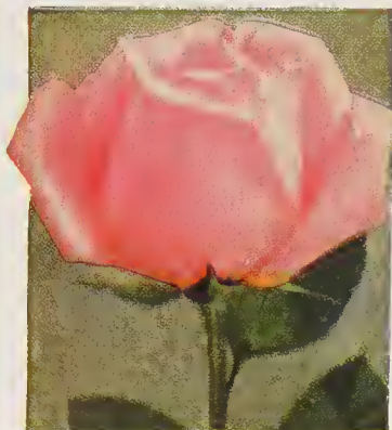
MME. CAROLINE TESTOUT

MARGARET BELLE HOUSTON. HT. Large, fragrant, velvety crimson blooms carried on straight stems. Plant grows to medium height. Best-grade, 2-yr. plants, 60 cts. each, $6 per doz., $22.50 for 50 plants, postpaid.