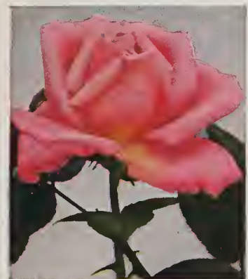
SOUV. DE GEORGES PERNET

ROSLYN. HT. Similar to Souvenir de Claudius Pernet, but a much deeper golden yellow. A fragrant and lasting Rose.