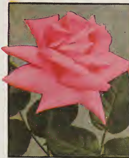
MRS. HENRY BOWLES

PRISCILLA. HT. Large, fragrant blooms with outer petals rose-pink and center petals Tyrian pink. Plant is an upright grower, with glossy deep green, disease-resistant foliage. Best-grade, 2-yr. plants, 50 cts. each, $5 per doz., $17.50 for 50 plants, postpaid.