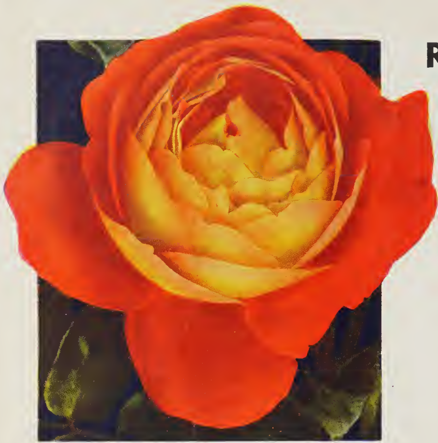
CONDESA DE SASTAGO