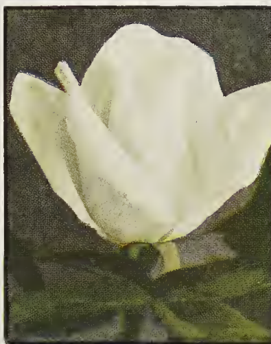
DOUBLE WHITE KILLARNEY

MISS CYNTHIA FORDE. HT. Flowers are deep brilliant rose-pink, shading to light rosy pink on the back of the petals, full double, slightly fragrant, and long lasting. Best-grade, 2-yr. plants, 50 cts. each, $5 per doz., $17.50 for 50 plants, postpaid.