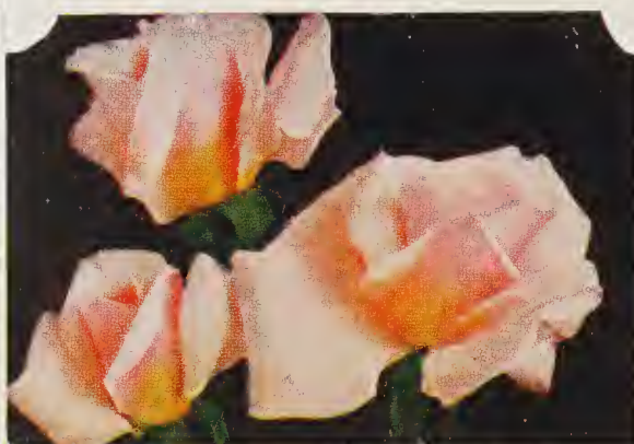
CECILE BRUNNER (SWEETHEART)