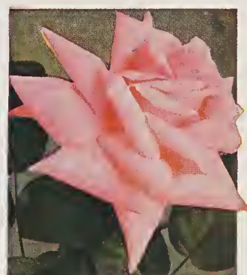
GRACE NOLL CROWELL