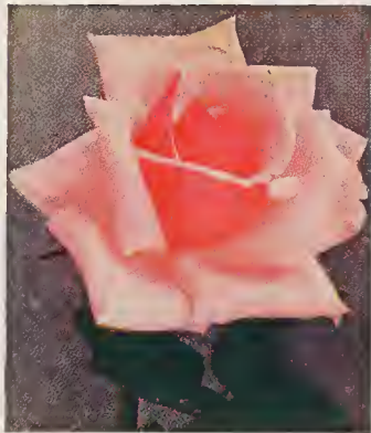
JONKHEER J. L. MOCK

One plant of each (12 plants) 2-yr., heavy specimens, postpaid $5 for only . . . . .