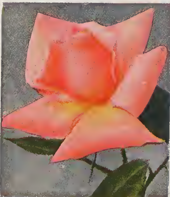
MME. EDOUARD HERRIOT

RADIANCE. HT. One of the leading Roses for the South, or for any part of the country, for that matter. The buds are rose-pink, opening into large pink blooms with a lighter tint on the reverse of the petals. The blooms are fragrant, carried very freely during the season on plants that are strong, upright growers.