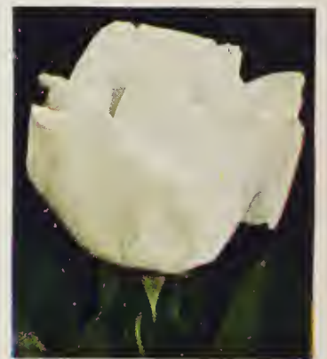
FRAU KARL DRUSCHKI