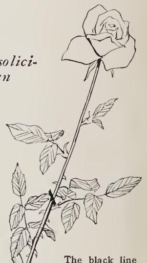
The black line shows where to cut