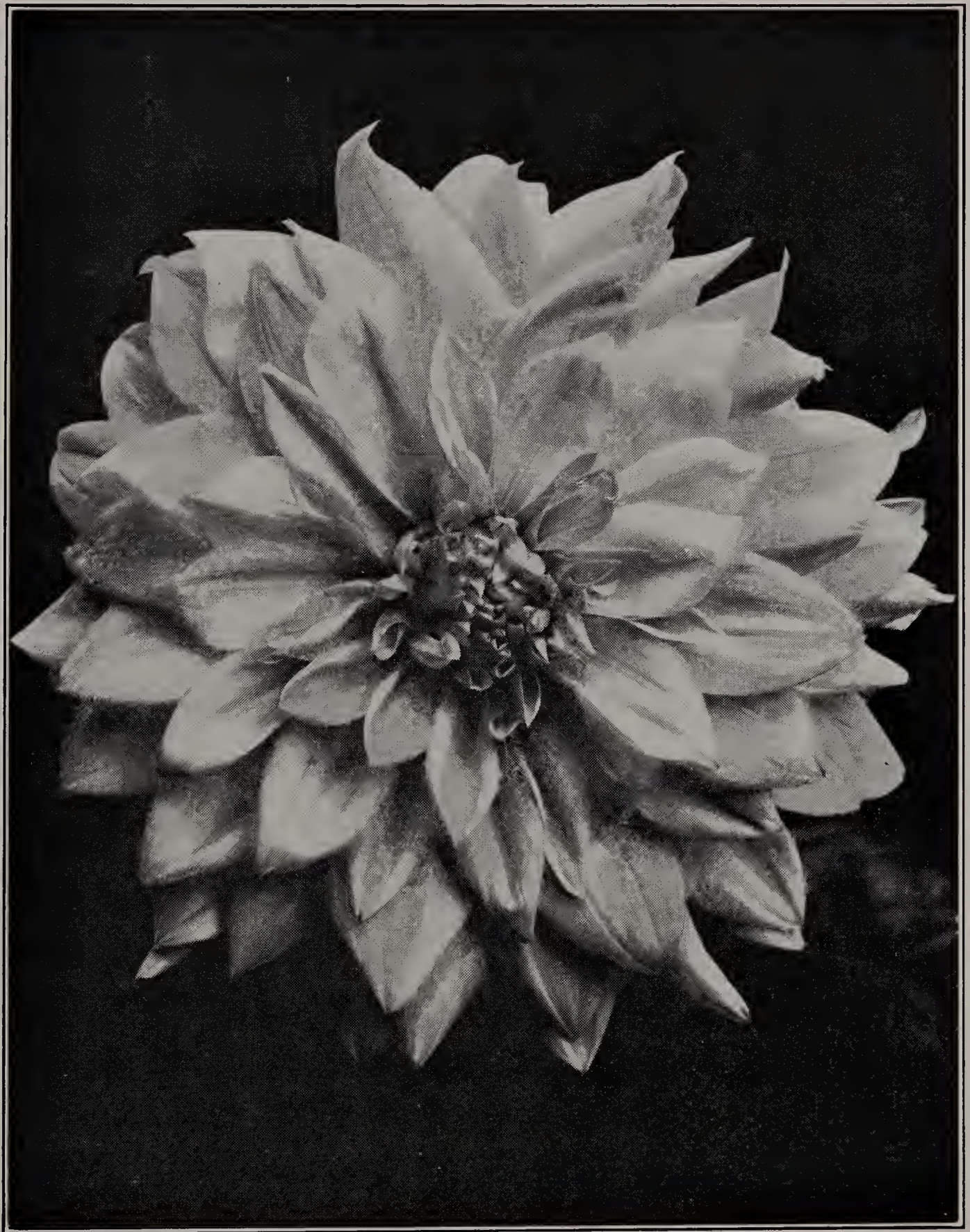
GORGEOUS (1. Dec.) (Broomall-Success)

A WONDERFUL DAHLIA. A MONSTER AND WONDERFULLY COLORED.