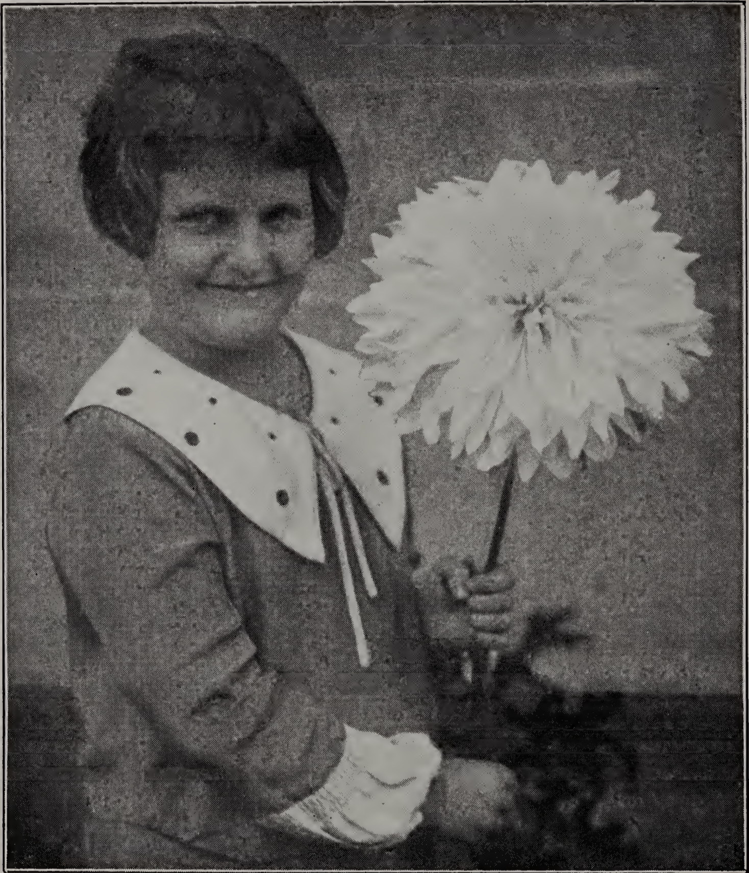
Dahlia "MARGARET E. BROOMALL" (15 inch bloom)

Winner of American Home Achievement Medal and $100 cash prize, also cash prize for largest and most perfect bloom at Atlantic City, 1930.