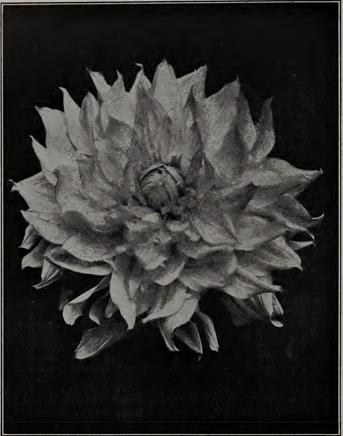
ALBATROSS (1. Dec.) (Ballay-Success)