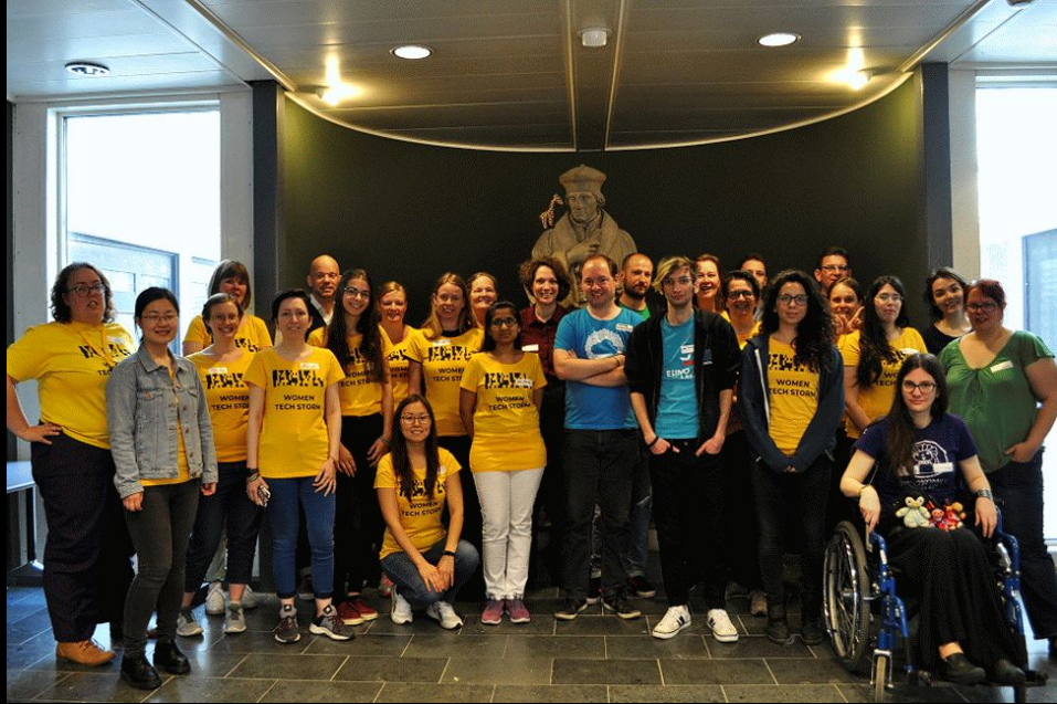
Participants of the Women's Tech Storm Hackathon in Amsterdam 2018.