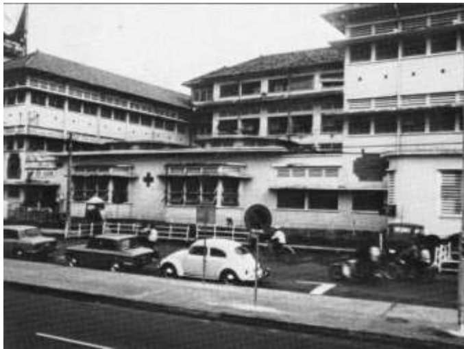
Facilities of the 3d Field Hospital, Saigon.