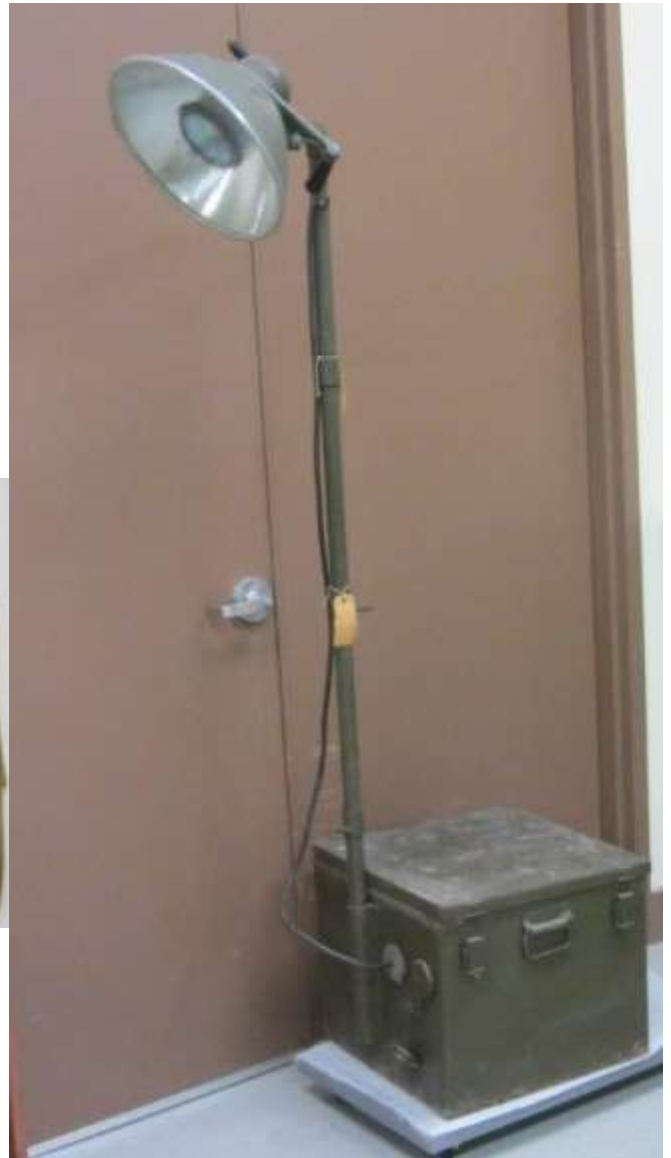
A WWII-manufactured "Field Operating Lamp" that dissembled for travel in its steel base. The lamp was easily set up for operation and could run off various power sources including A/C or D/C current, a portable generator, or from the dry cell batteries stored in the base.