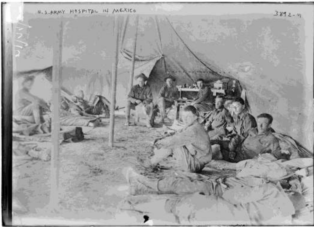
A field hospital in Mexico during the Punitive Expedition.

In 1942 the Army revived the term Field Hospital, as it needed a new size of hospital to fill a gap. Station Hospitals provided low-acuity hospitalization, but they were not mobile and the smallest station