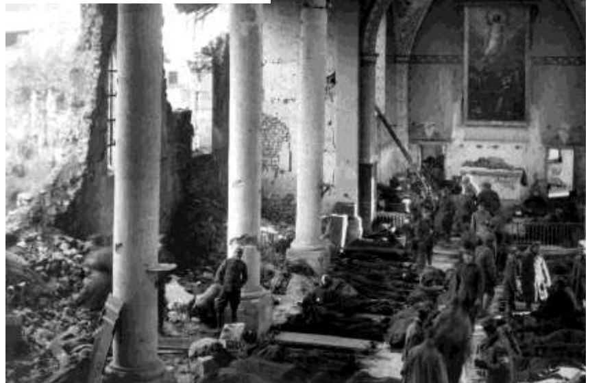
The 139th Field Hospital (Kansas National Guard) at Neuville, France, late September 1918.

After WWII, the Field Hospital continued in the same size (400 beds, or three 100-bed platoons) with the same role. Field hospitals would be sent where there were soldiers, but combat casualties were unlikely, such as military advisory situations. That led to the 8th Field Hospital in downtown Saigon from 1962, as the Military Advisory Group Vietnam expanded to the Military Assistance Command Vietnam. But a hospital in downtown Saigon was no ordinary deployed hospital: it had a cardiac care unit, and the nurses were ordered to wear the starched white hospital uniform, even once the Vietnam war heated up.