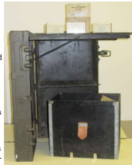
The Modified Medical Chest contained a fold out table and was divided into two compartments with containers of surgical dressings and bandages.

Some equipment was not packed in chests. Surgical equipment came pre-organized and packed, with each canvas roll containing the instruments necessary for a specific purpose. Item # 93210 was the Basic In-