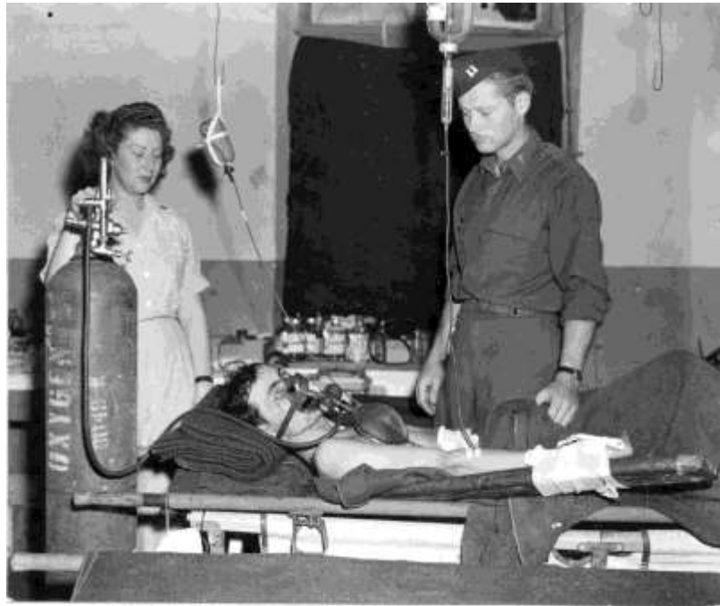
Pre-operative ward, 3d Platoon, 54th Field Hospital. 27 October 1944, somewhere in France.