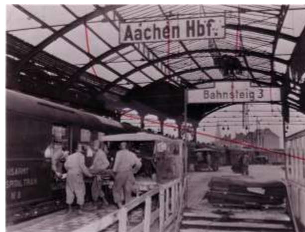
Men of the 723d Medical Sanitary Company loading wounded soldiers onto a hospital train, Aachen, Germany. Red marks on photo are the censor's marks.

This is based on the author's article of the same title in the Journal of the National Medical Association, volume 104 no. 1-2 (Jan-Feb 2012) pages 96-103, available at http://www.nmanet.org/sample_journals/January-2012-sample.pdf