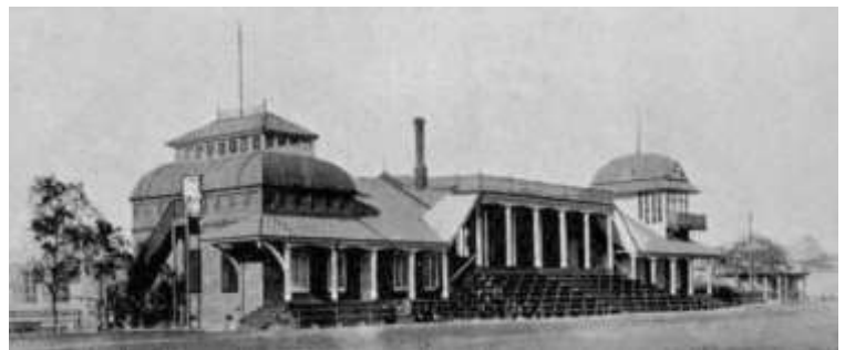
The 1st Battalion initially bivouacked beneath the grandstand of the Shanghai Racetrack but found it to be cold, damp, and unsanitary and were later moved to a renovated library within the International Settlement.

Much time and labor was devoted to venereal disease control during the deployment. At first it was not a pressing medical issue, but as hostilities decreased contraction of venereal disease be-