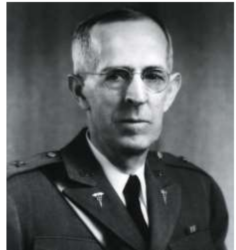
Albert Love as a brigadier general.

After WWII the analysis became much more detailed. For the 1960 edition of FM 8-55 there were da-