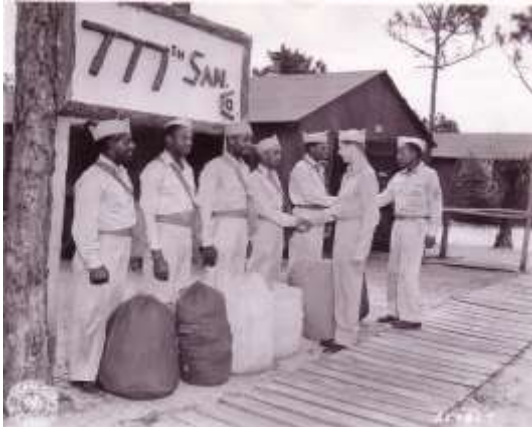
Company area of the 777th Medical Sanitary Company.

from their respective duties so that they could attend the training program classes ... was no easy matter. The Medical Officers needed the men to keep their respective departments functioning smoothly, and often complained to the Post Surgeon.” The lack of meaningful medical duties undermined morale and led to at least one protest. In 1943, the 703d Sanitary Company, at Fort Custer, Michigan, recorded “a disturbance regarding the use of the enlisted personnel for menial duties and such work as is ordinarily performed by engineering units. [This may refer to trash and latrine-emptying duties.] This matter was adjusted immediately and the men returned to their duties in the hospital wards.”