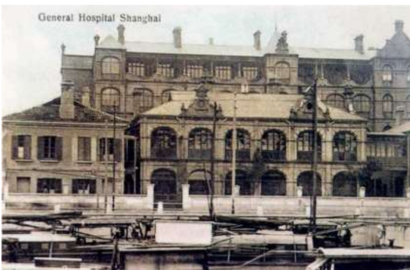
All major surgery was performed at the Shanghai General Hospital.