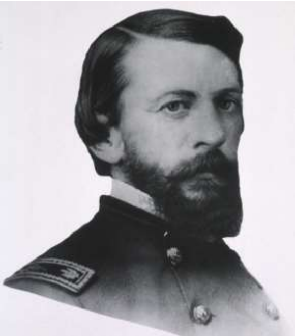
Surgeon and Major Jonathan Letterman

In May of 1862, Jonathan Letterman reported to General George McClellan at Harper's Ferry, Virginia, as the new Medical Director of the Army of the Potomac, which was a large segment of the Union Army, consisting of more than 30,000 men. Letterman was a U.S. Army physician with more than 10 years of experience who graduated in 1849 from Jefferson Medical College in Philadelphia. At the time of his arrival to the battlefield, General McClellan wrote of his army, "The nature of the military operations had also unavoidably placed the Medical Department in a very unsatisfactory condition. Supplies had been almost exhausted or necessarily abandoned; hospital tents abandoned or destroyed, and the medical officers deficient in numbers broken down by fatigue." Letterman immediately began the daunting task of organizing medical support. He did so with tireless effort, ingenious organizational skills, and strong leadership.