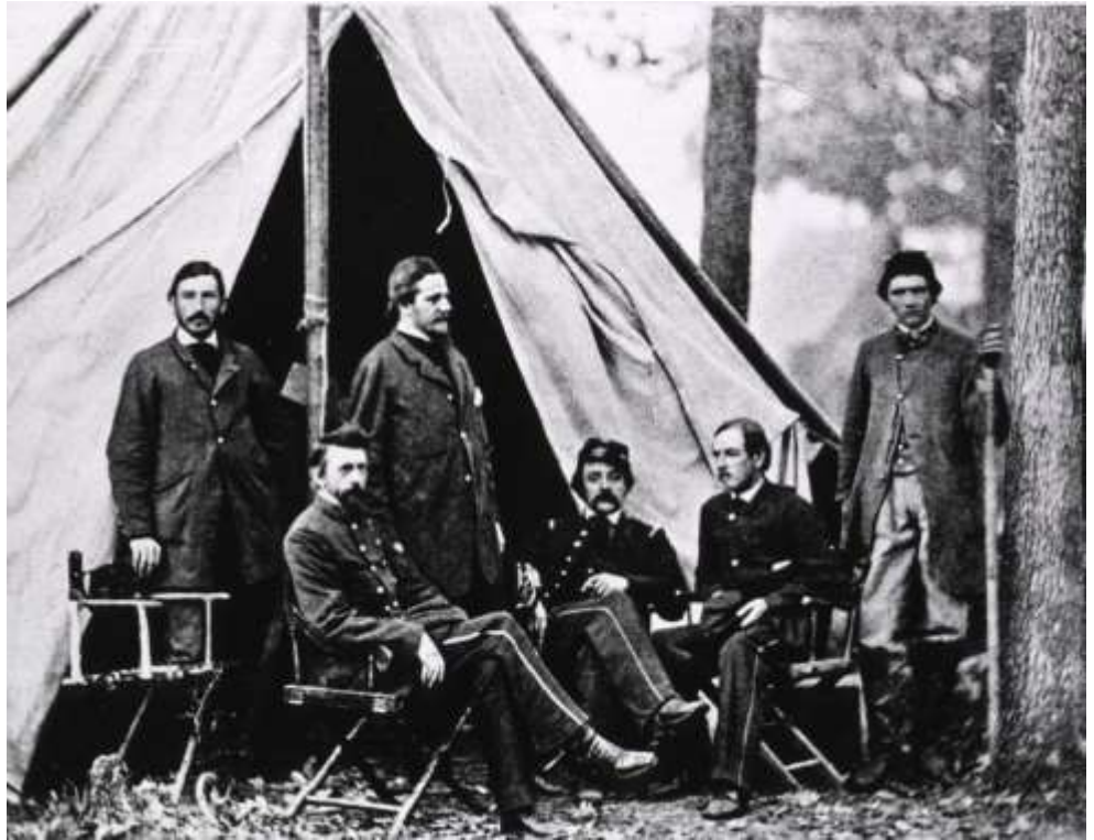
Letterman and his staff. The whole medical staff of the Army of the Potomac (up to 100,000 men) was a handful of officers.

The deplorable unsanitary conditions in the Army's camps and poor personal hygiene habits of soldiers posed another negative determinant for the health of soldiers. Letterman wrote of the soldier's plight at Harrison's Landing, "Marching and fighting in such a region, in such weather, with lack of food, want of rest, great excitement, and the depression necessary consequent upon it, could have no other effect than that of greatly increasing the numbers of sick..." After Letterman observed the soldiers and gave careful thought to their individual needs, he recommended commanders enforce the following practices: sleep schedules, better cooking to ensure the most nutrition, the depth that wells should be dug to ensure clean water, the proper way to bury dead animals, and how to organize tents in camp to ensure ventilation. Letterman even inserted himself into the combat commander's realm by recommended how long soldiers trained and how long to rest when the weather was too hot or too cold. Letterman felt these simple changes, which most men of the 1860s would not have considered, would greatly increase the fighting strength of the army. He was right.