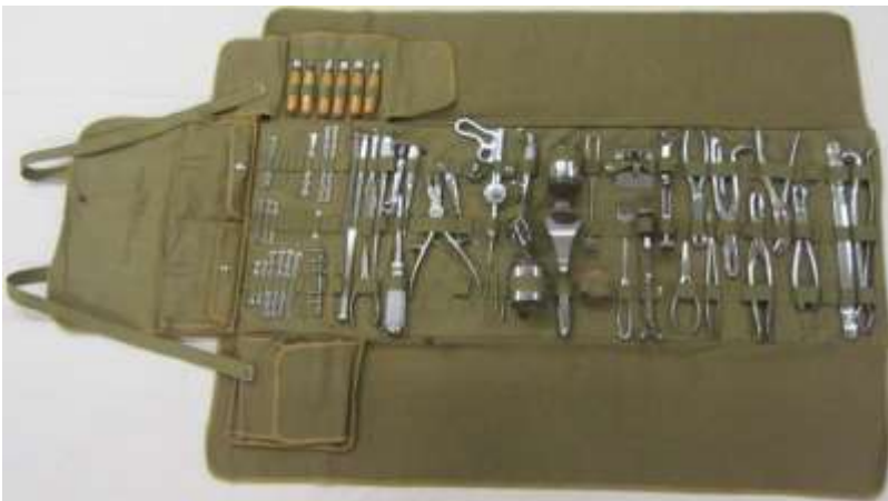
Field Hospitals were issued a Basic Instrument Set and Supplemental Instrument Sets due to their surgical mission. This is the Supplemental Set for Fractures and Amputations, and contains a broad range of orthopedic instruments.

The success of the field hospitals in WWII in following the Army on the march led to the next evolution in forward surgical care, the Mobile Army Surgical Hospital of the Korean War.