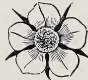
No. 2 Pistillate or Imperfect

The illustrations herewith show the difference in the male and female blossoms of the strawberry. Illustration No. 1 shows the stamens (male blossom) called the staminate. Illustration No. 2 shows the (female blossom) pistillate.