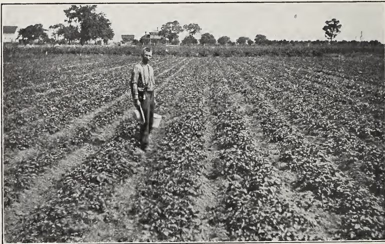
A FIELD OF STRAWBERRY—With Raspberry in the background

Delaware —is a leader and one of the finest red grapes grown. Catawba —The well known wine grape. Agawam , a leader for the commercial grower. Regal , an old new one, introduced some 30 years ago, but never had any booming, a remarkable early sort, bearing a very heavy load of fruit and is actually the best red grape grown. I can also recommend Isabella , Brighton , Wyoming Red and Woodruff Red as among my best sellers. Vergennes (a light amber) is also a fine variety.