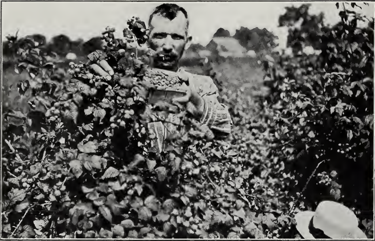
MY FIELD OF COLUMBIAN RASPBERRIES.