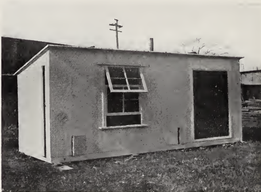
Style A-3 House, 7x16 ft.—Complete, Roosts and Nest Outfit, $36.00

If a man can write a better book, preach a better sermon, or make a better mouse trap than his neighbor, though he build his house in the forest, the world will make a beaten path to his door.—Emerson.