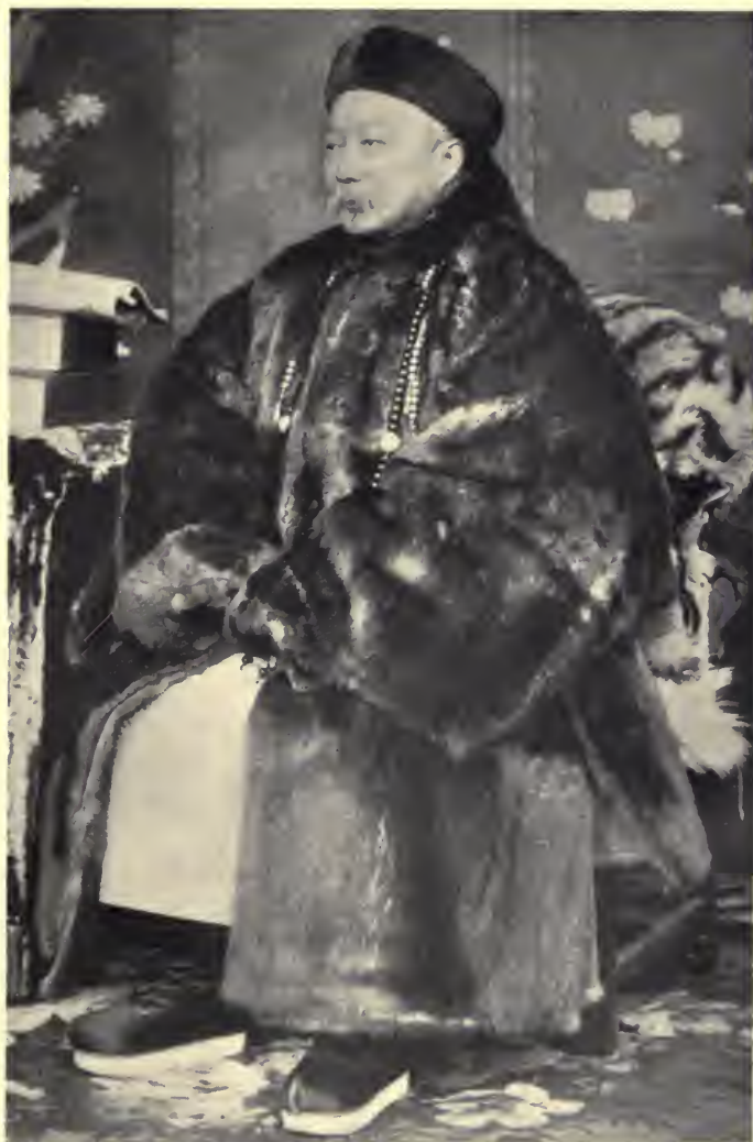
KANG, THE REFORMER