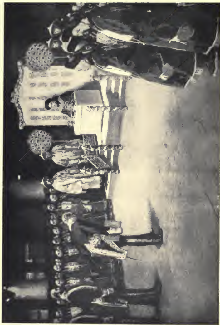
THE EMPEROR RECEIVING THE DIPLOMATIC CORPS