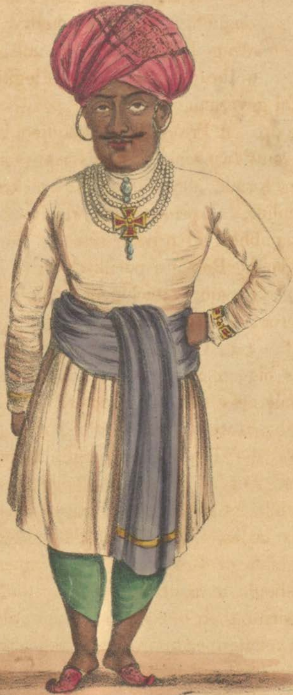
HIS HIGHNESS THE RAO OF CUTCH.