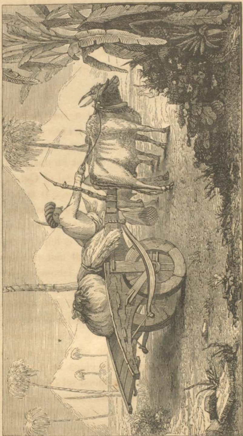
A CATCH CART.