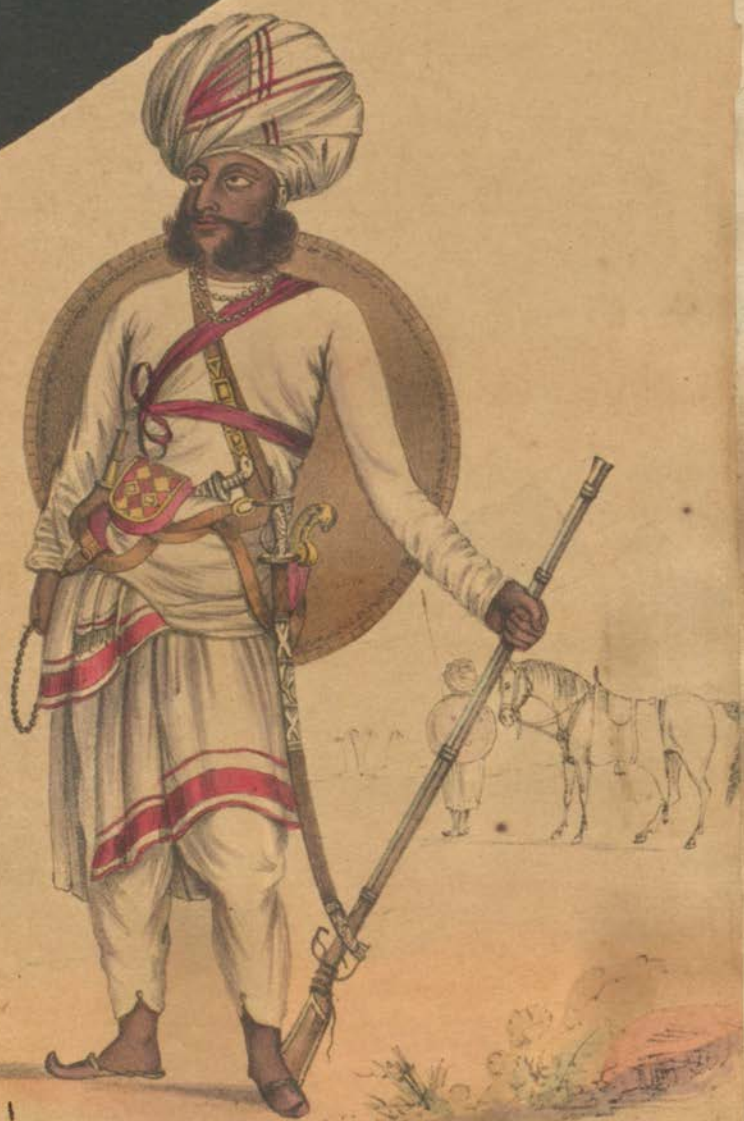
DURBAR HORSEMAN, In the service and pay of the Rao of Cutch.