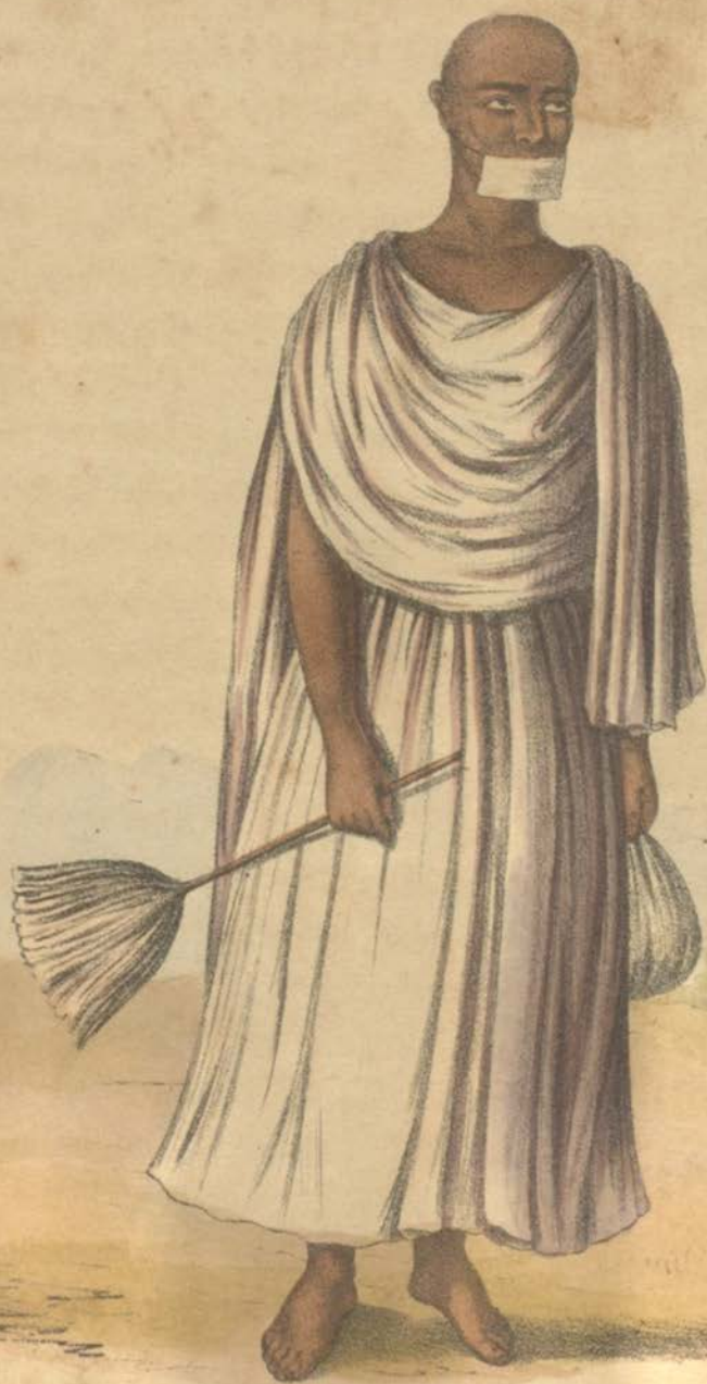
A PRIEST OF THE JAIN SECT.