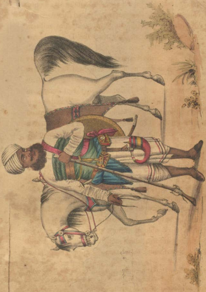
A SEYED MERCENARY SOLDIER.