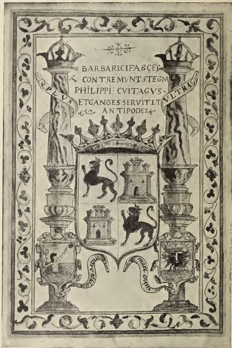
Facsimile (reduced) of PAGE I OF THE SARMIENTO MS. 1572.

From the original, Göttingen University Library.