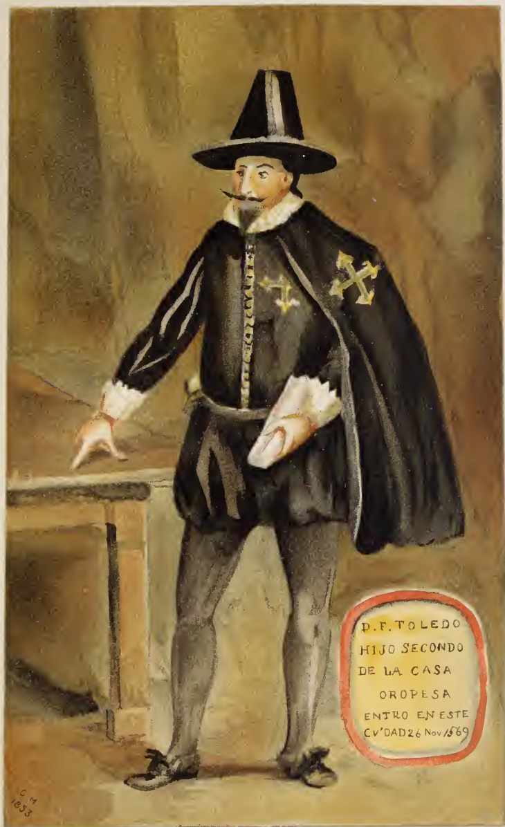
DON FRANCISCO DE TOLEDO, Viceroy of Peru, A.D. 1569—1581.

After the portrait at Lima, from a sketch by Sir Clements Markham, 1853.