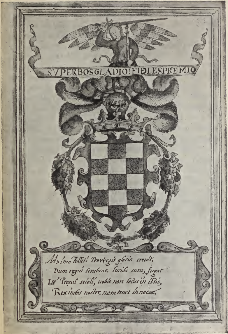
Facsimile (reduced) of the COAT OF ARMS OF DON FRANCISCO DE TOLEDO, VICEROY OF PERU, 1569—1581.

From the Sarmiento MS. 1572, Göttingen University Library.