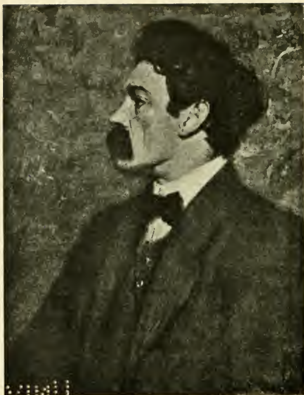
JOHN MILLINGTON SYNGE