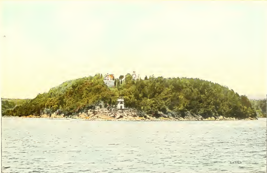
Stony Point of Revolutionary Fame., Captured from the British by "Mad Anthony" Wayne.