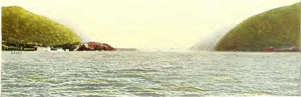
Entering the Hudson Highlands from the North. Storm King and Old Cro' Nest Mts. on right. Breakneck and Mt. Taurus on left.