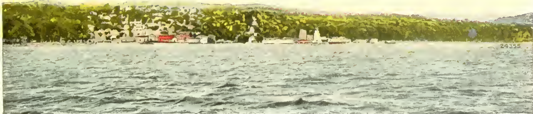
Tarrytown, N.Y., from the Hudson.