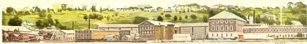
Sing Sing Prison, Ossining, N.Y., in background.