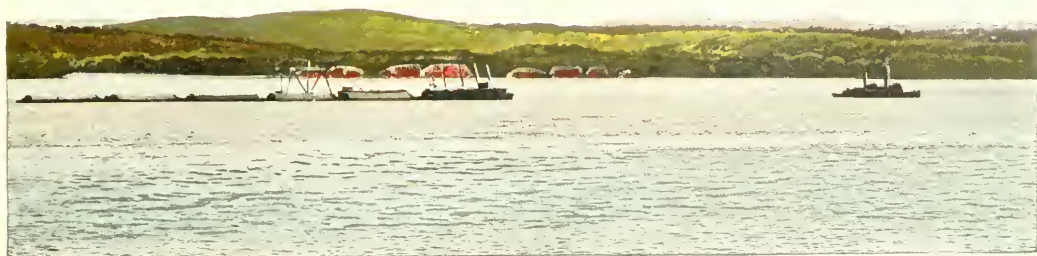
Brick Industry, Haverstraw, N.Y. Haverstraw Bay, about four and one-half miles wide at this point.