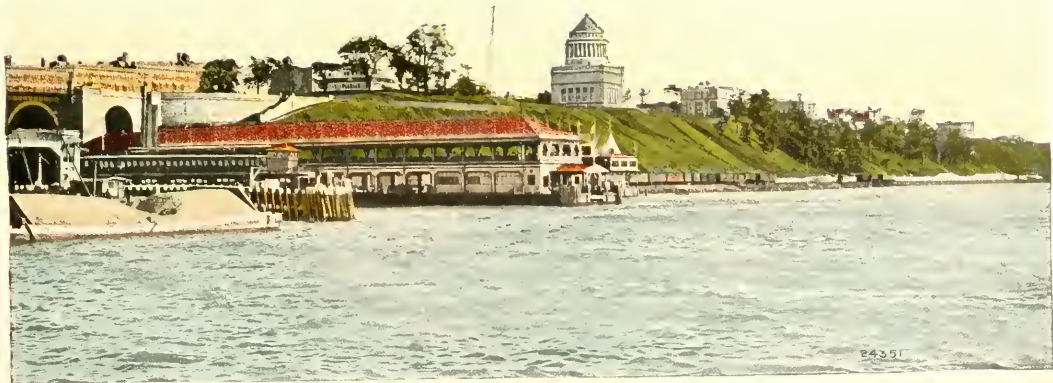
Grant's Tomb and Riverside Drive from the Hudson River, New York City.