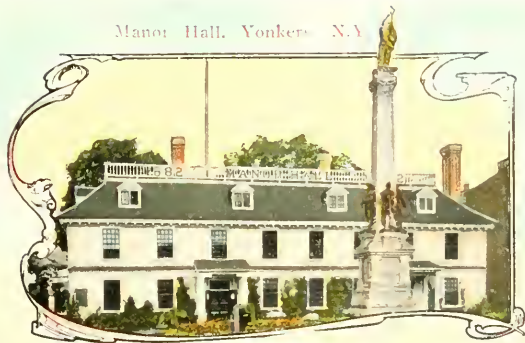
Manor Hall, Yonkers, N.Y.