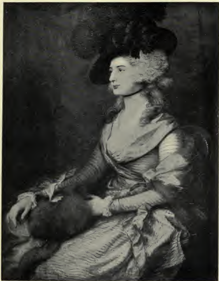
MRS. SIDDONS BY GAINSBOROUGH