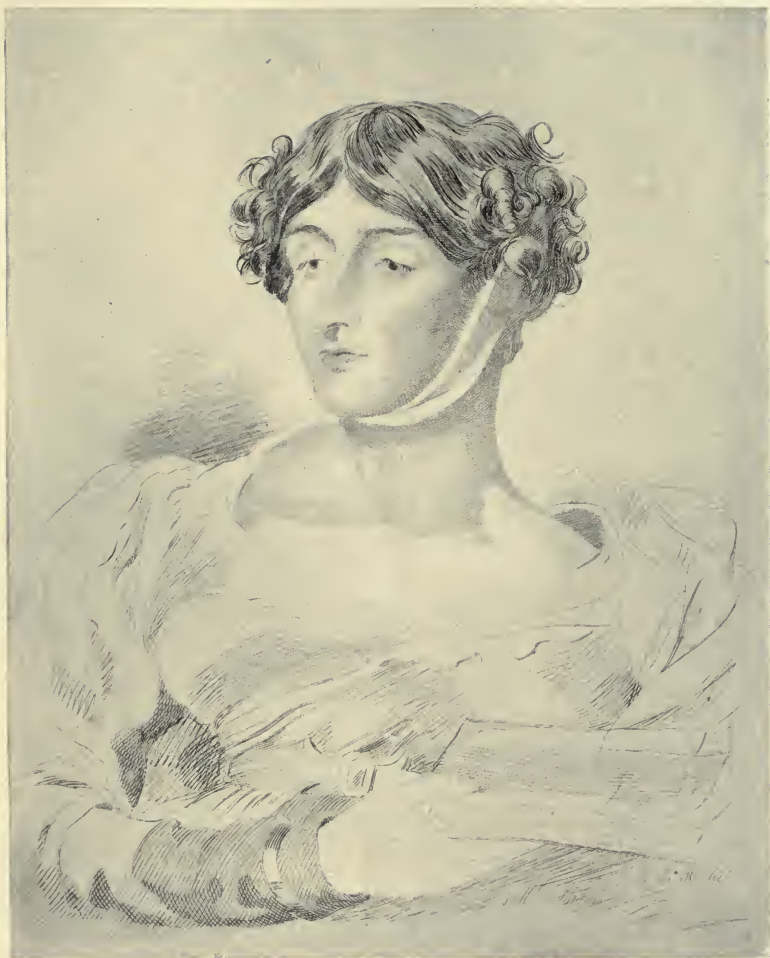
MRS. SIDDONS BY HARLOW