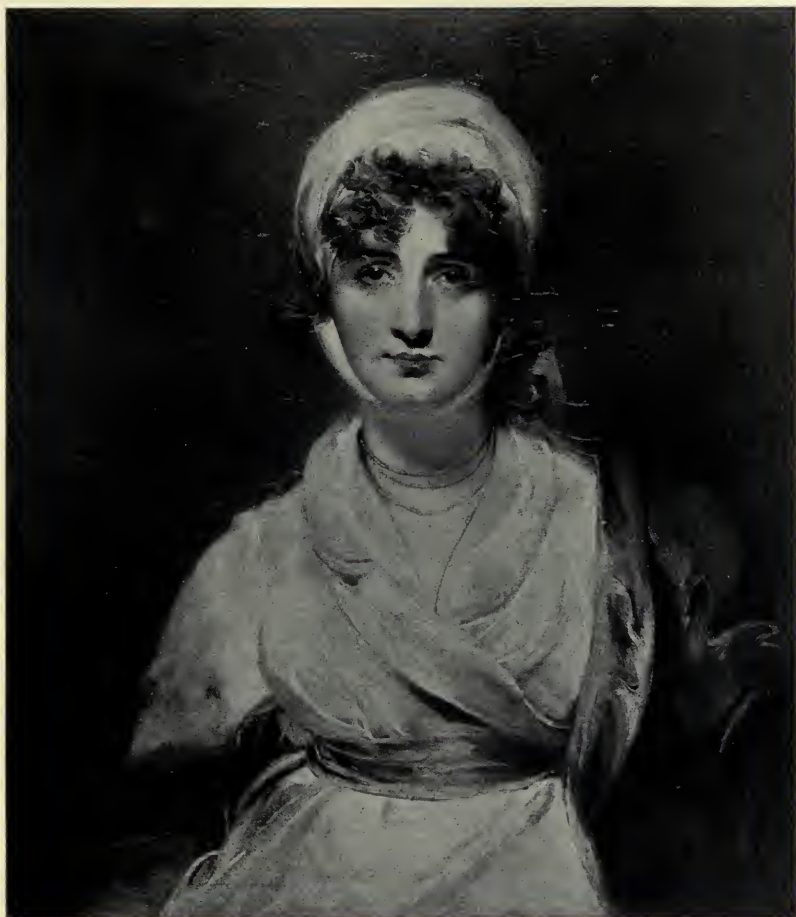
MRS. SIDDONS BY LAWRENCE