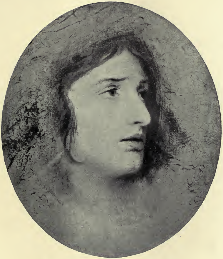
"MRS. SIDDONS. TRAGIC ACTRESS. PAINTER UNKNOWN"