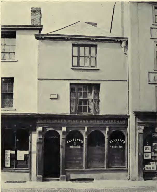
AS IT IS