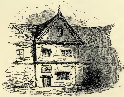
AS IT WAS IN 1755