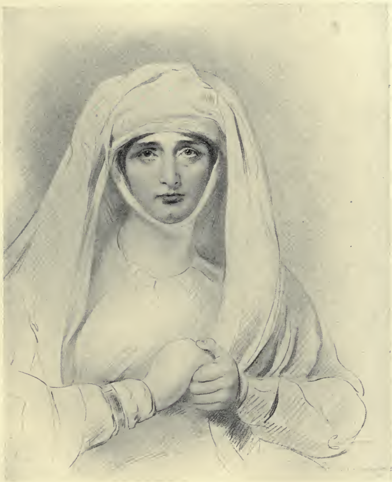
MRS. SIDDON'S ONLY PORTRAIT AS LADY MACBETH