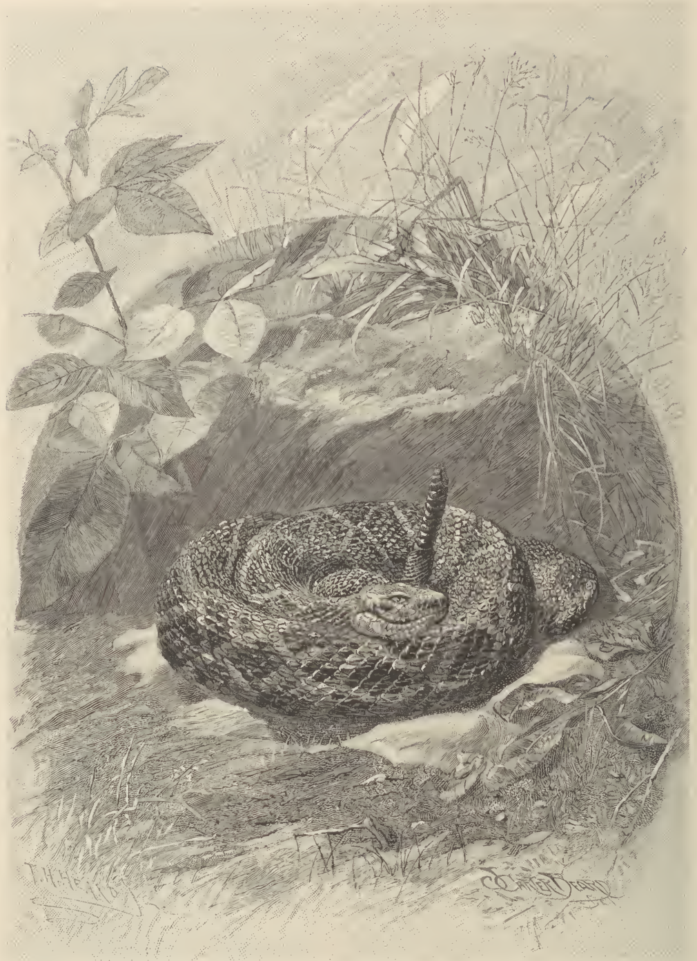
RATTLESNAKE IN COIL.

into biting on a bundle of rags tied to a stick. They were too tired to be dangerous. I have often seen snakes in this state. After three or four fruitless acts of instinctive use of their venom