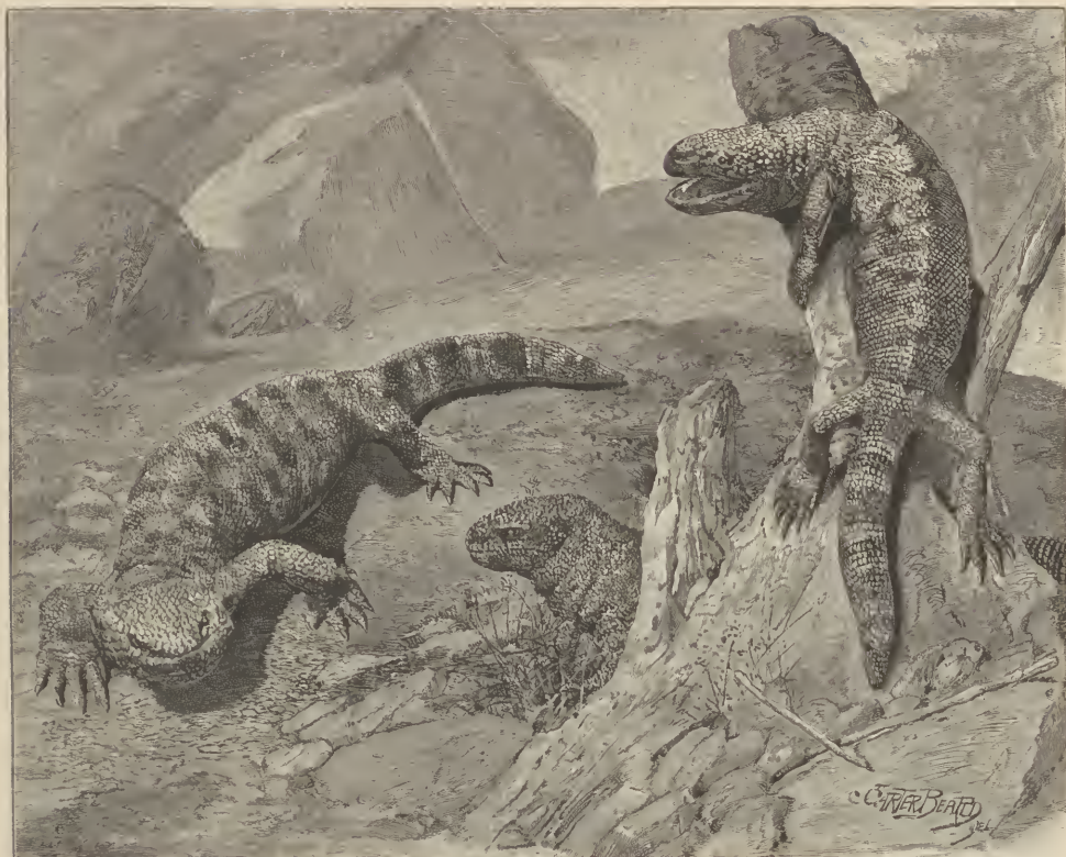
GILA MONSTERS—POISONOUS LIZARDS.

mechanism which enables the serpent to use its poison.