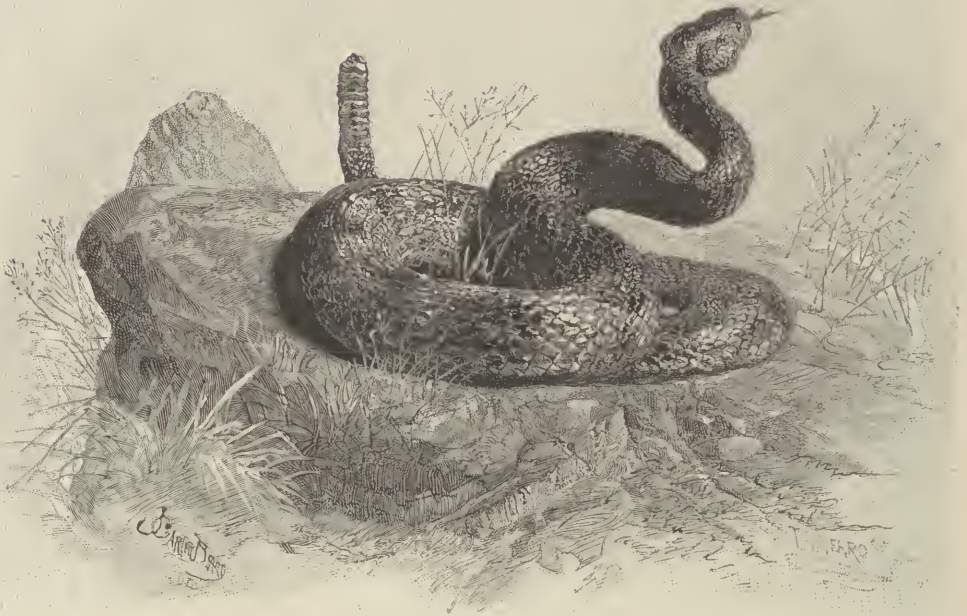
RATTLESNAKE COILED TO STRIKE.

cloak-like cover, a fold of the soft skin of the interior of the upper jaw. At the base of each of these fang teeth is an opening connected with a tube running backwards under the eye to an almond-shaped gland which forms the poison. This body continuously manufactures venom, and holds in its cavity a supply for use. Over the gland runs a strong muscle,