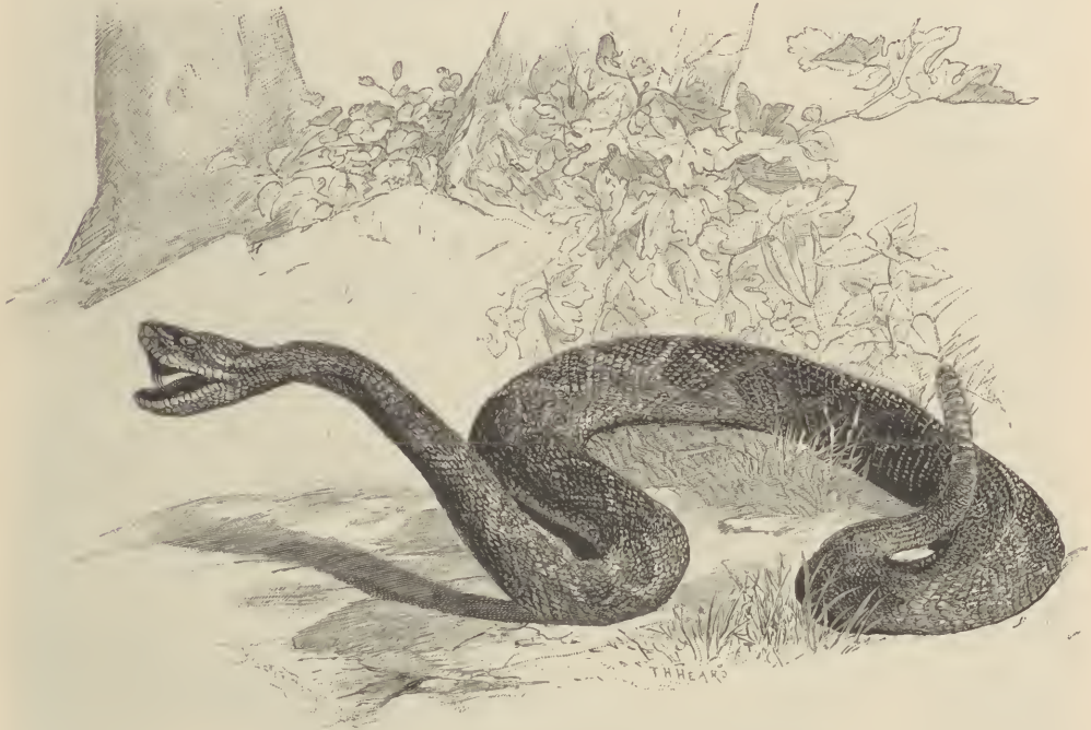
RATTLESNAKE STRIKING FROM THE UNFOLDING COIL.

off a snake's head and then pinch its tail, the stump of the neck returns and with some accuracy hits the hand of the experimenter — if he has the nerve to hold on. Few men have. I have not. A little Irishman who took care of my laboratory astonished me by coolly sustaining this test. He did it by closing his eyes and so shutting out for a moment the too suggestive view of the returning stump. Snakes have always seemed to me averse to