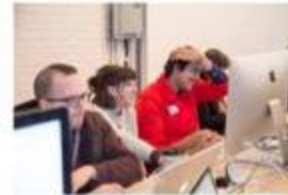
Recent Art+Feminism Edit-a-Thon at Eyebrow in Manhattan

If you've ever thought about editing Wikipedia articles or adding your own photos and images but never knew how, experts will be on hand to walk residents through the entire process.