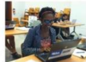
Recent Brooklyn History Edit-a-Thon at Brooklyn Central Library InfoCommons

More information: https://en.wikipedia.org/wiki/Wikipedia:Meetup/NYC