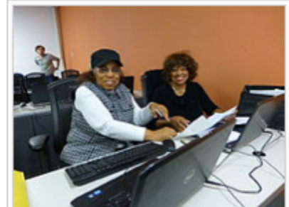
QPL Dec 6th Edit-a-thon 8

Wikimedia Commons has media related to QPL Dec 6th Edit-a-thon .