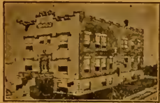
ELLEN OSBORN HOSPITAL 2800 N. TAYLOR AVENUE SAINT LOUIS

THE ELLEN OSBORN HOSPITAL finds it necessary to devote much of its main building to maternity patients and is arranging the equipment for the