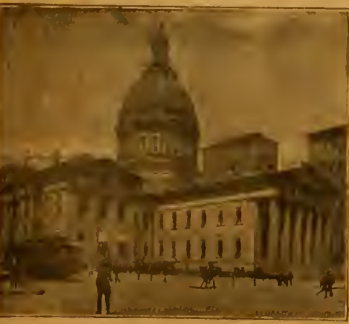
This building is also made historic by the slave sales that took place on its steps during the Civil War.

Built in 1839 on Chestnut and Market, between fourth and Fifth Streets. The site was presented by Judge J. B. C. Lucas and Colonel Auguste Chouteau. The building is in the form of a Greek cross and of Doric order of architecture. From the summit of its imposing dome a magnificent view of the busy section of the city is obtained. The atrium is well repaid for the necessary labor of climbing the long winding stairway, by this bird's-eye view. The magnificent frescoes in lunette of the dome were by Carl Wimar in 1862, a Saint Louis artist of note, and restored in 1904 by Edmund H. Wuerpel.