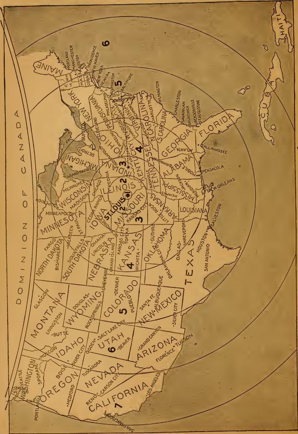
THE UNITED STATES POSTAL MAP OF ST. LOUIS AS THE CITY OF OPPORTUNITY. (Zone I, radius 50 miles; Zone II, 150 miles; Zone III, 300 miles; Zone IV, 600 miles; Zone V, 1,000 miles; Zone VI, 1,400 miles.) O—Geographical center. ★—Center of population. ----- Course of population since 1790.